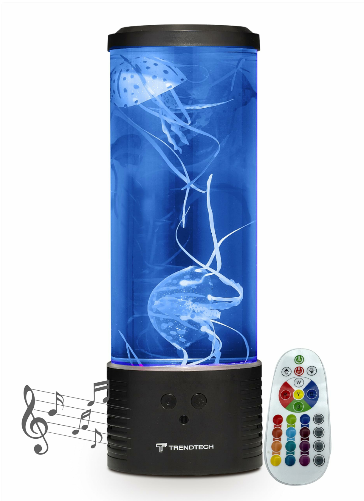
Image: The Lumina Jellyfish Mood Lamp in operation, showcasing its blue illumination and artificial jellyfish.