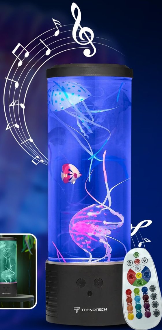
Image: The Lumina Jellyfish Mood Lamp displaying various color options and highlighting its features, including the remote control.