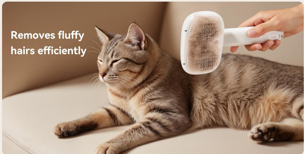
Image: Three panels illustrating the uses of the ROJECO Steam Brush: Comfort massage, Deep cleansing, and Efficient removal of fluffy hairs.