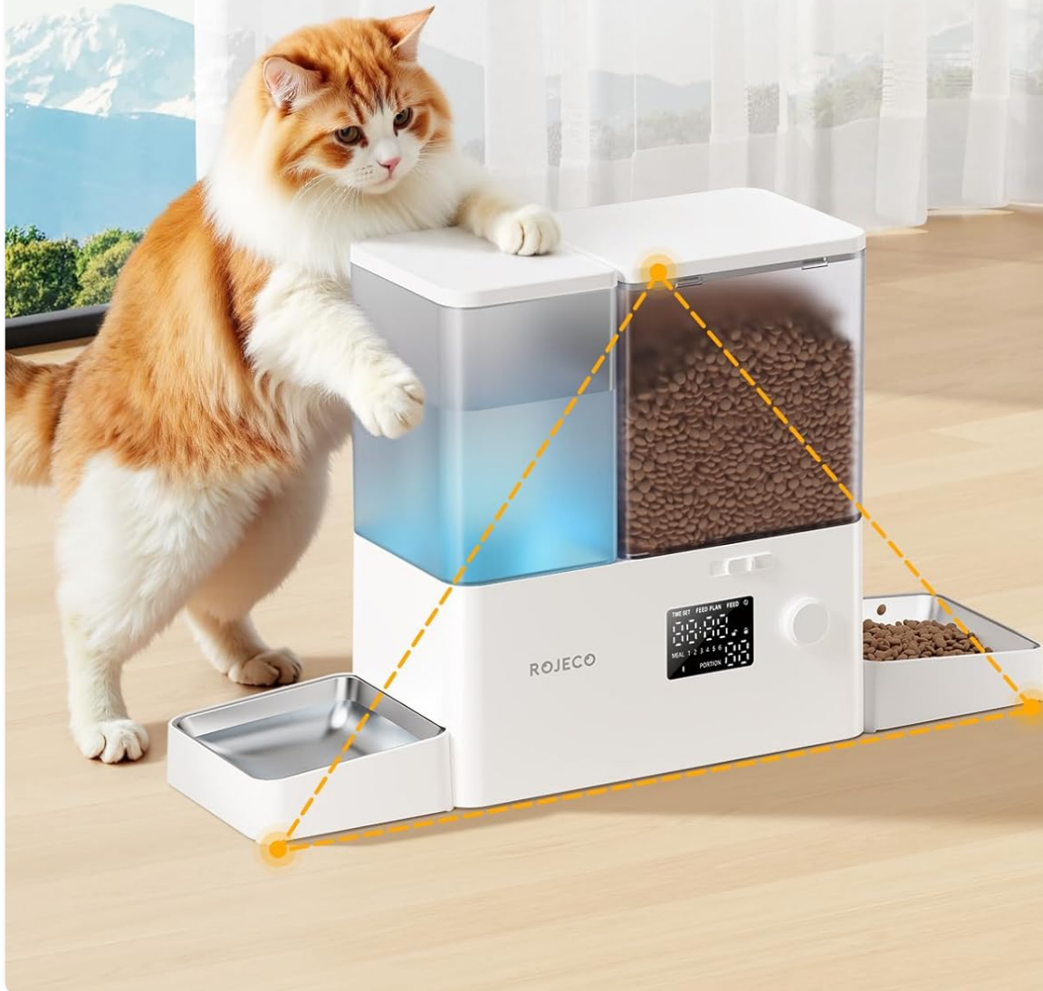
Image: A cat interacting with the ROJECO feeder, demonstrating its stabilized and anti-tipover design with non-slip pads.

The wider bottom tray with non-slip pads to prevent even naughty cats from knocking over the bowl while eating