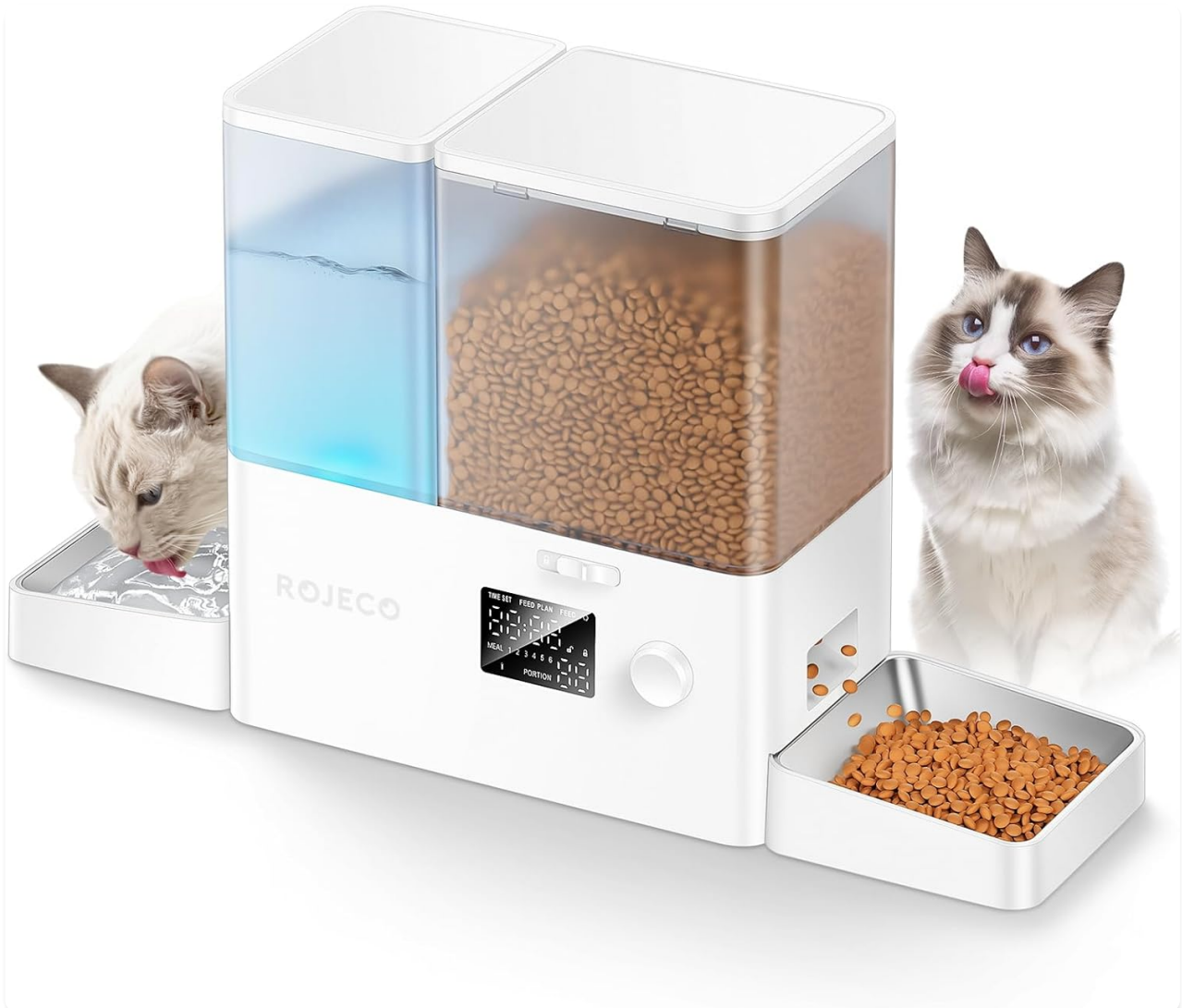
Image: The ROJECO Automatic Pet Feeder and Water Dispenser in use, with a cat drinking from the water bowl and another cat near the food bowl.

This unit provides separate compartments for dry food and water, promoting hygienic feeding. It features a transparent design for easy monitoring of levels and an upgraded roof seal for freshness.