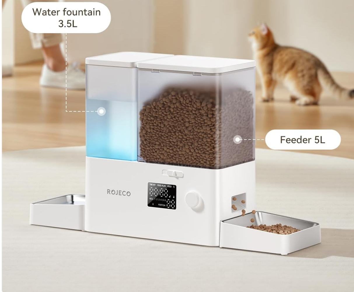
Image: The ROJECO feeder illustrating its ultra-large capacity with a 3.5L water fountain and a 5L feeder, designed for worry-free travel.

Large capacity grain storage, easy to solve the short-distance travel feeding problem