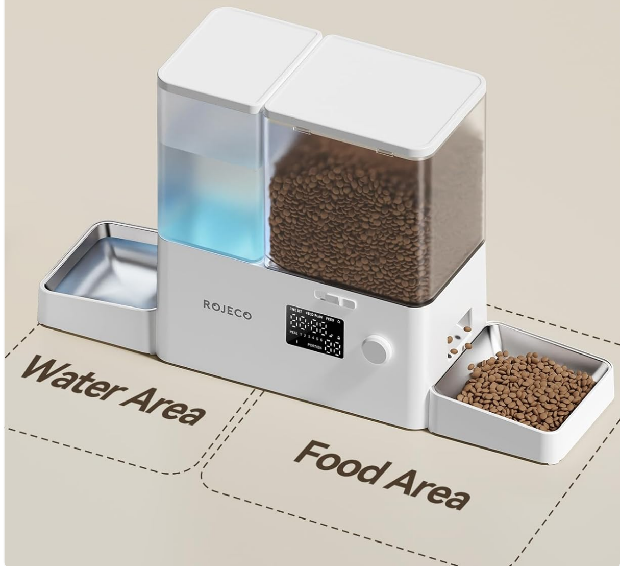
Image: The ROJECO feeder highlighting the separate 'Water Area' and 'Food Area' for wet and dry separation.

Placed oppositely, food and water do not interfere with each other, making it more scientifically aligned with pets' eating habits.