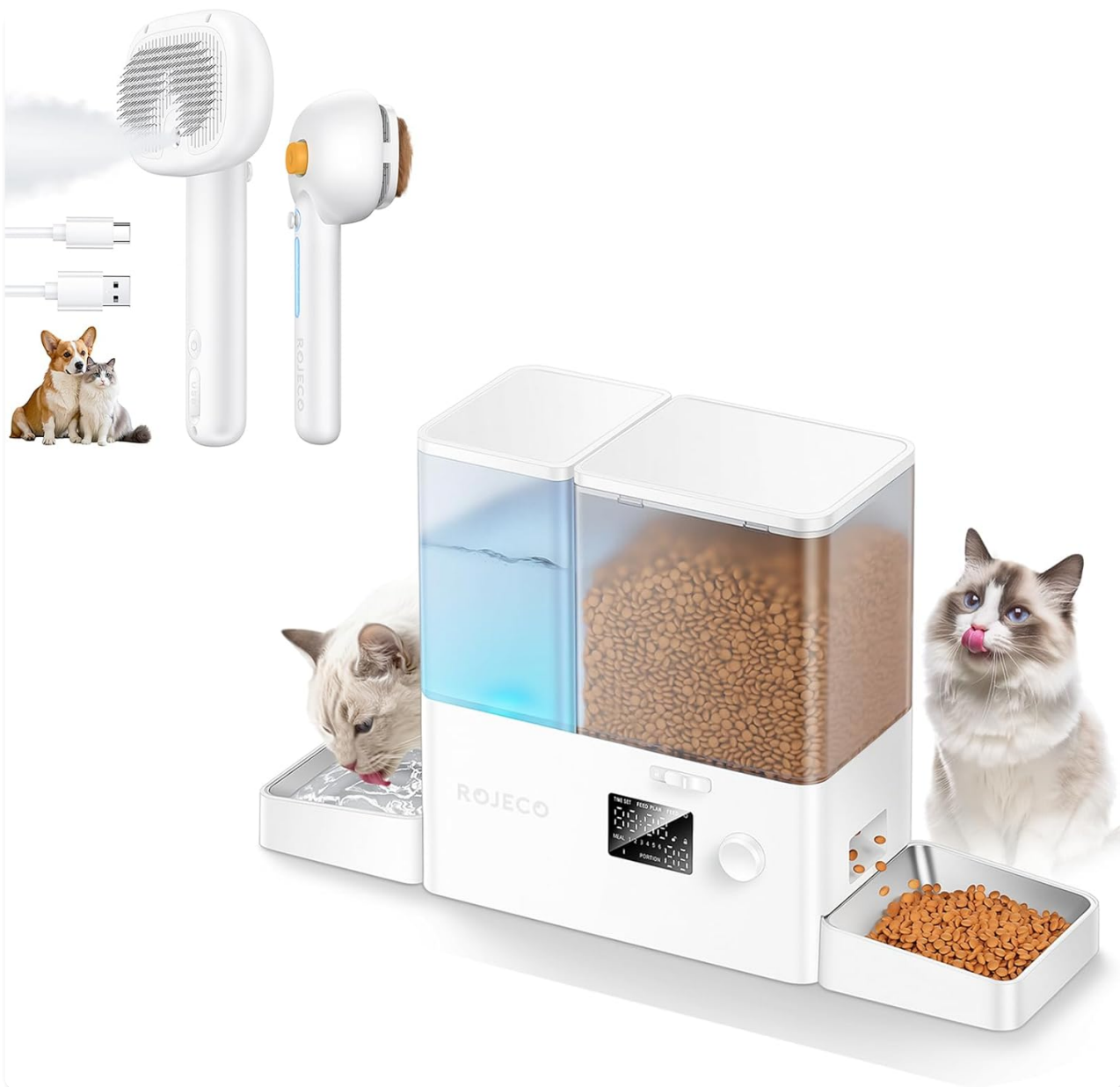
Image: The ROJECO 2-in-1 Automatic Pet Feeder and Water Dispenser shown alongside the 3-in-1 Cat Steam Brush, with two cats interacting with the feeder.