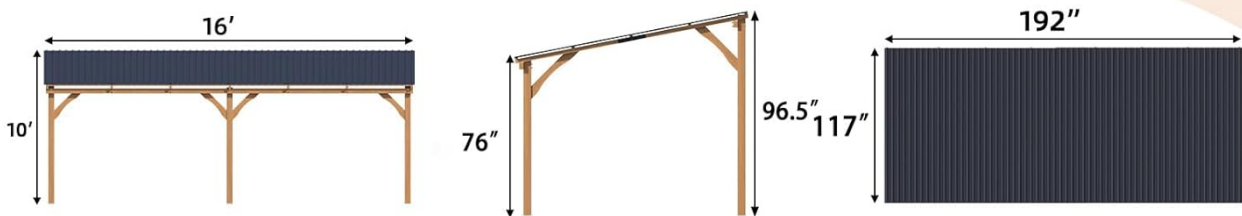
Figure 7.1: Detailed dimensions of the YODOLLA 16' x 10' Wood Gazebo.