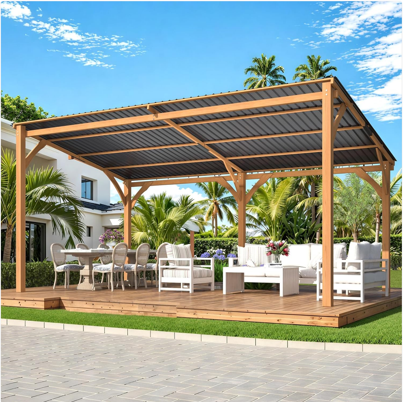
Figure 1.1: YODOLLA 16' x 10' Wood Gazebo in an outdoor setting.

The YODOLLA 16' x 10' Wood Gazebo is designed to provide a shaded and protected outdoor space. It features a durable wood frame and a hardtop roof, offering comprehensive UV protection and resistance to various weather conditions.