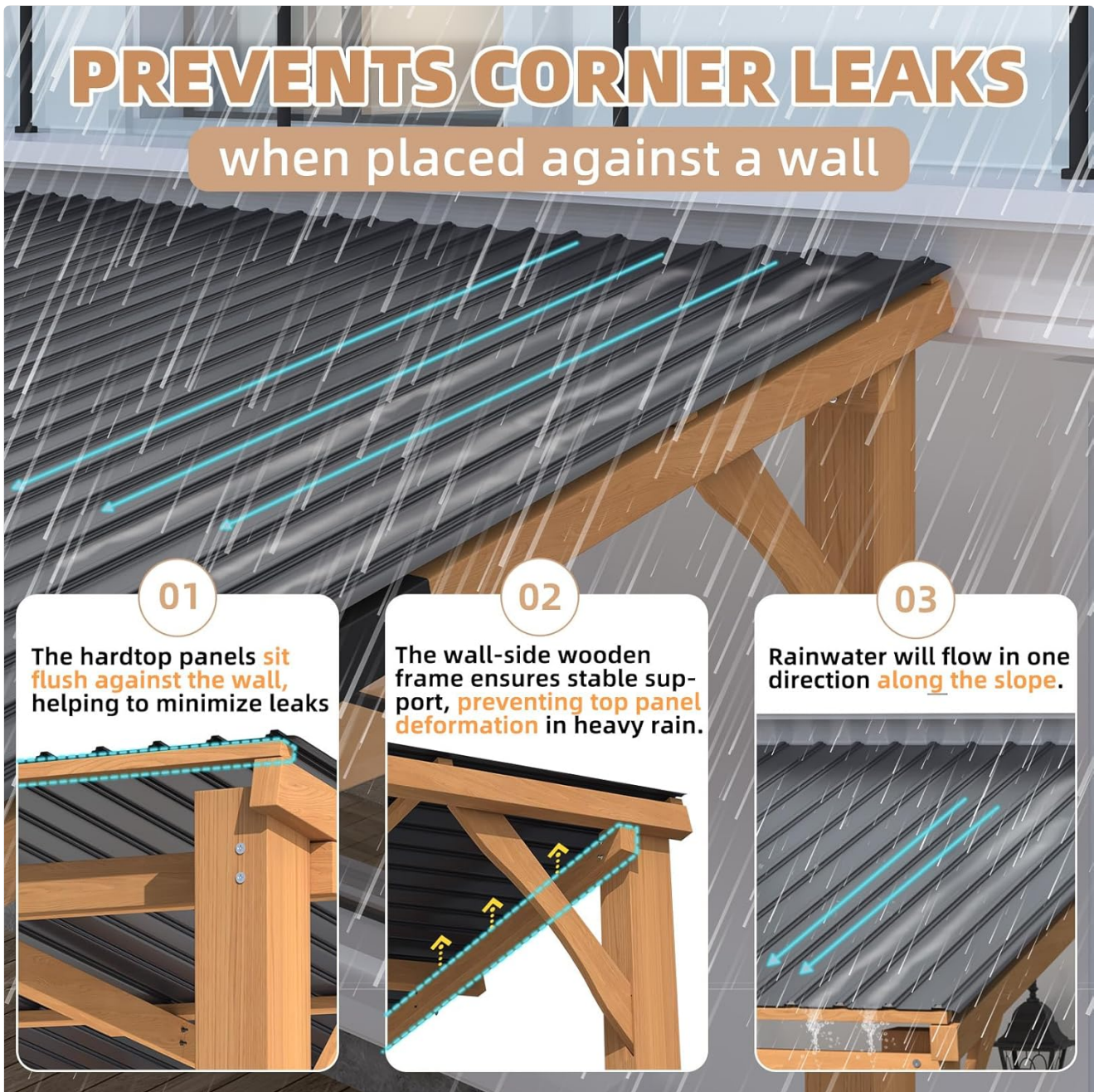
Figure 4.1: Design features that prevent corner leaks when placed against a wall.