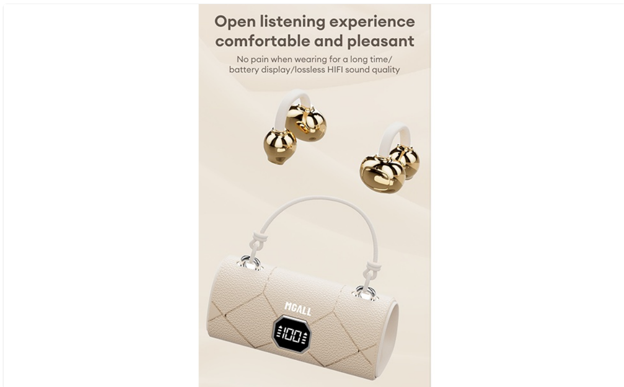
Image 1.1: Overview of Mgall X22 features and design, including the handbag-style charging case and clip-on earbuds.