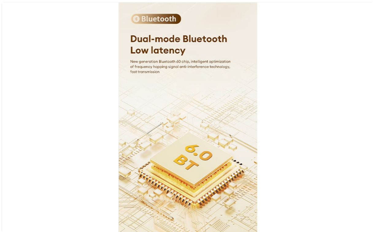
Image 4.3: The Mgal X22 headphones are suitable for both work and entertainment.