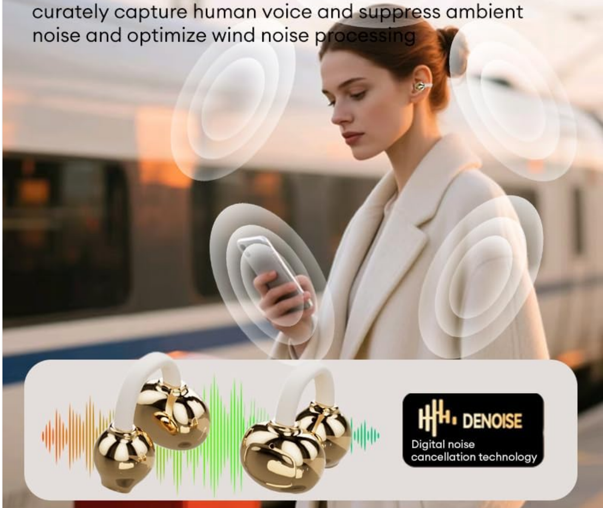
Image 2.1: The Mgall X22 charging case and earbuds, highlighting the unique design.

Dual microphone array + AI algorithm work together to accurately capture human voice and suppress ambient noise and optimize wind noise processing