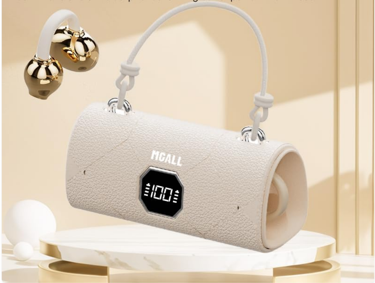
Image showing the removable earring charms that can be attached to the headphones for a personalized look.

The battery level of the charging case and earphones is displayed in real time to avoid the earphones running out of power when in use