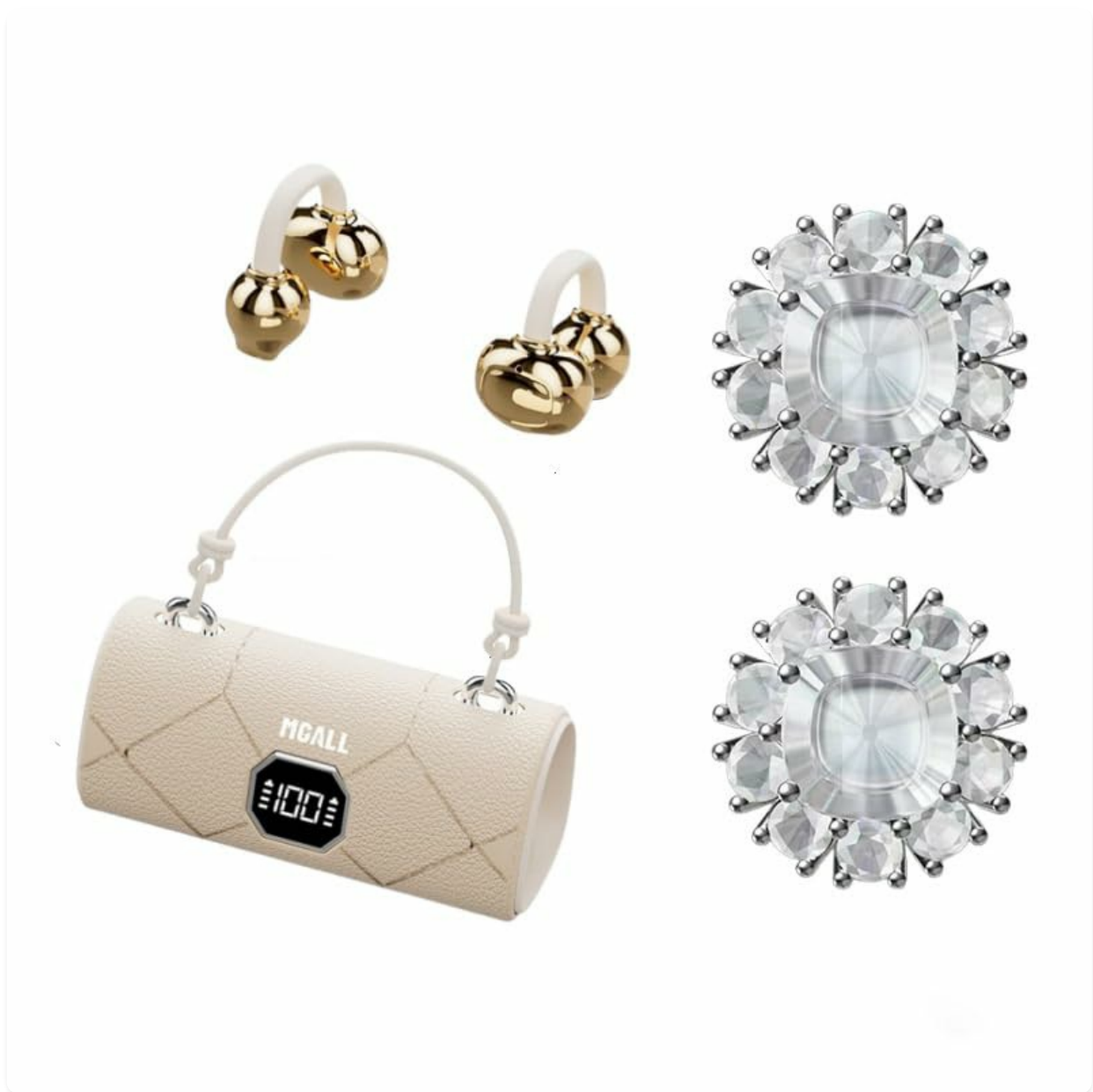
MGALL X22 Clip On Wireless Headphones in their charging case, showcasing the unique handbag-style design and open-ear earbuds.