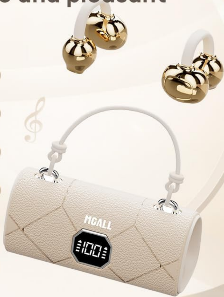
Close-up of the MGALL X22 charging case with earbuds inside, showing the green indicator light, indicating charging or readiness.