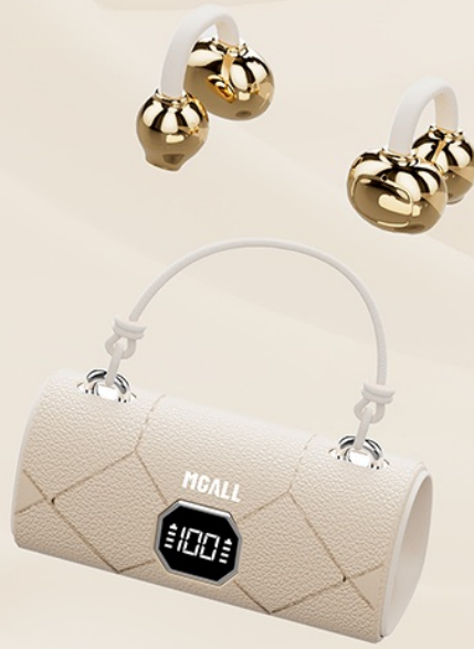
Diagram illustrating the open listening experience and key features of the MGALL X22 headphones, including comfort, battery display, lossless HiFi sound, luxury leather texture, Dual-mode Bluetooth 6.0, and open ear clip design.

No pain when wearing for a long time/ battery display/lossless HiFi sound quality