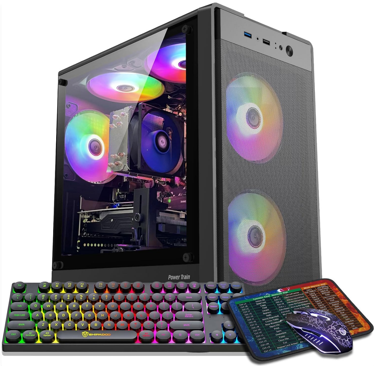
Image 1.1: ZER-LON Gaming PC Desktop Computer AOV2060 with included RGB keyboard and mouse.