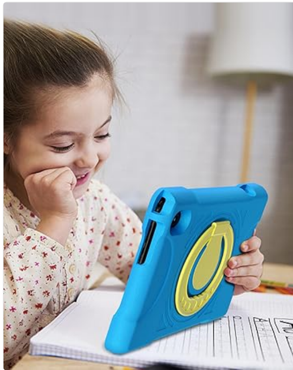
Image 7.3: The tablet supports screen mirroring for sharing content on a larger display.