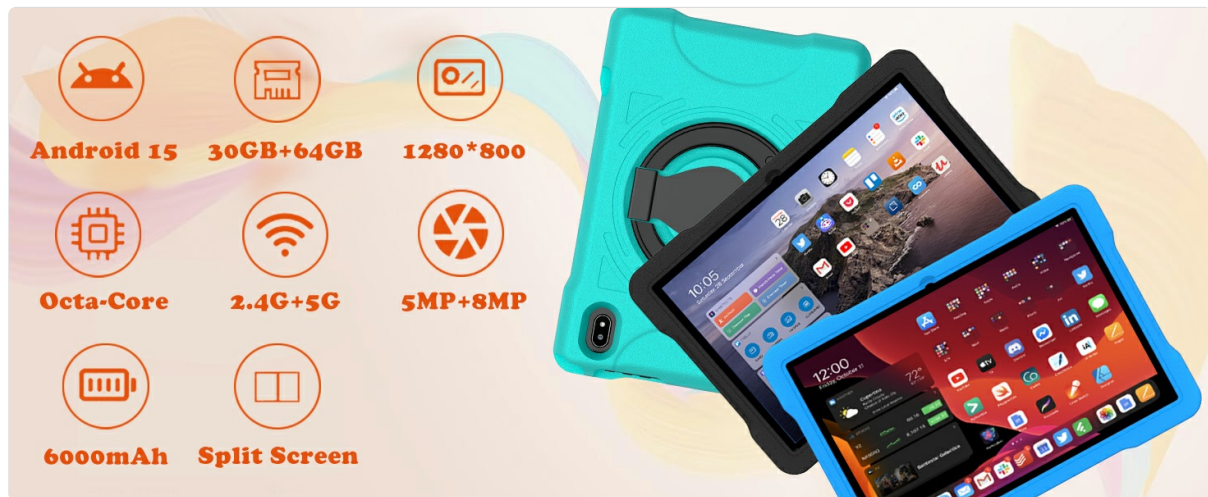
Image 9.1: The tablet offers 30GB RAM and 64GB ROM, expandable up to 1TB with a Micro SD Card.