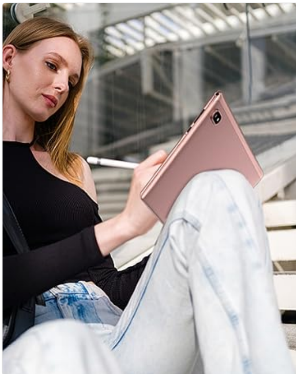
Image 7.2: The tablet features a 5MP front camera, 5MP rear camera, and a flash light for capturing moments.