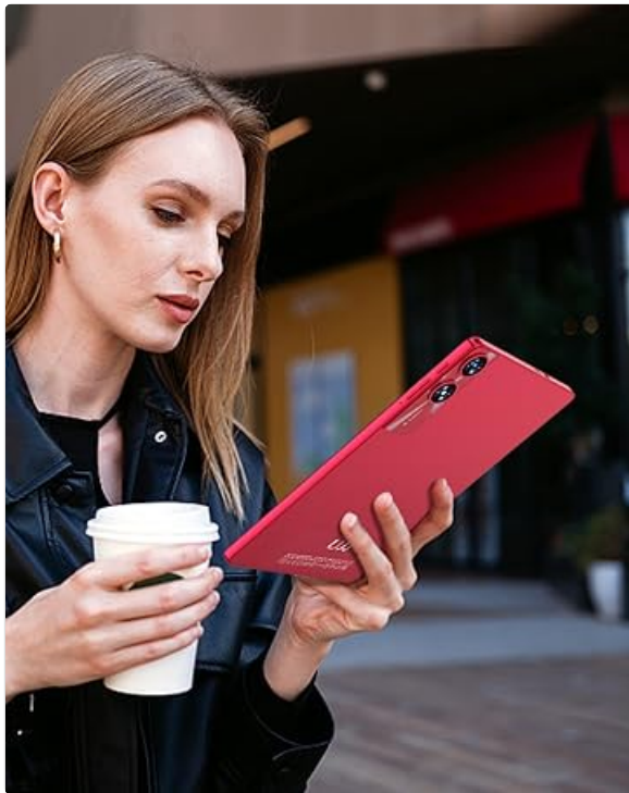
Image 7.1: Widevine L1 support allows for immersive high-definition content from popular streaming services.