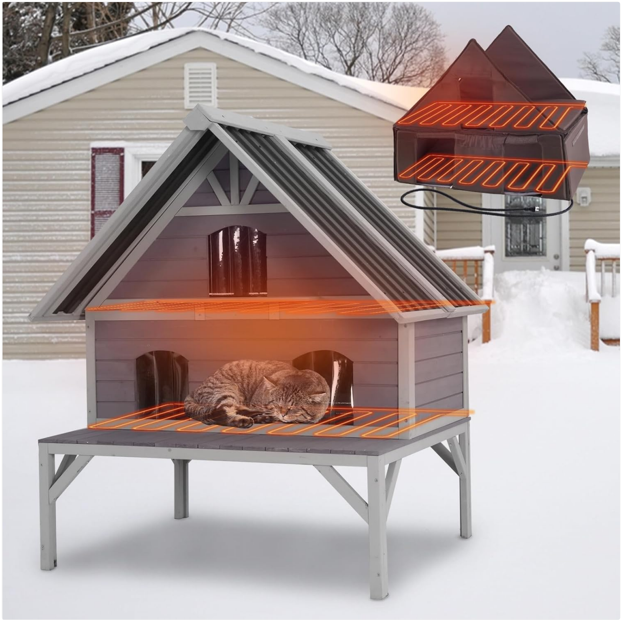
Image: The heated cat house provides a warm environment for cats in cold weather.