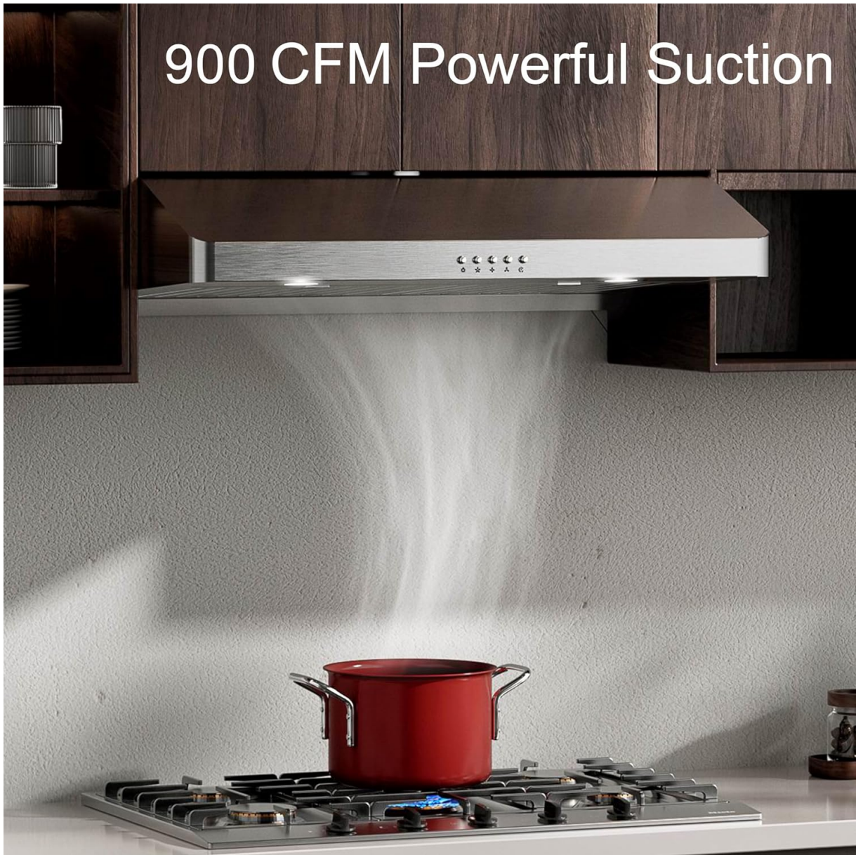
Image 6.1: The EVERKITCH EVK242 range hood effectively removing steam from a cooking pot, demonstrating its 900 CFM powerful suction.