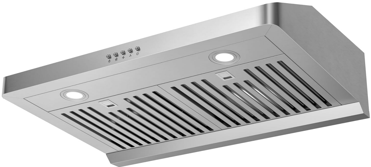
Image 1.1: EVERKITCH EVK242 30-inch Under Cabinet Range Hood, angled view.

This manual provides detailed instructions for the installation, operation, and maintenance of your EVERKITCH EVK242 30-inch Under Cabinet Range Hood. Please read this manual thoroughly before installation and use to ensure proper function and safety. Keep this manual for future reference.