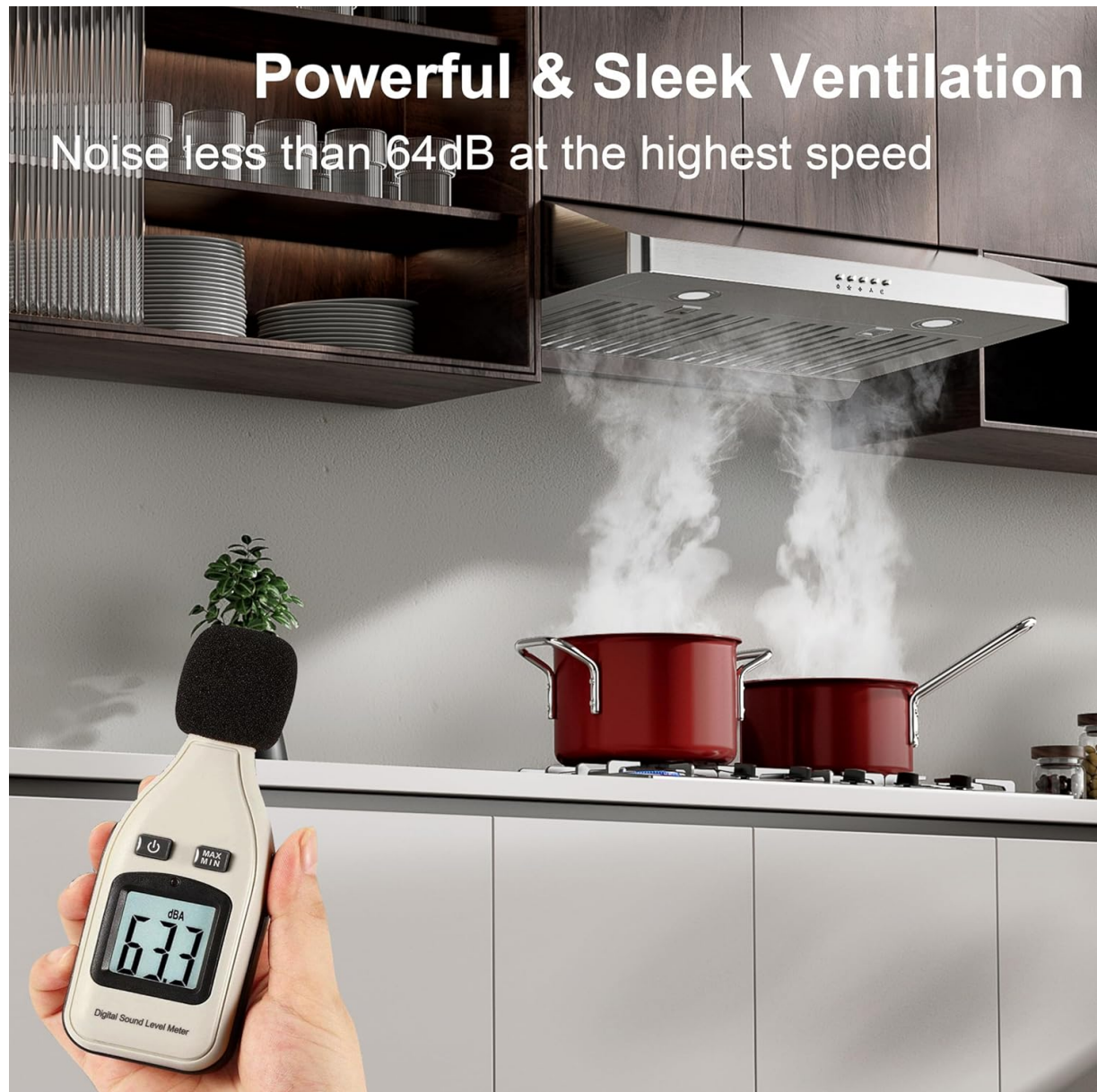
Image 6.2: A sound level meter showing 63.3 dB, illustrating the low noise operation of the EVERKITCH EVK242 range hood even at high speeds.