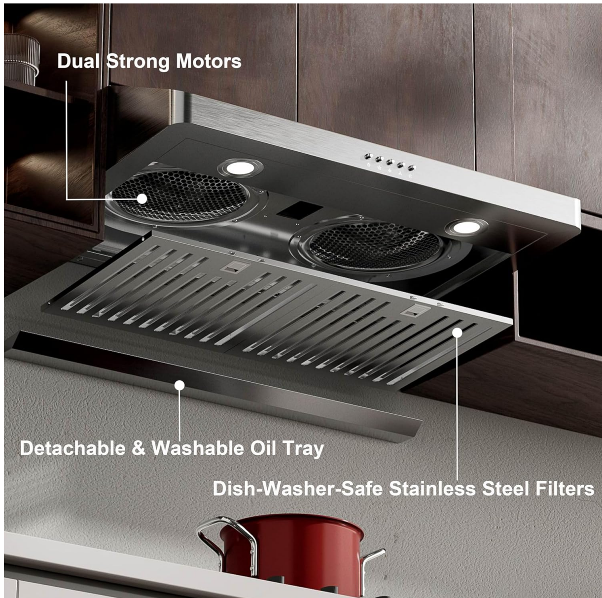
Image 7.1: An exploded view of the EVERKITCH EVK242 range hood, highlighting the dual motors, detachable oil tray, and dishwasher-safe stainless steel filters.