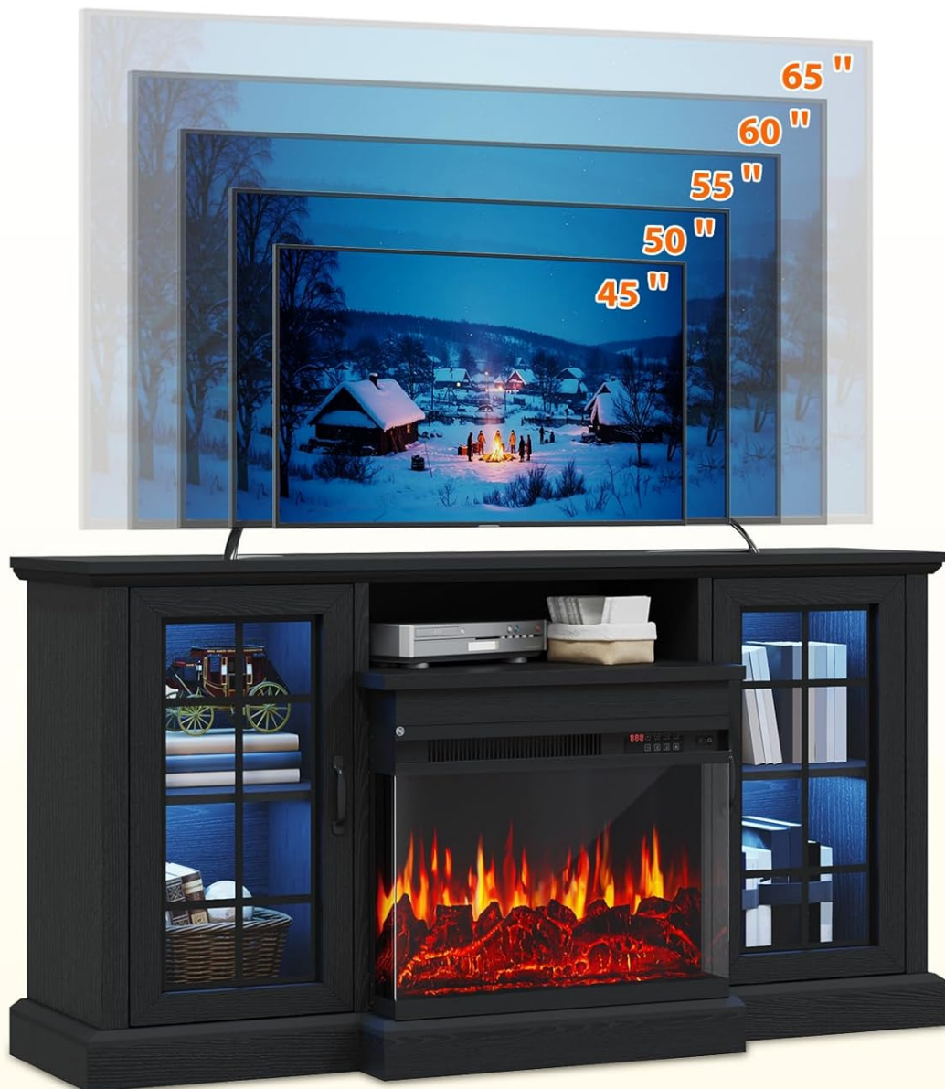
Image 6: The TV stand is compatible with various TV sizes, up to 65 inches.