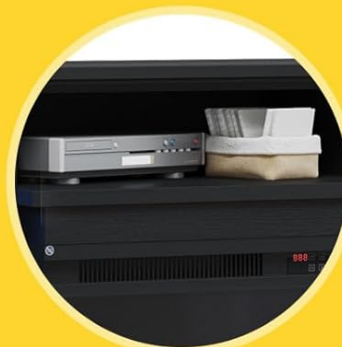
Open Storage Cabinet