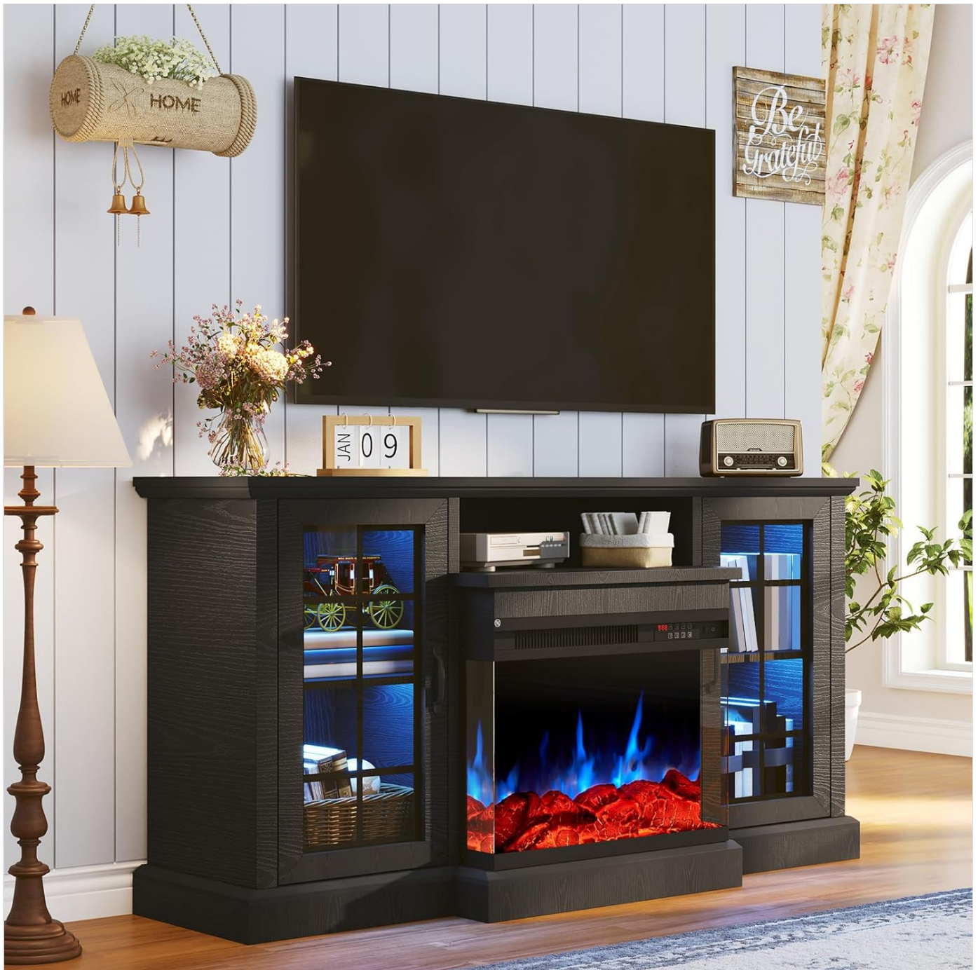
Image 1: The OneBlis 59-inch Fireplace TV Stand with a television and decorative items.