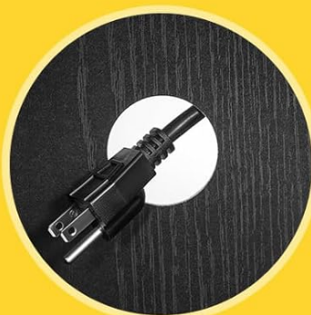
Large Cabel Holes