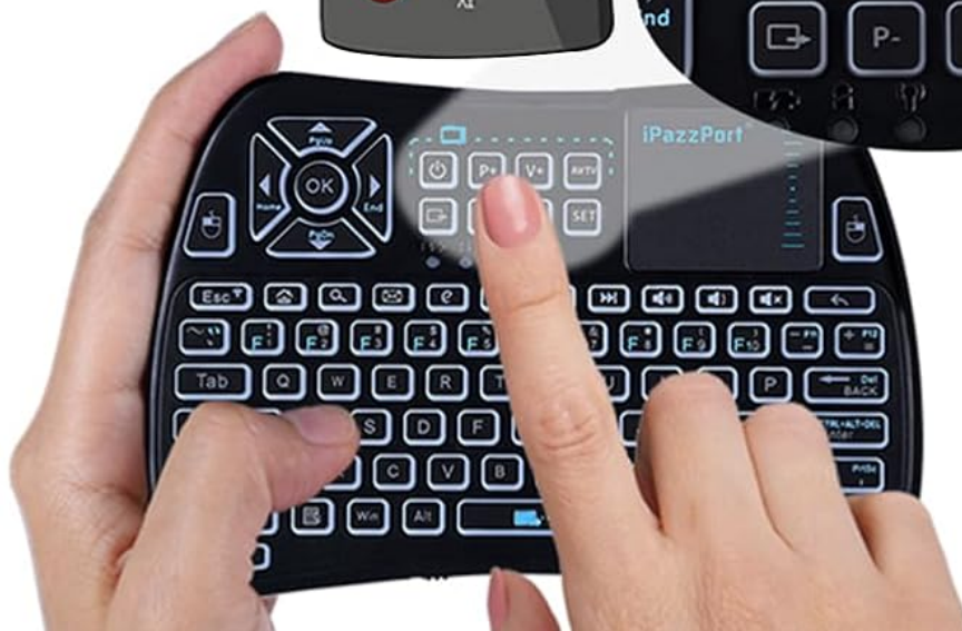
Image: Diagram illustrating the IR learning process, showing the iPazzPort keyboard and an original remote facing each other, with programmable buttons highlighted.