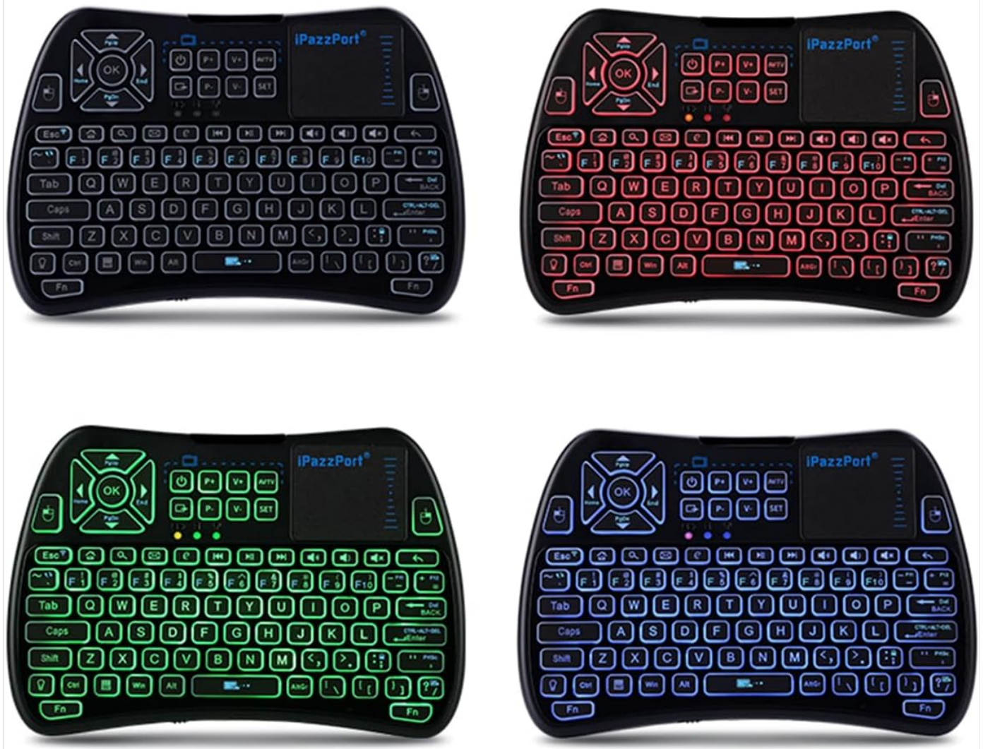
Image: Four views of the iPazzPort keyboard, demonstrating the red, green, and blue backlight options, as well as the unlit state.

Bright & Clear for Gaming, Streaming, and Night Use