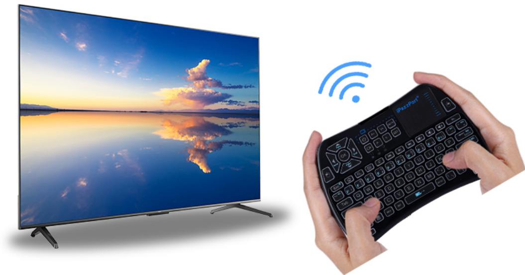
Image: The iPazzPort keyboard with a hand demonstrating touchpad usage for precise control and navigation.

Enjoy precise control with the built-in touchpad scroll, click, and navigate smoothly without needing a separate mouse Perfect for browsing, streaming