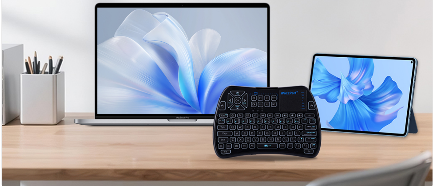
Image: The iPazzPort keyboard demonstrating its universal compatibility with various devices like laptops, tablets, and smart TVs.

Works with Smart TV, Android TV box, Fire Stick, PC, laptop, and projector Ideal for home theater, office presentations, or travel entertainment