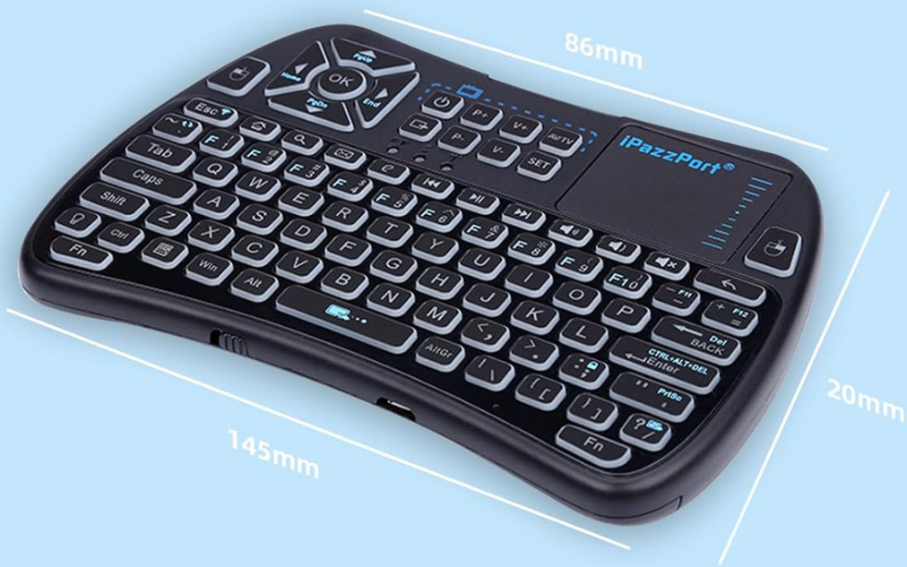
Image: The iPazzPort keyboard with dimensions (145mm x 86mm x 20mm) highlighting its compact and portable design.

Pocket Size Mini Keyboard, Easy to Carry Anywhere