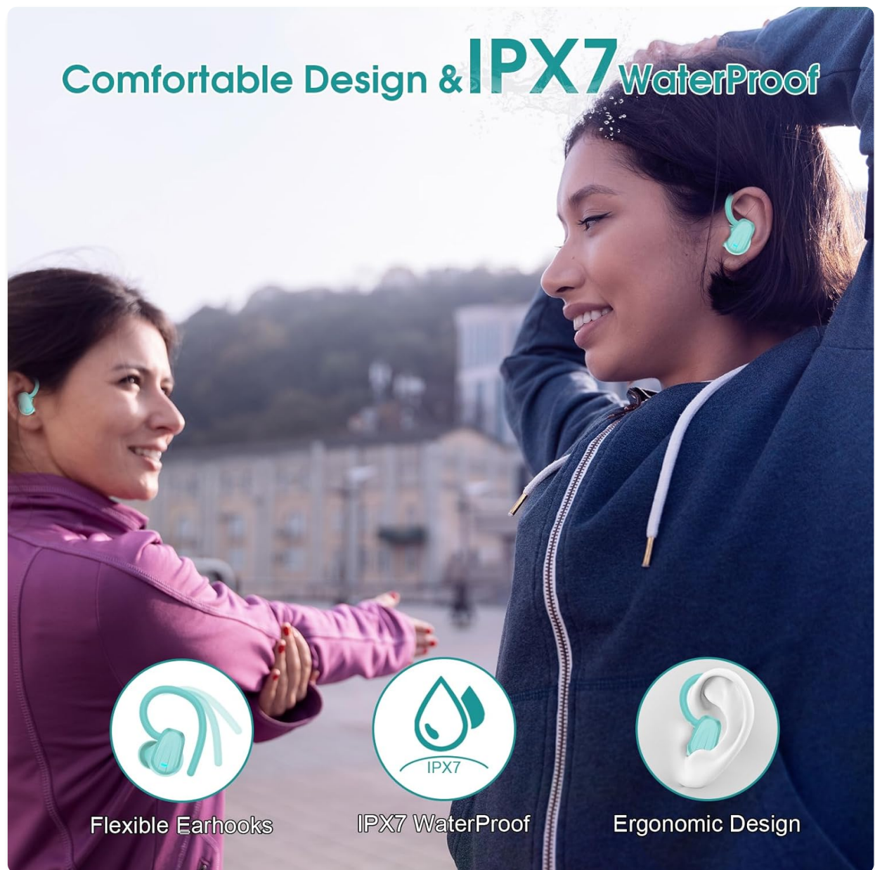
Image: Proper wearing of Jesebang S75 Earbuds with earhooks.