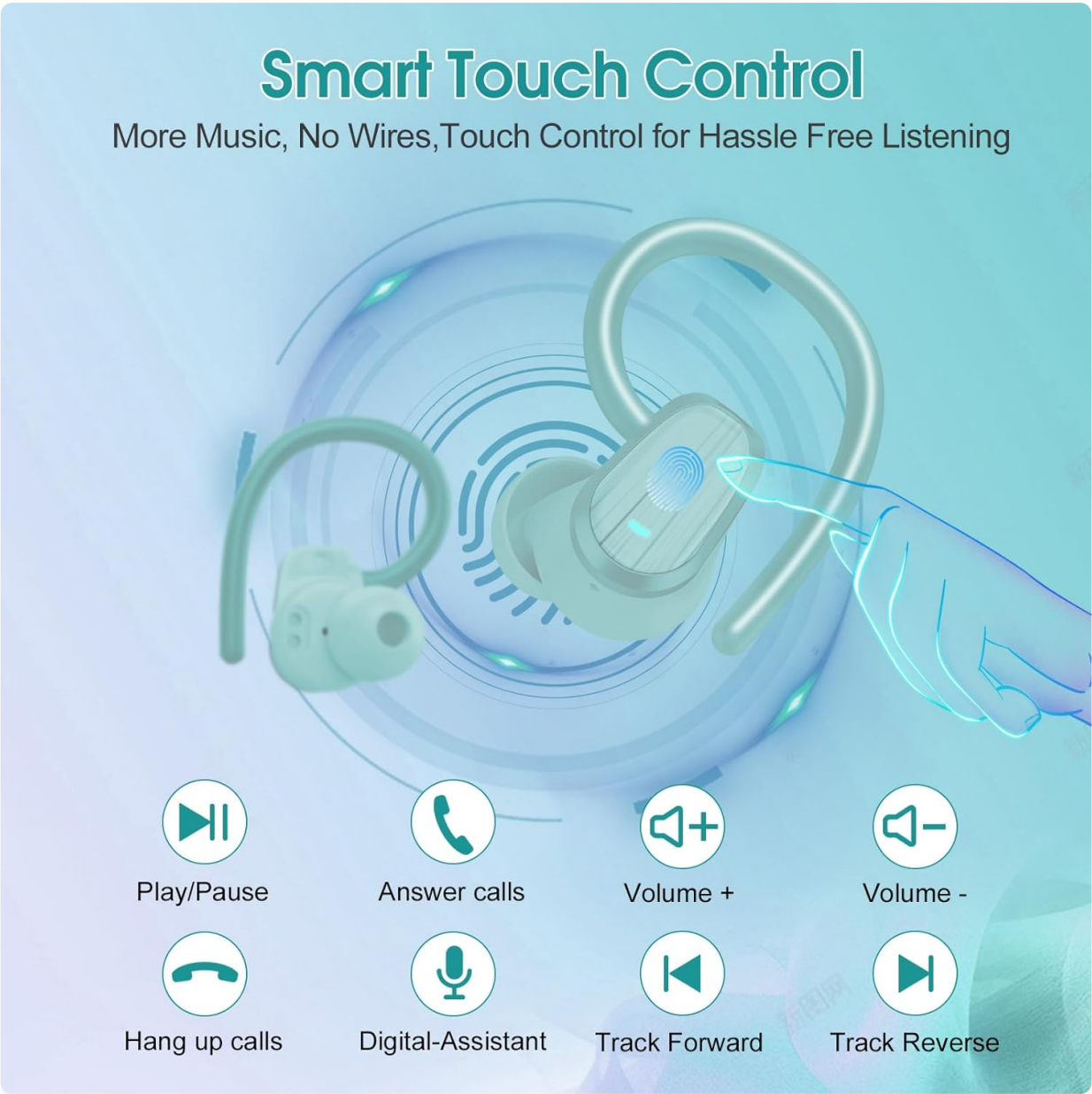
Image: Smart Touch Control functions on the S75 Earbuds.