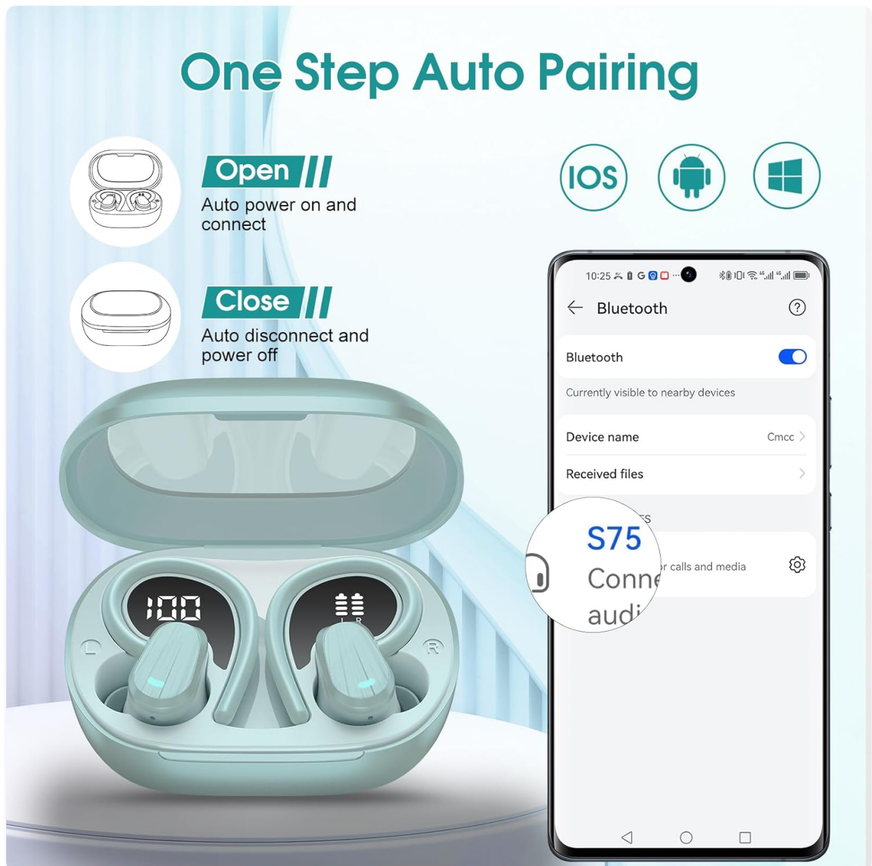
Image: One-step auto-pairing process for Jesebang S75 Earbuds.

last paired device when you open the charging case.