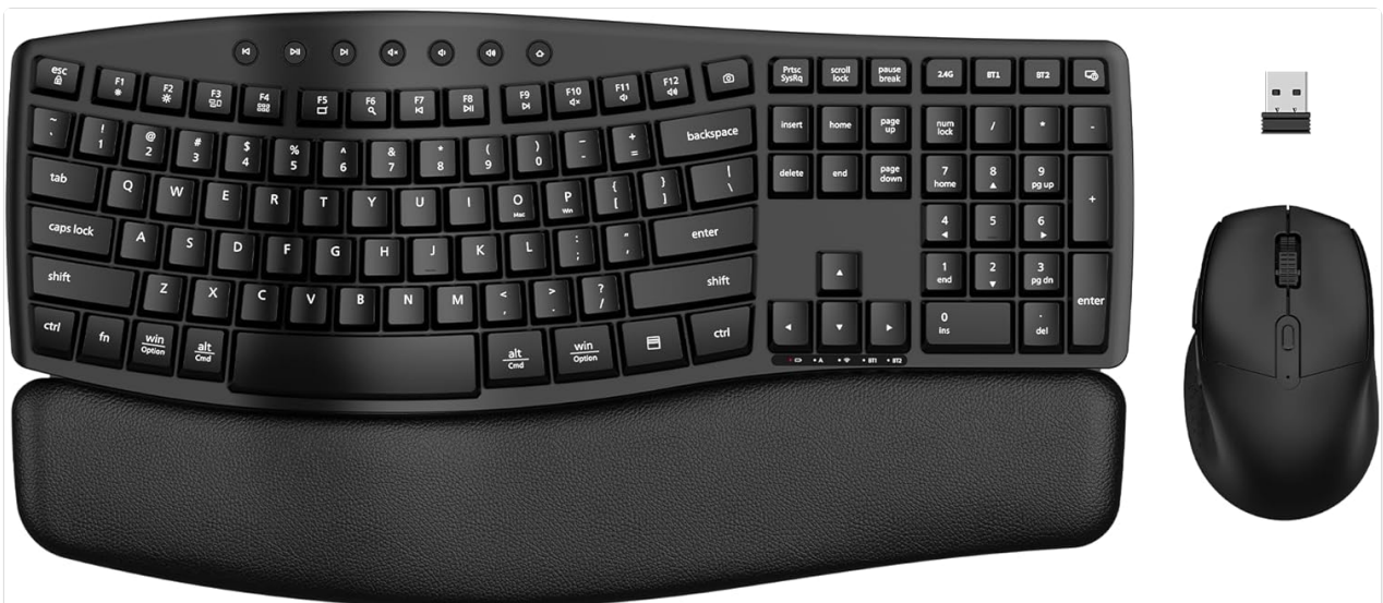
Image: The EDJO Ergonomic Wireless Keyboard and Mouse Combo, showcasing the keyboard with its integrated wrist rest and the accompanying wireless mouse.

The EDJO Ergonomic Wireless Keyboard and Mouse Combo is designed to provide a comfortable and efficient computing experience. This combo features an ergonomic keyboard with a soft foam wrist rest and a wavy key design, alongside a responsive wireless mouse with adjustable DPI settings. It supports dual-mode wireless connectivity (Bluetooth and 2.4G) for versatile use across various devices and operating systems.