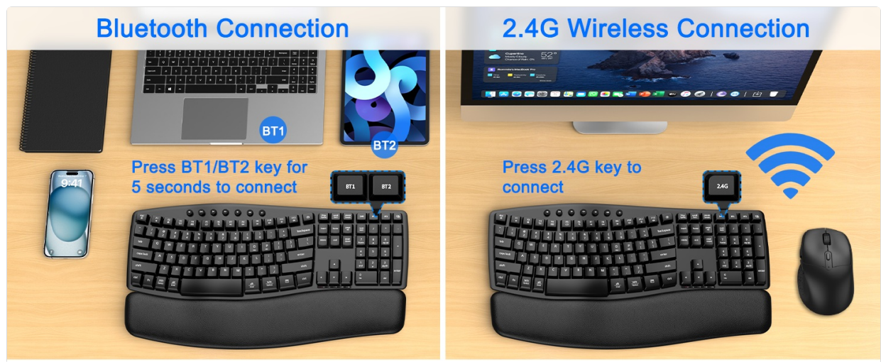
Image: Instructions for connecting the keyboard and mouse via 2.4G wireless using the USB receiver, showing the receiver and connection indicator.