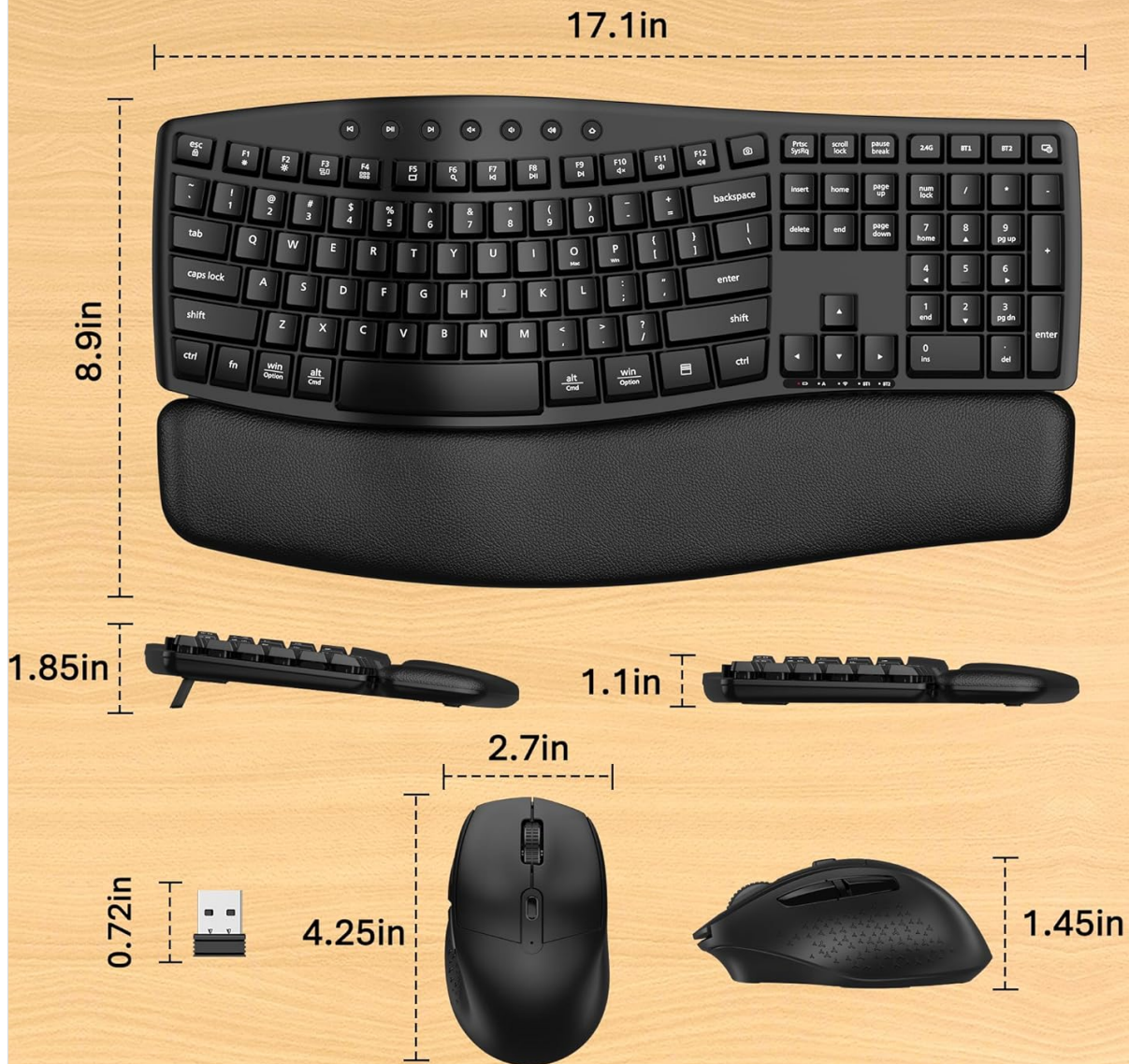
Image: Detailed dimensions of the full-size wireless keyboard and mouse, providing measurements for both components and the USB receiver.