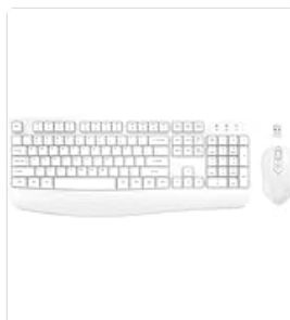
Image: The keyboard with its adjustable foldable stand extended, providing a comfortable typing angle.