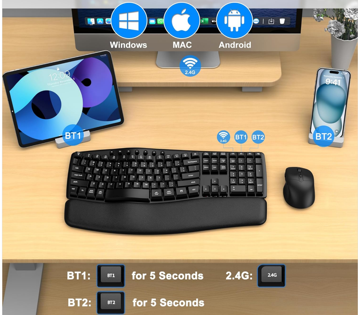
Image: A visual guide demonstrating how to connect the keyboard and mouse to various devices (Windows, Mac, Android) using both 2.4G and Bluetooth (BT1, BT2) modes.

Notes: Both The Keyboard And Mouse Share The Same USB Receiver