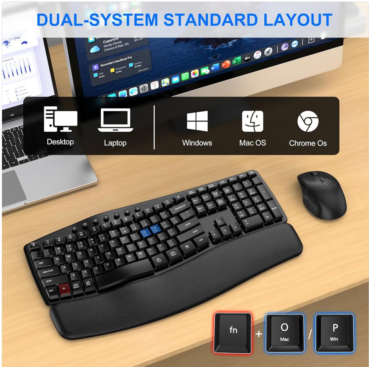
Image: The keyboard demonstrating the dual-system layout, highlighting the 'Fn + O' (Mac) and 'Fn + P' (Windows) keys for switching operating system compatibility.