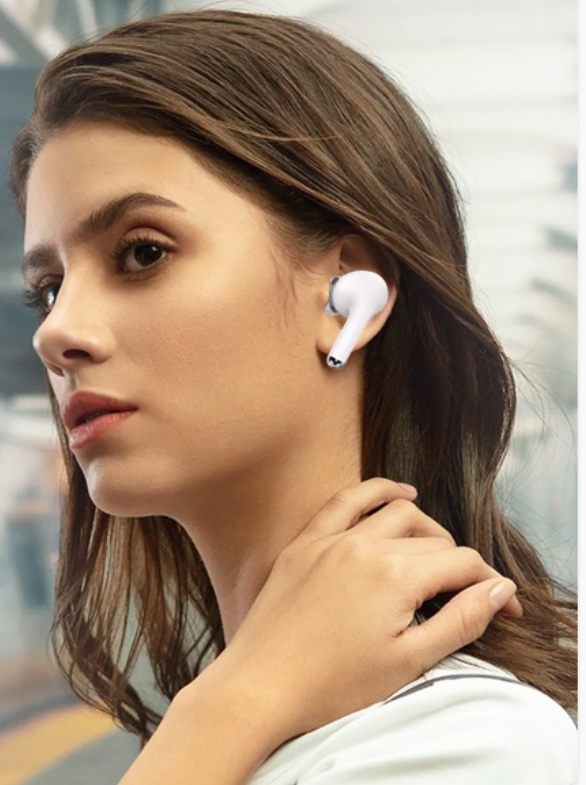
Image: The aopiata AP09 earphones being used in different settings, including web conferences, commuting, studying, and exercising, highlighting their versatility and long battery life.