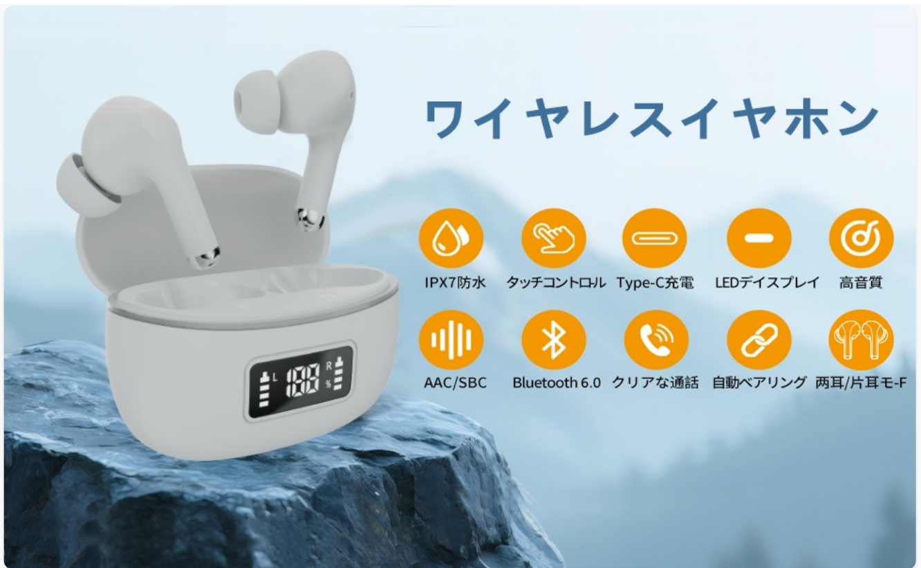
Image: aopiata AP09 Wireless Earphones and Charging Case. The image highlights key features such as IPX7 waterproofing, touch control, Type-C charging, LED display, high sound quality, AAC/SBC support, Bluetooth 6.0, clear calls, automatic pairing, and single/dual ear mode.

The charging case features an LED display that shows the battery level of both the charging case and each earbud, allowing you to easily monitor power status.