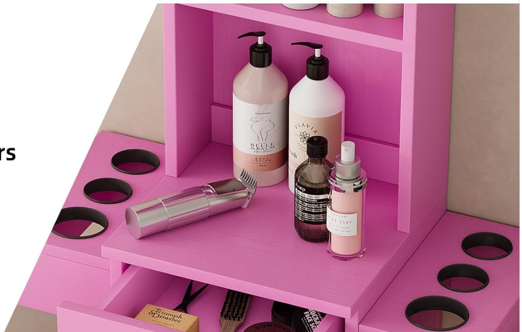
Figure 4.1.2: The station features two storage drawers and six tool holders for organizing various salon equipment.