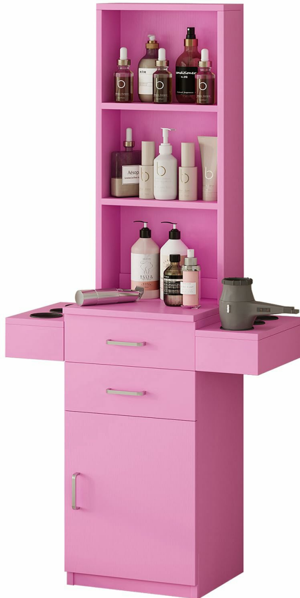
Figure 3.2.1: Overall dimensions of the salon station. The station measures approximately 26 inches (L) x 13 inches (W) x 70 inches (H).