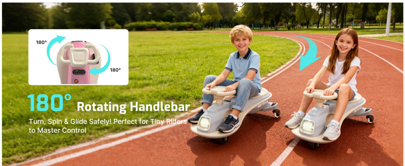
Figure 5.3: 180° Rotating Handlebar for Control