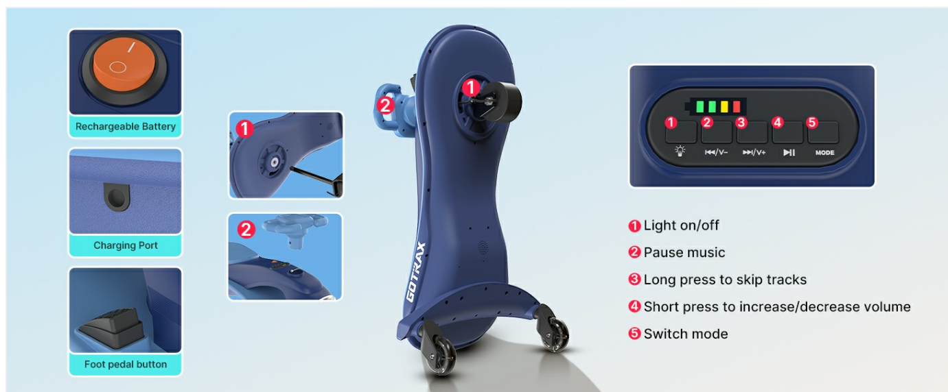
Figure 5.1: Control Panel Overview