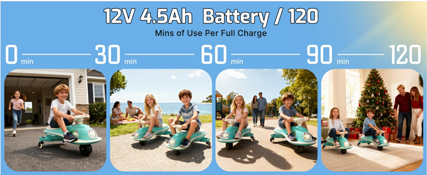
Figure 6.1: 120 Minutes of Use Per Full Charge