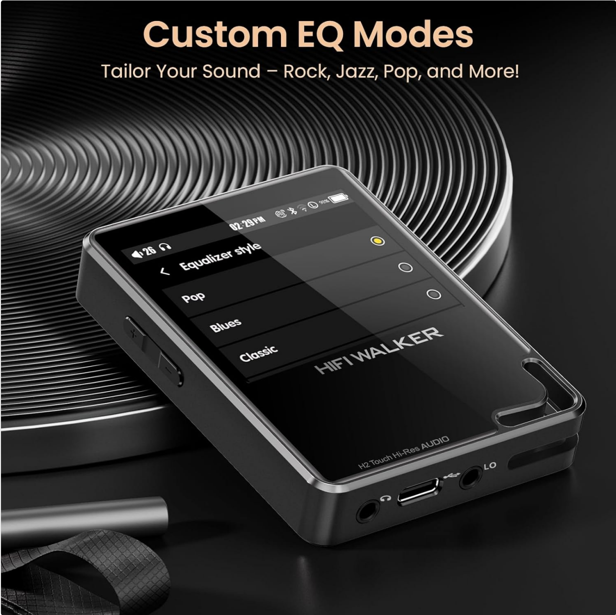
Figure 4: Custom Equalizer modes for personalized audio.

The H2 Touch features a digital stereo MIC for high-fidelity recording. Access the 'Record' function from the main menu to start, pause, and save recordings.