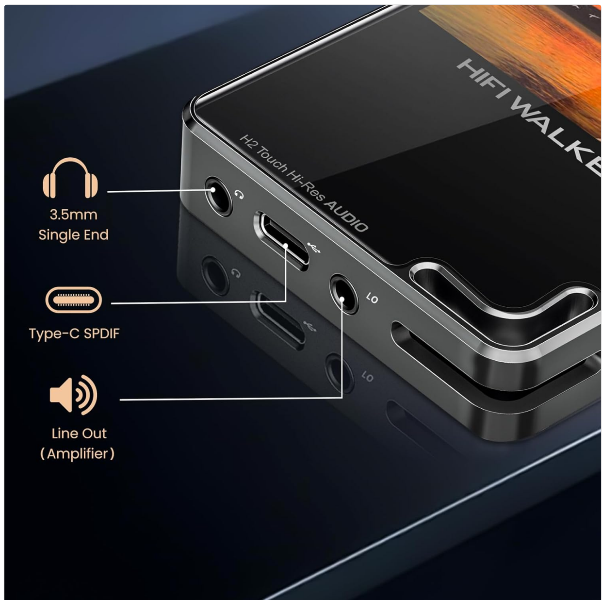
Figure 3: Detailed view of the device's ports.