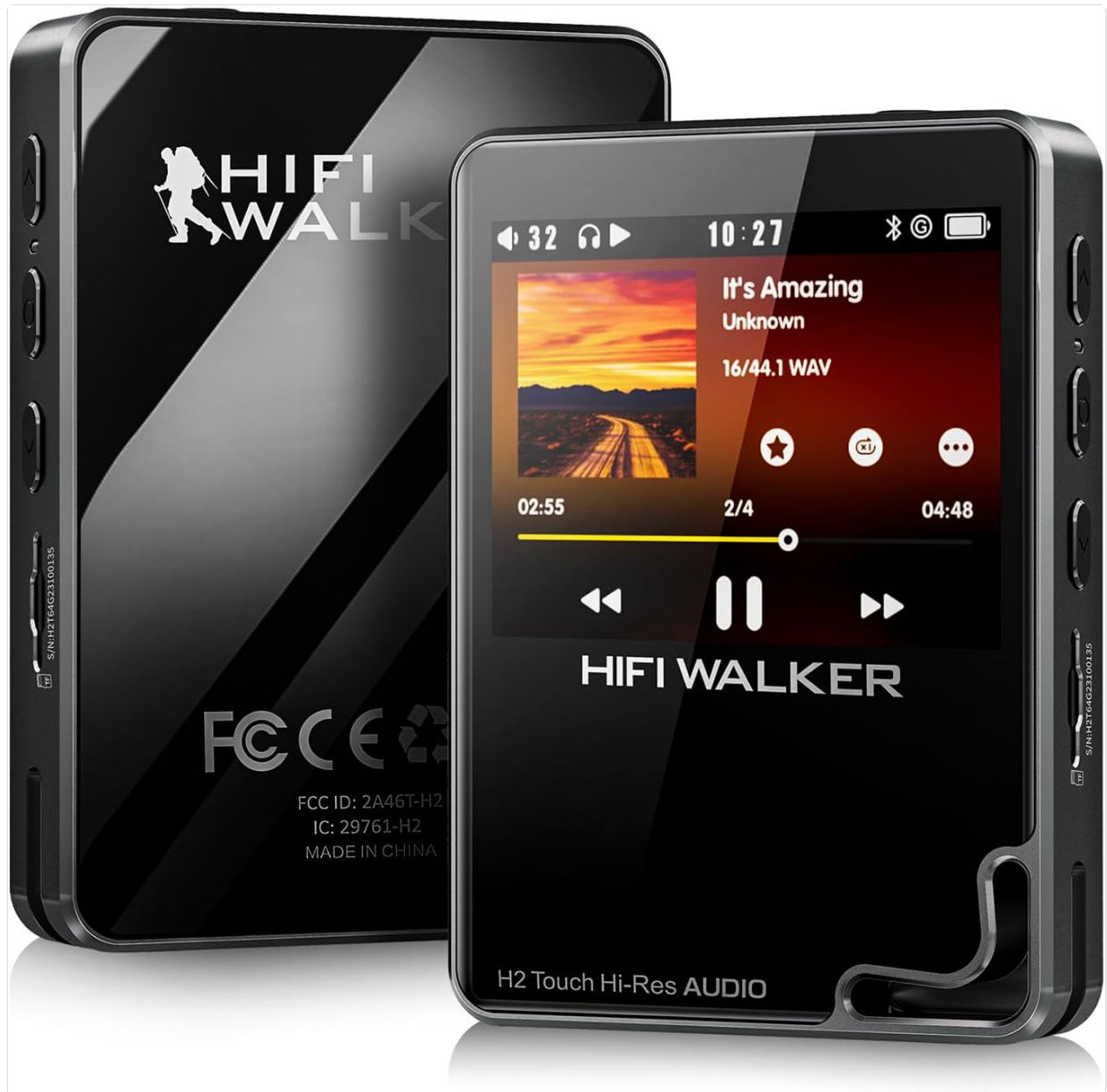
Figure 1: Front and back view of the HIFI WALKER H2 Touch MP3 Player.

The HIFI WALKER H2 Touch features a compact design with a 2.4-inch display and strategically placed physical controls.