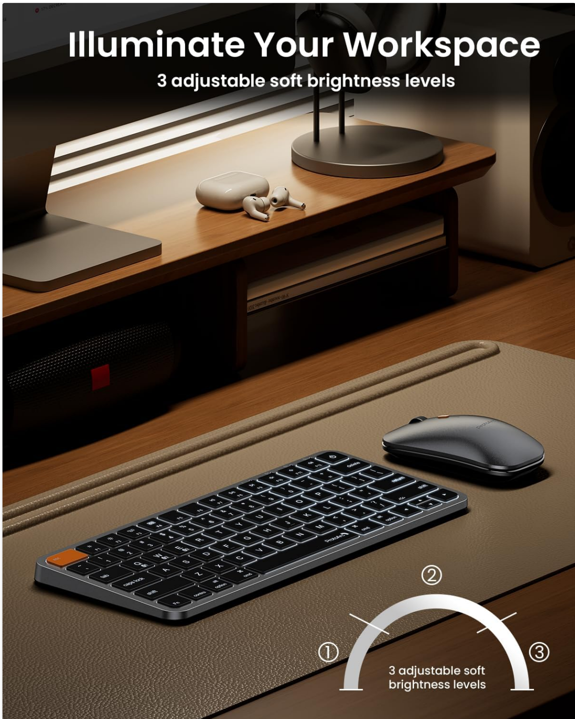
Figure 5: Adjustable Backlighting. The keyboard offers three levels of soft white backlighting for comfortable use in any environment.