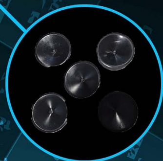
5 removable suction cups

Adjustable sensitivity levels allow customization for various racing scenarios.