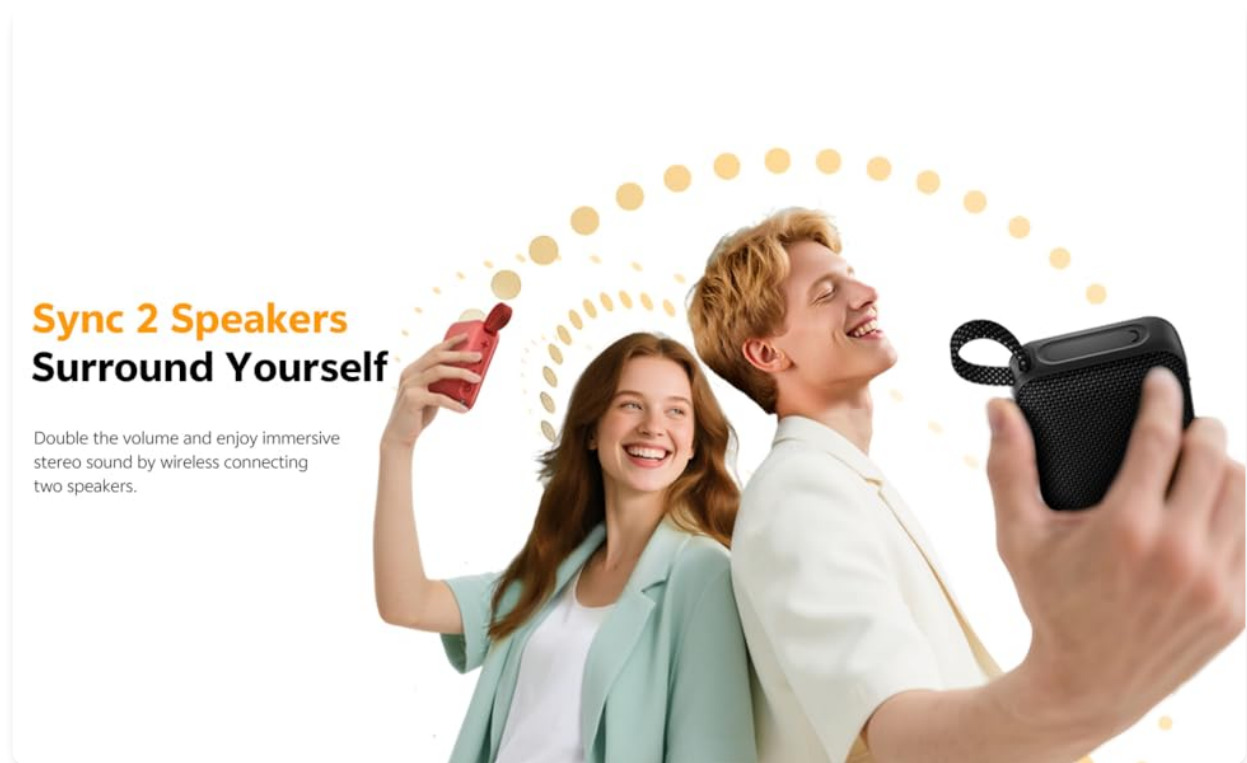
Image 3.1: Key features and design elements of the QCY SP2 speaker.

Familiarize yourself with the speaker's components and controls.