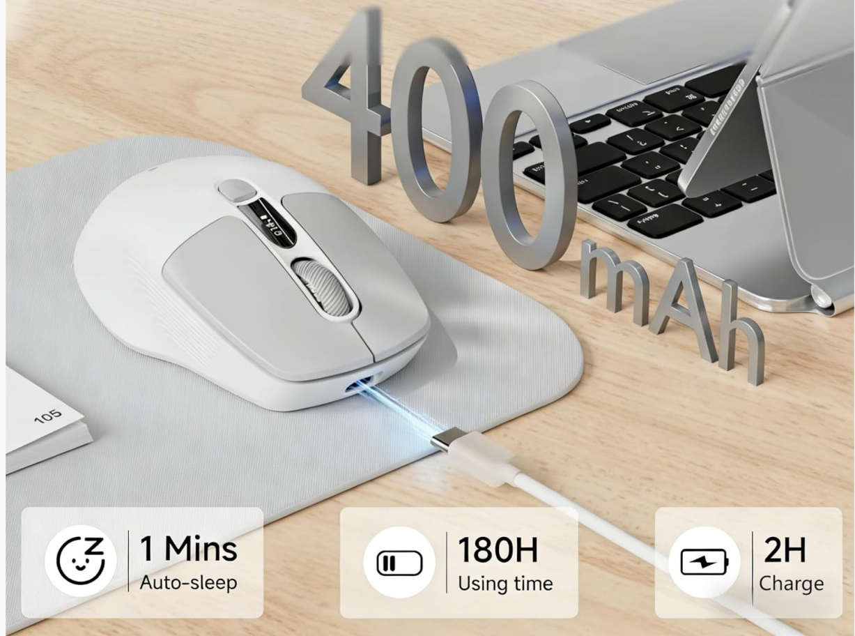
Image: The SEUNKWANG Q1 mouse connected to a Type-C charging cable, highlighting its 400mAh battery, 180H usage time, 1 minute auto-sleep, and 2-hour charge time.

Note: Do not use a fast charger. Use the supplied cable only.