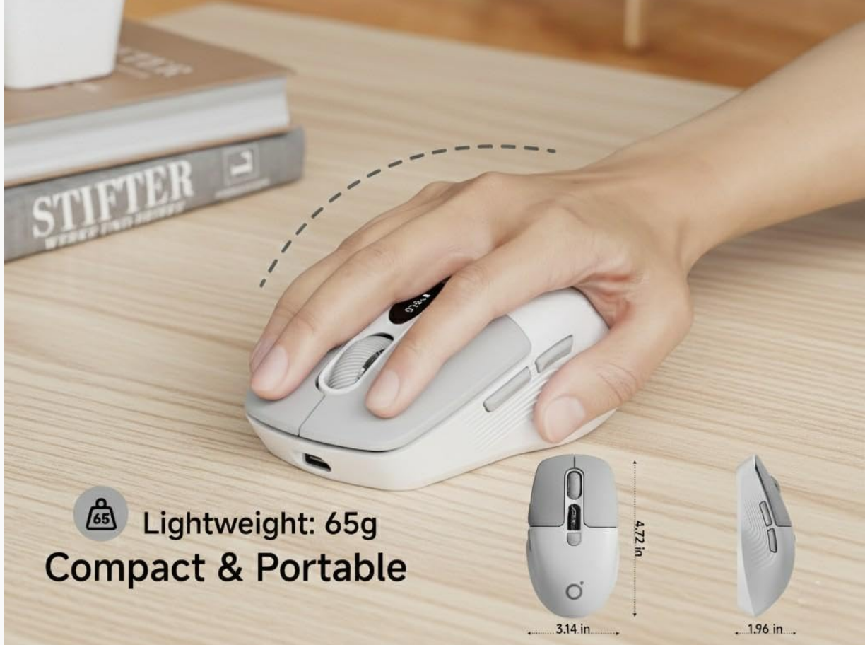
Image: A hand demonstrating the comfortable grip of the SEUNKWANG Q1 mouse, emphasizing its 65g ultra-lightweight, compact, and portable ergonomic design, suitable for small to medium hands.