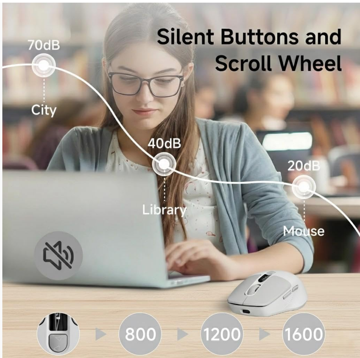
Image: A user operating the SEUNKWANG Q1 silent mouse in a quiet environment, demonstrating its 90% noise reduction compared to standard mice, making it ideal for focused work.