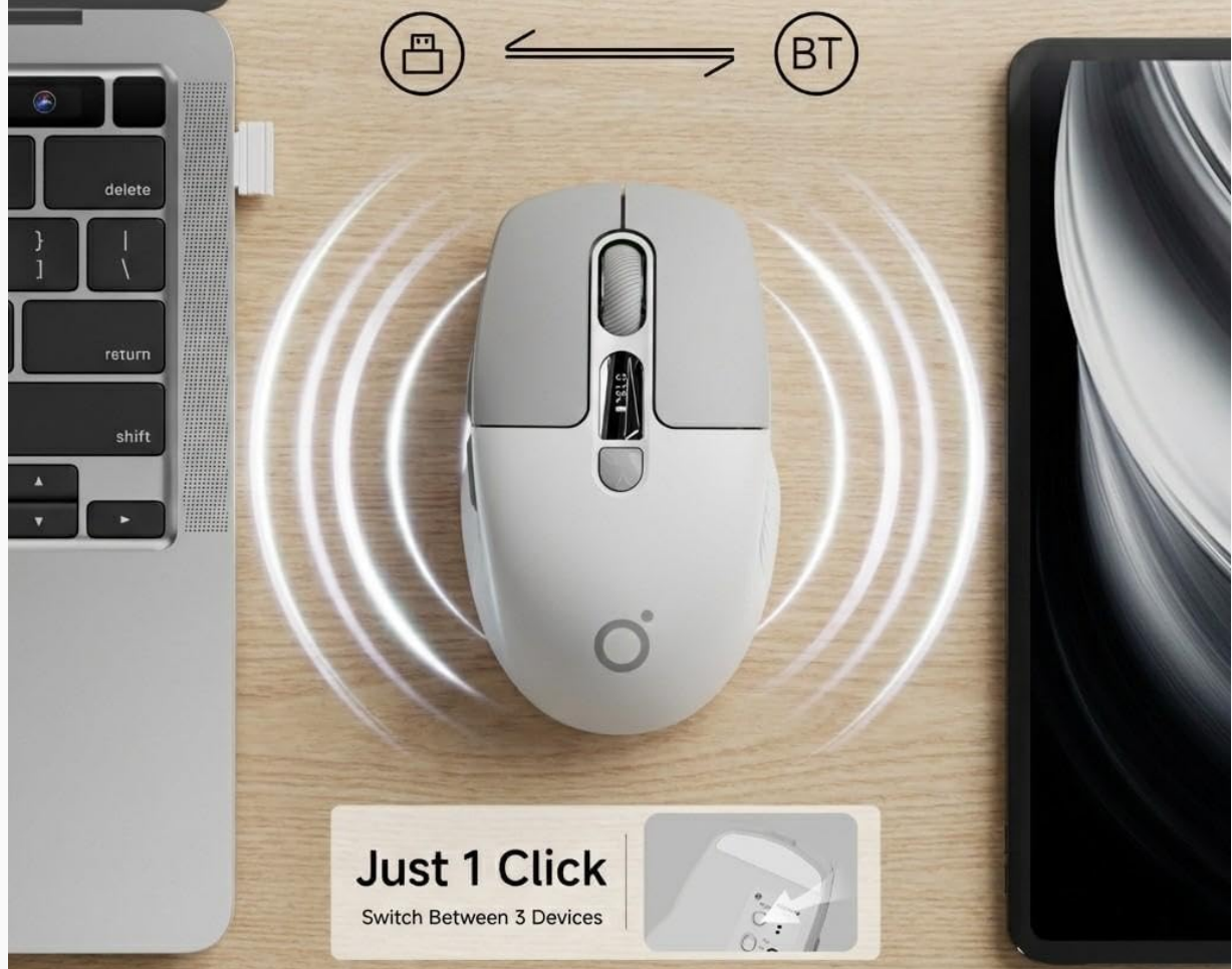
Image: The SEUNKWANG Q1 mouse positioned between a laptop and a tablet, illustrating its dual 2.4G and Bluetooth connectivity for seamless switching between up to three devices with a single click.

Seamlessly Transition between Three Devices