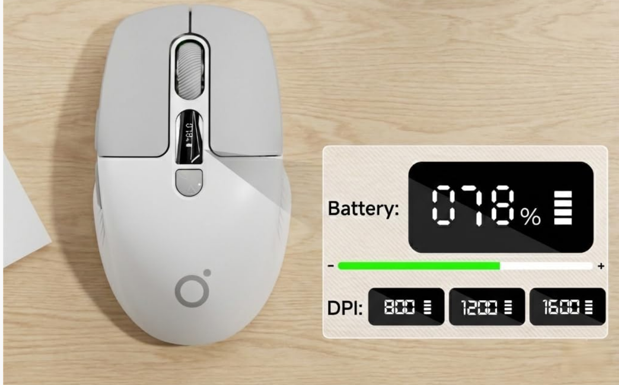
Image: The SEUNKWANG Q1 wireless mouse featuring an LED screen display that shows the accurate battery percentage (78%) and selectable DPI levels (800, 1200, 1600).