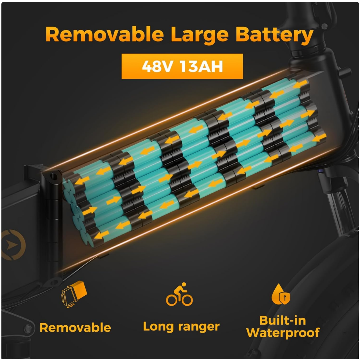
Image 5.1: Illustration of the removable 48V 13Ah battery integrated into the frame of the Jasion X-Hunter.