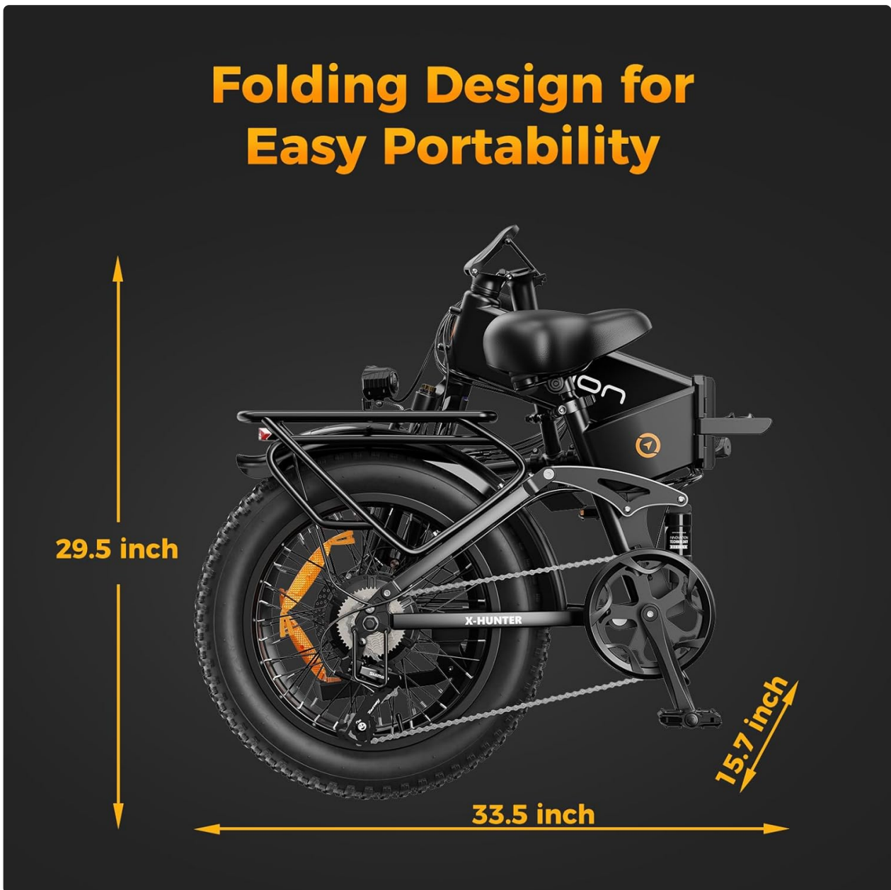
Image 4.2: The Jasion X-Hunter in its folded configuration, highlighting its compact dimensions for easy portability.

The foldable design allows for convenient storage and transport.