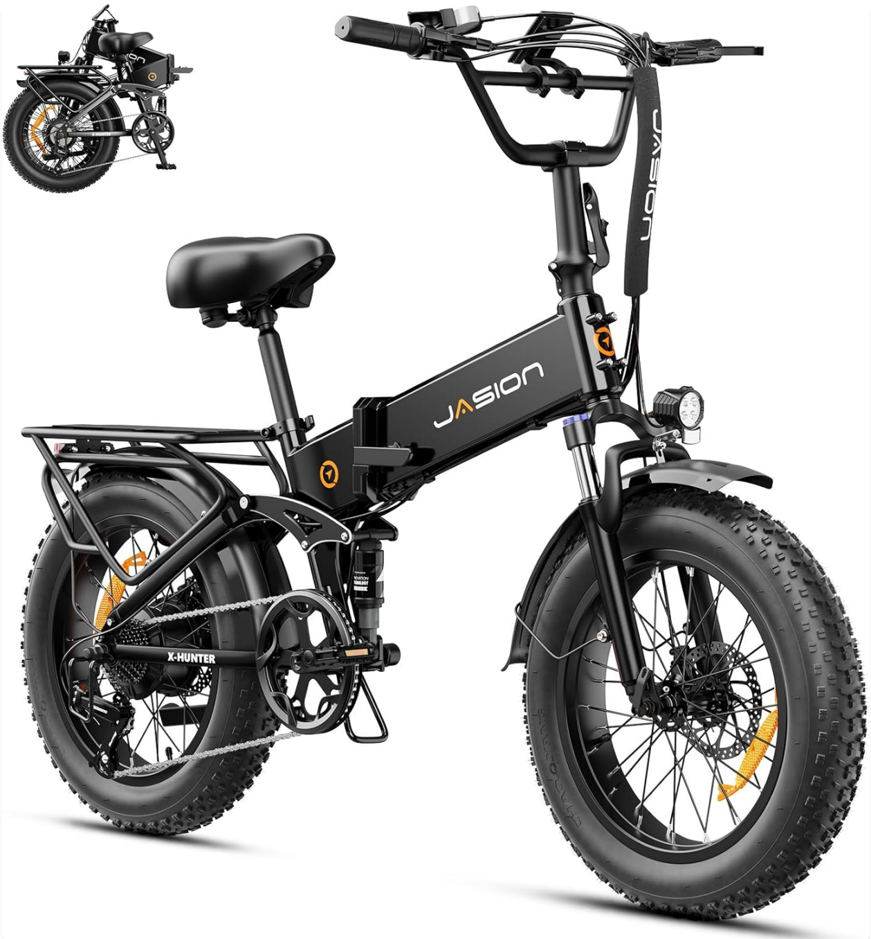
Image 1.1: The Jasion X-Hunter Electric Bike, a foldable fat-tire e-bike designed for various terrains.