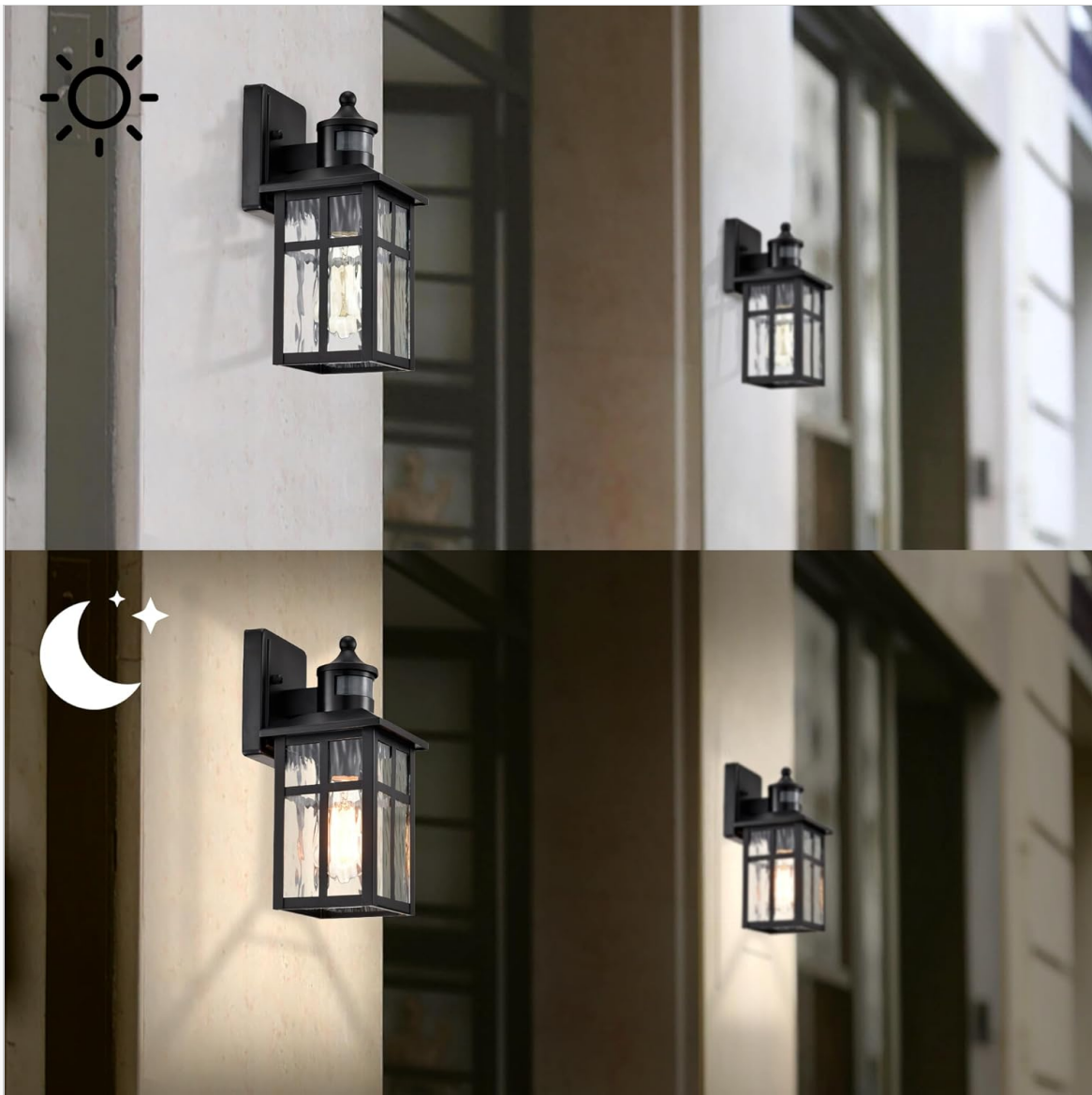
Image 6.1: Visual representation of the light fixture operating during day and night.