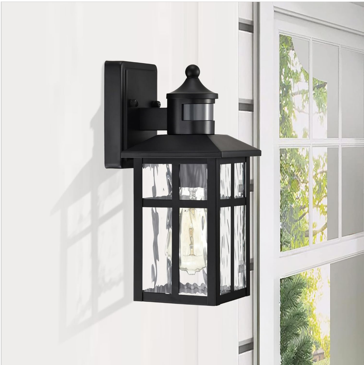
Image 1.1: Edvivi Motion Sensor Outdoor Wall Sconce, showcasing its design and placement.