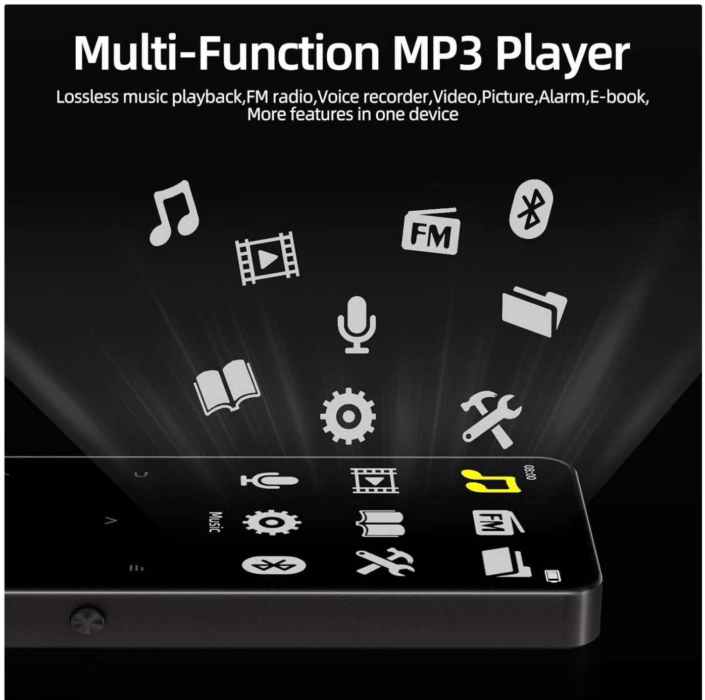
Image: The main menu of the MP3 player, displaying icons for Music, FM Radio, Video, E-Book, Voice Recorder, Settings, and Bluetooth.

Radio, Video, E-Book, Voice Recorder, Settings, Bluetooth, File Browser). Press the Confirm/Play/Pause key to enter the selected module.