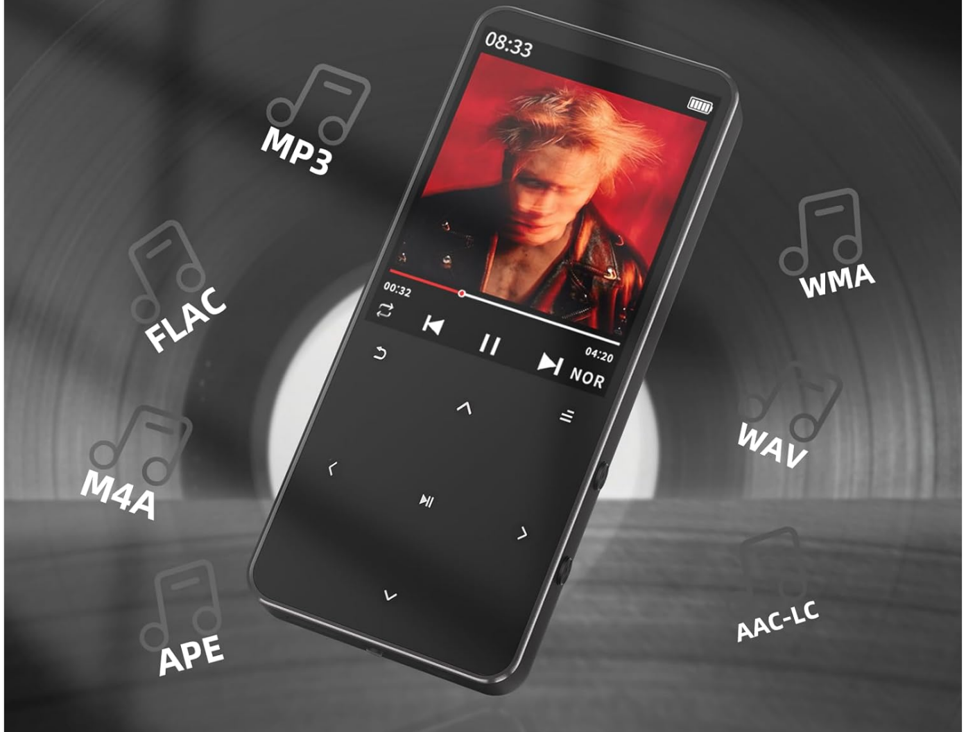
Image: The MP3 music player interface, highlighting supported formats like MP3, FLAC, WMA, WAV, APE, and AAC-LC.

Hi-Fi sound, built-in speaker, 7 high-sensitivity touch keys, 2 independent volume buttons, lyrics display, resume playback.