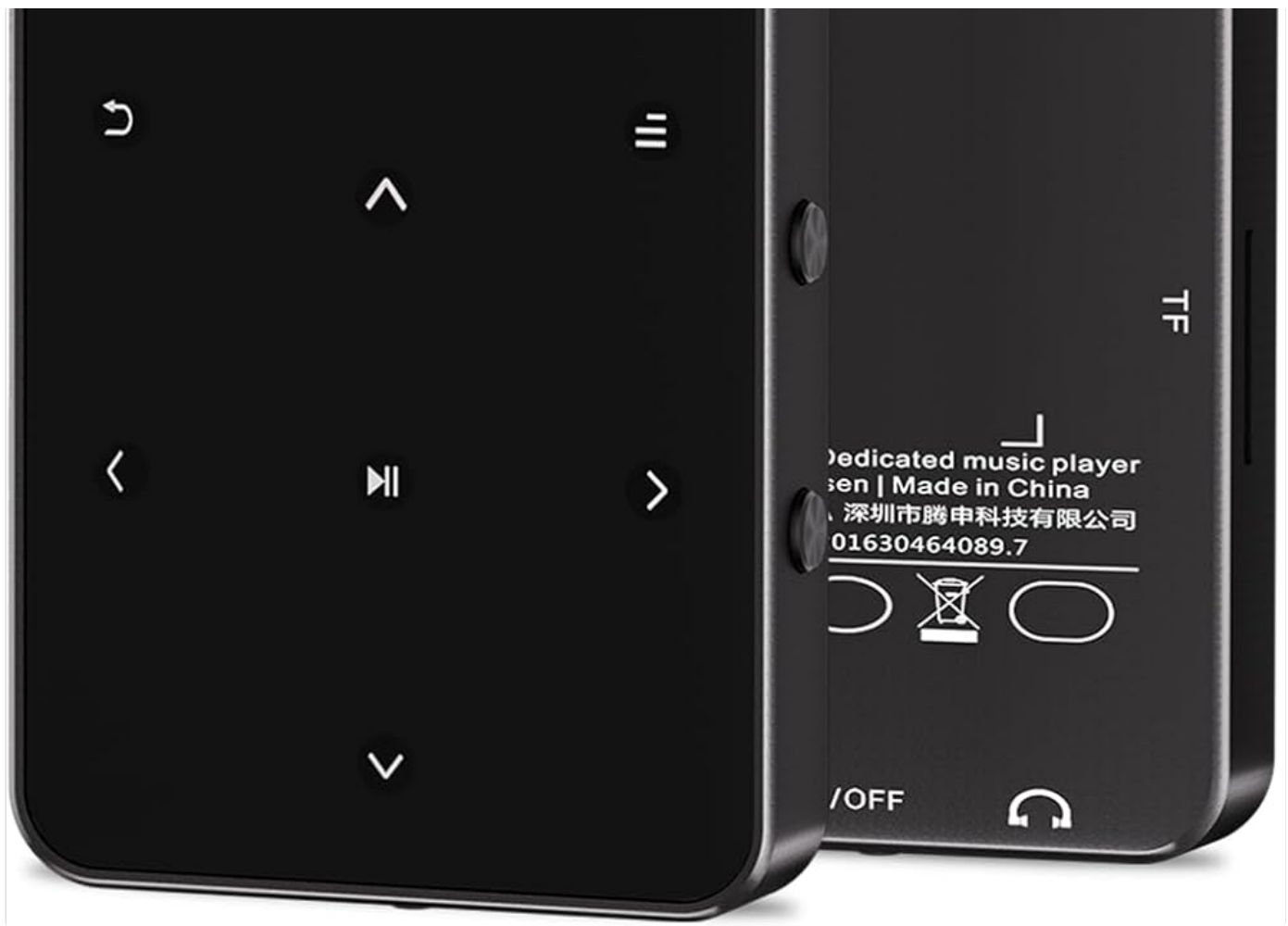
Image: Front and back view of the Tengsen X1 MP3 Player, showcasing its compact design and sleek black finish.