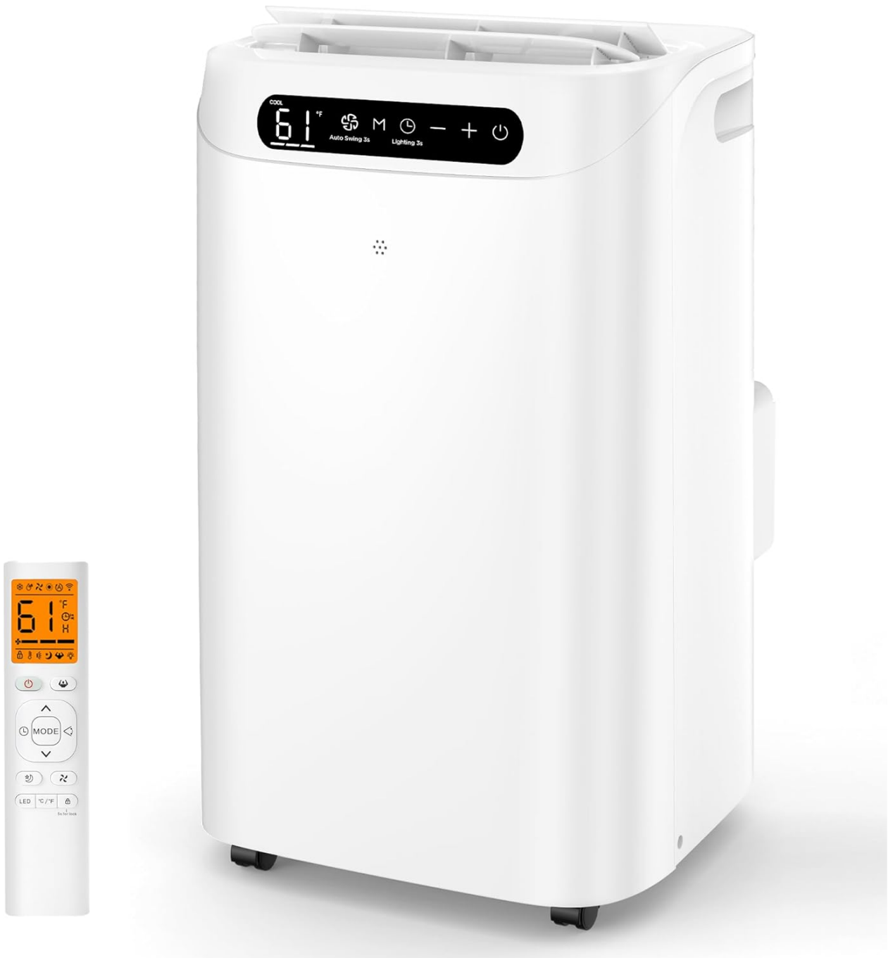
Image: Front view of the HUMHOLD Portable Air Conditioner.