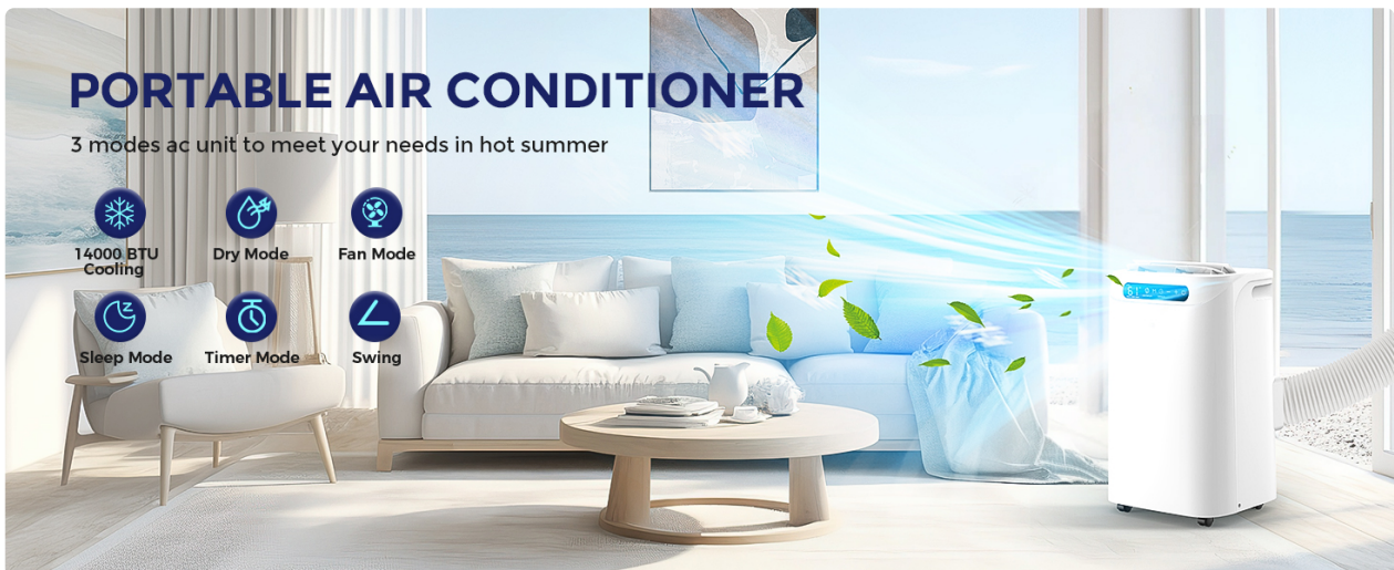
Image: The HUMHOLD 14000 BTU Portable Air Conditioner in a living room, illustrating its cooling capabilities for a large area.

Thank you for choosing the HUMHOLD 14000 BTU Portable Air Conditioner. This versatile 3-in-1 unit is designed to provide efficient cooling, dehumidification, and fan functions for spaces up to 700 sq.ft. With its advanced features and user-friendly design, you can enjoy a comfortable indoor environment all year round. Please read this manual thoroughly before operation to ensure proper use and maintenance.