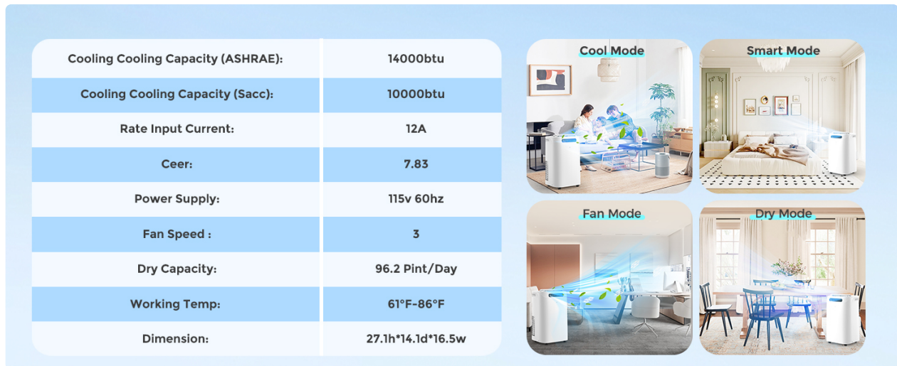
Image: Various operating modes of the portable air conditioner.