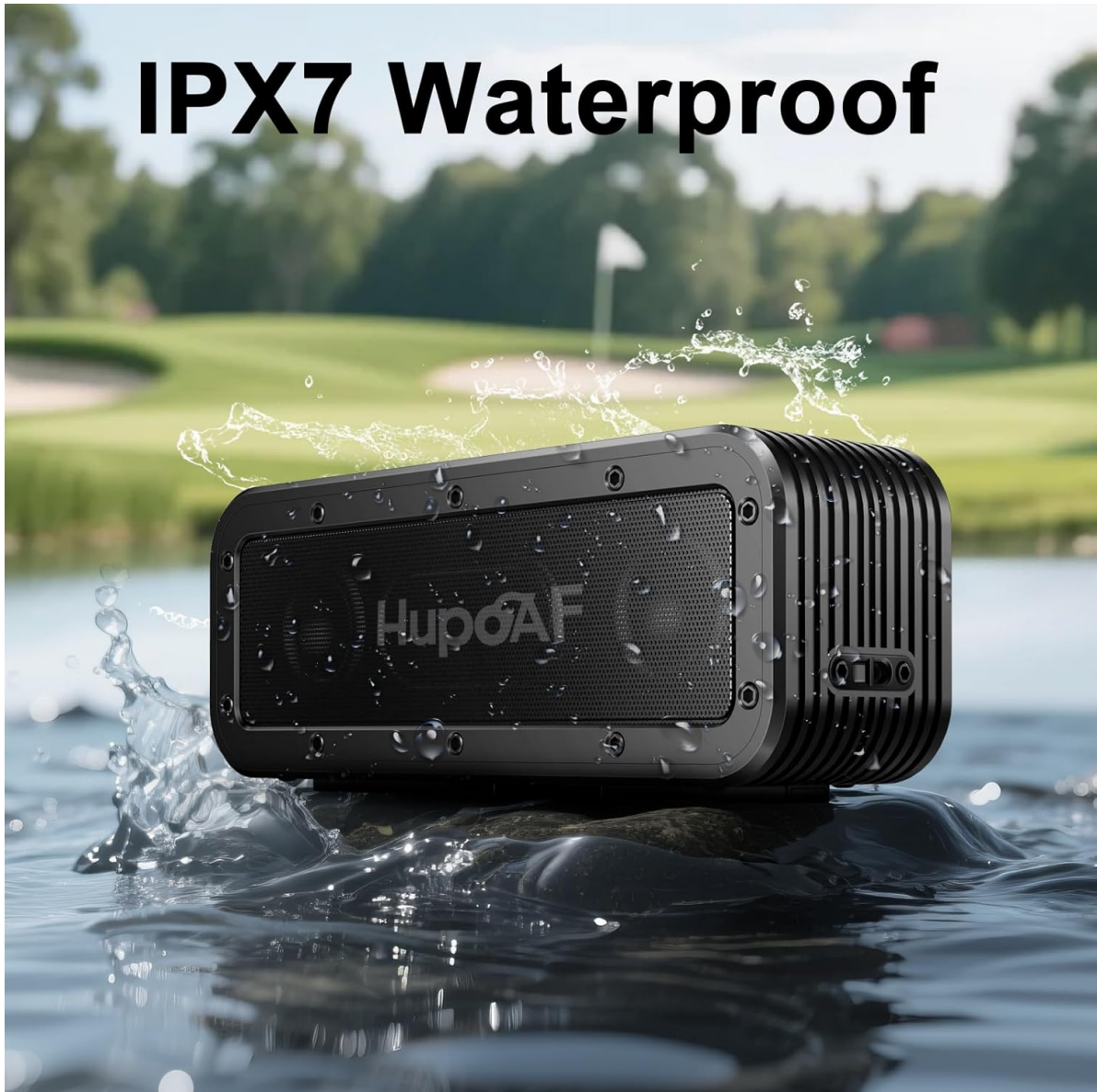
Image: The Hupoaf V8 speaker is shown partially submerged in water with splashes, illustrating its IPX7 waterproof capability, making it suitable for use near water.