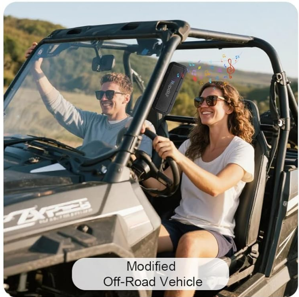
Modified Off-Road Vehicle

Image: Top view of the Hupoaf V8 speaker showing its control buttons. From left to right, these include On/Off, Mode switch, Sound effect switching, Volume down/Previous track, Play/Pause/Answer/Hang up, Volume up/Next track, and Phone voice (microphone).