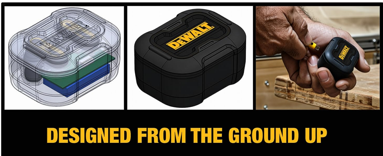
Image 7.1: Exploded view illustrating the internal components of a DEWALT earbud.