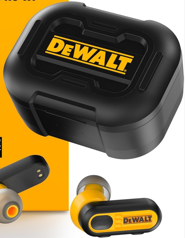
Image 1.1: DEWALT Heavy Duty True Wireless Earbuds and Charging Case.