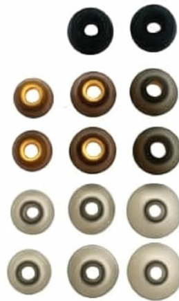
Extra Sets of Ear Cushions