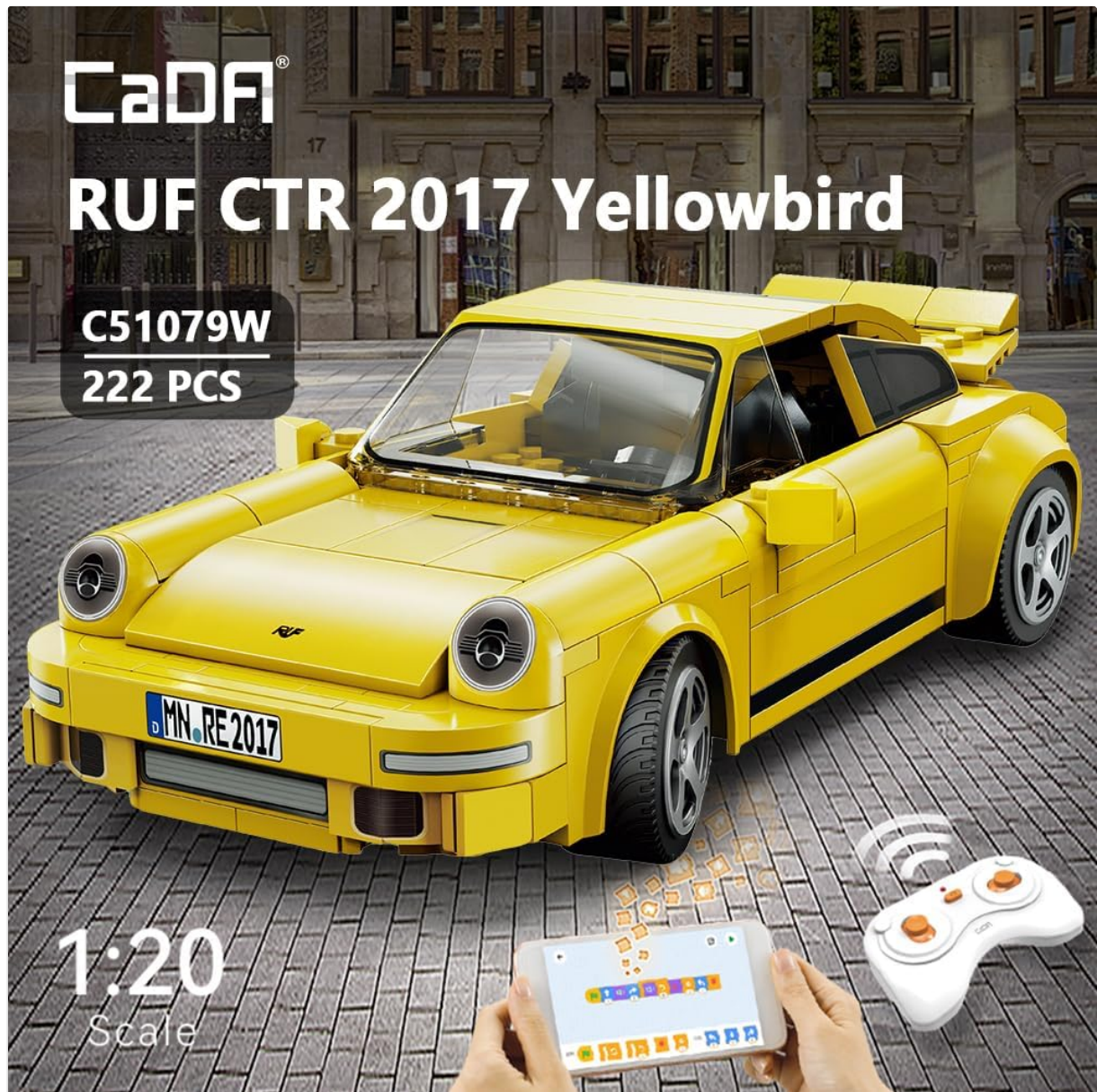
Image: The CaDA C51079w kit, showing the RUF CTR 2017 Yellowbird model, piece count, and scale.