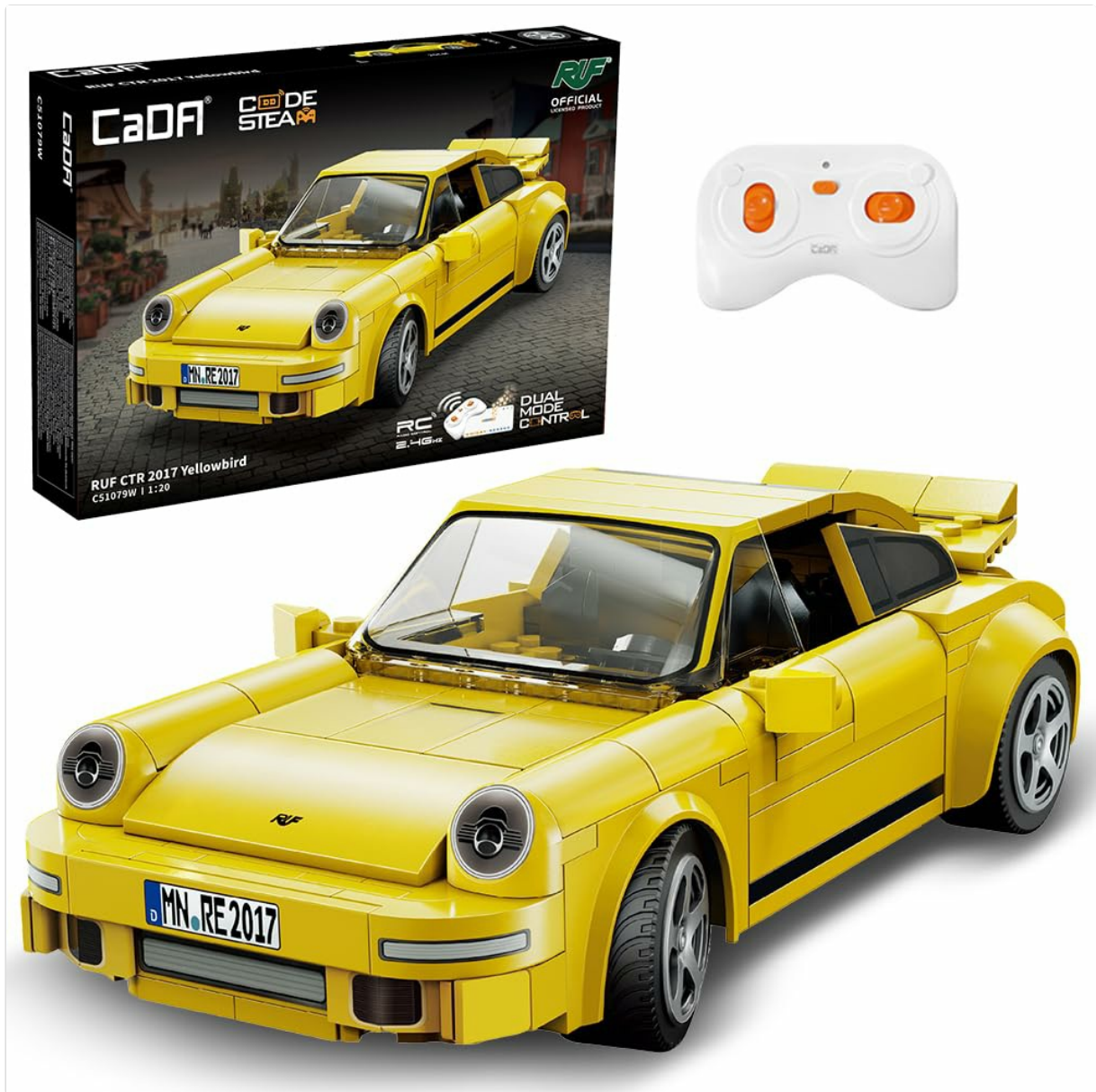
Image: The fully assembled CaDA C51079w model, showcasing its detailed design.