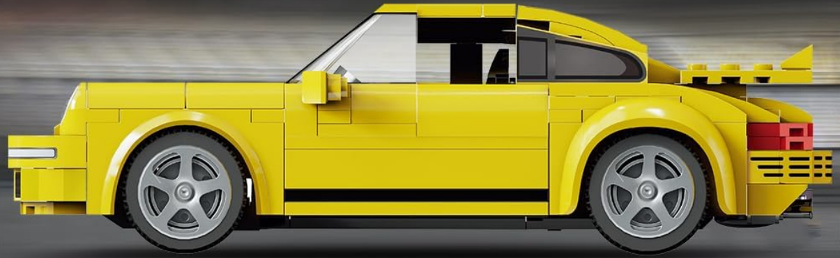
Image: Visual representation of the model's dimensions.