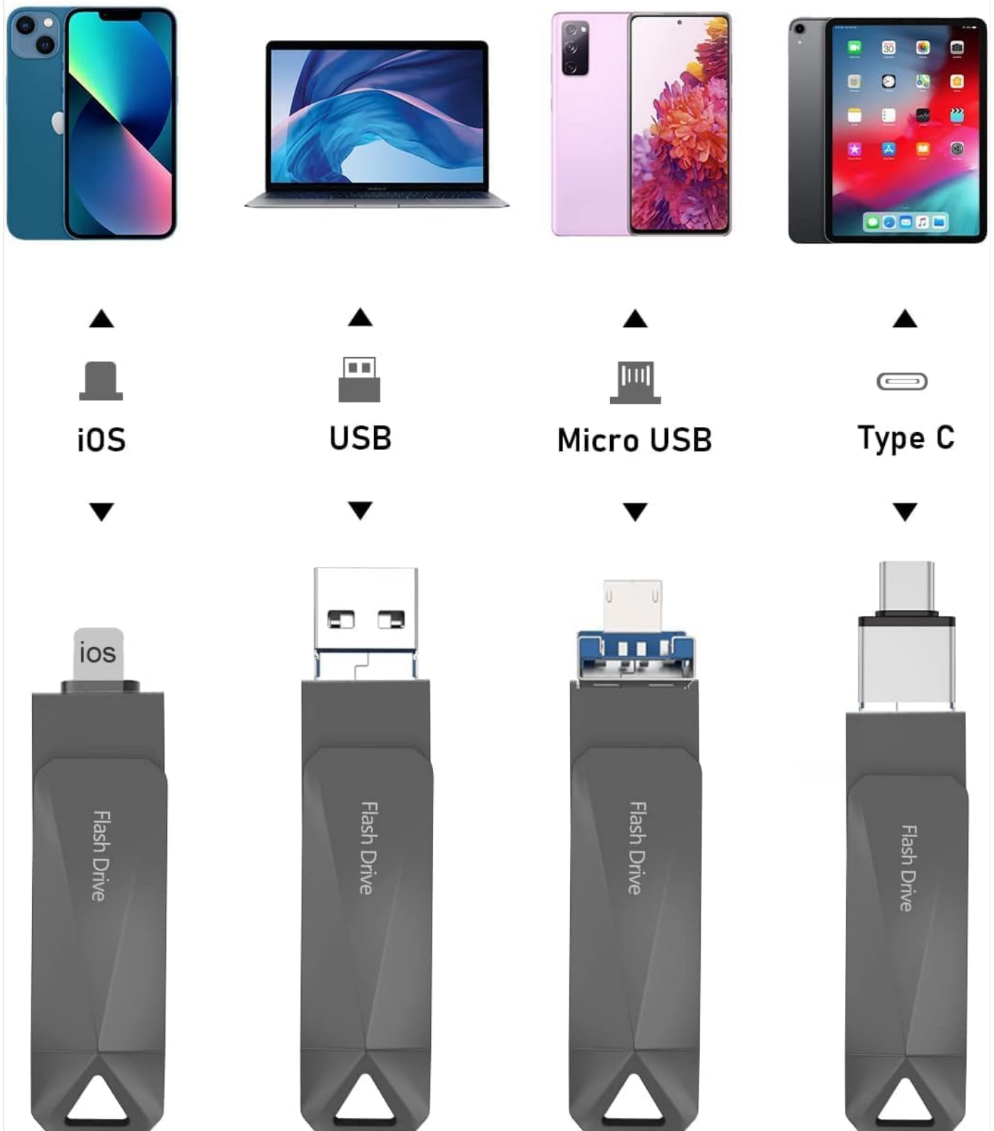
Image: A diagram illustrating the 4-in-1 wide compatibility of the flash drive, showing its different connectors (iOS, USB, Micro USB, Type C) and the types of devices they connect to, including iPhones, MacBooks, Samsung phones, and iPads.