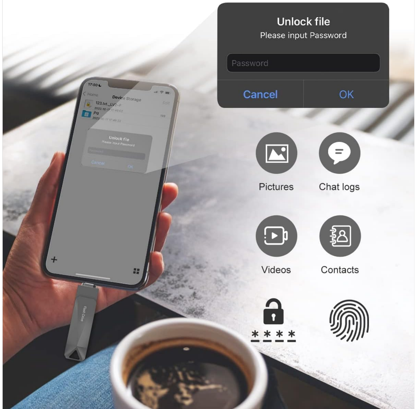
Image: A smartphone screen displaying the "Unlock file" prompt with a password input field, illustrating the secure encrypted backup feature. Icons for pictures, chat logs, videos, and contacts are shown, along with symbols for password and fingerprint security.

NOTE: Only iOS devices support encryption (because iOS devices require an app to be installed)