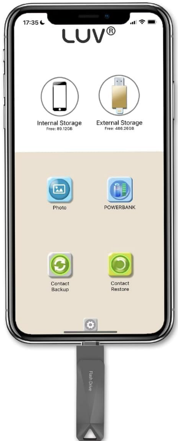
Image: A visual guide demonstrating the two steps for iOS device setup: downloading the "LUV-Share" app from the App Store and accepting the communication permission prompt when connecting the flash drive.