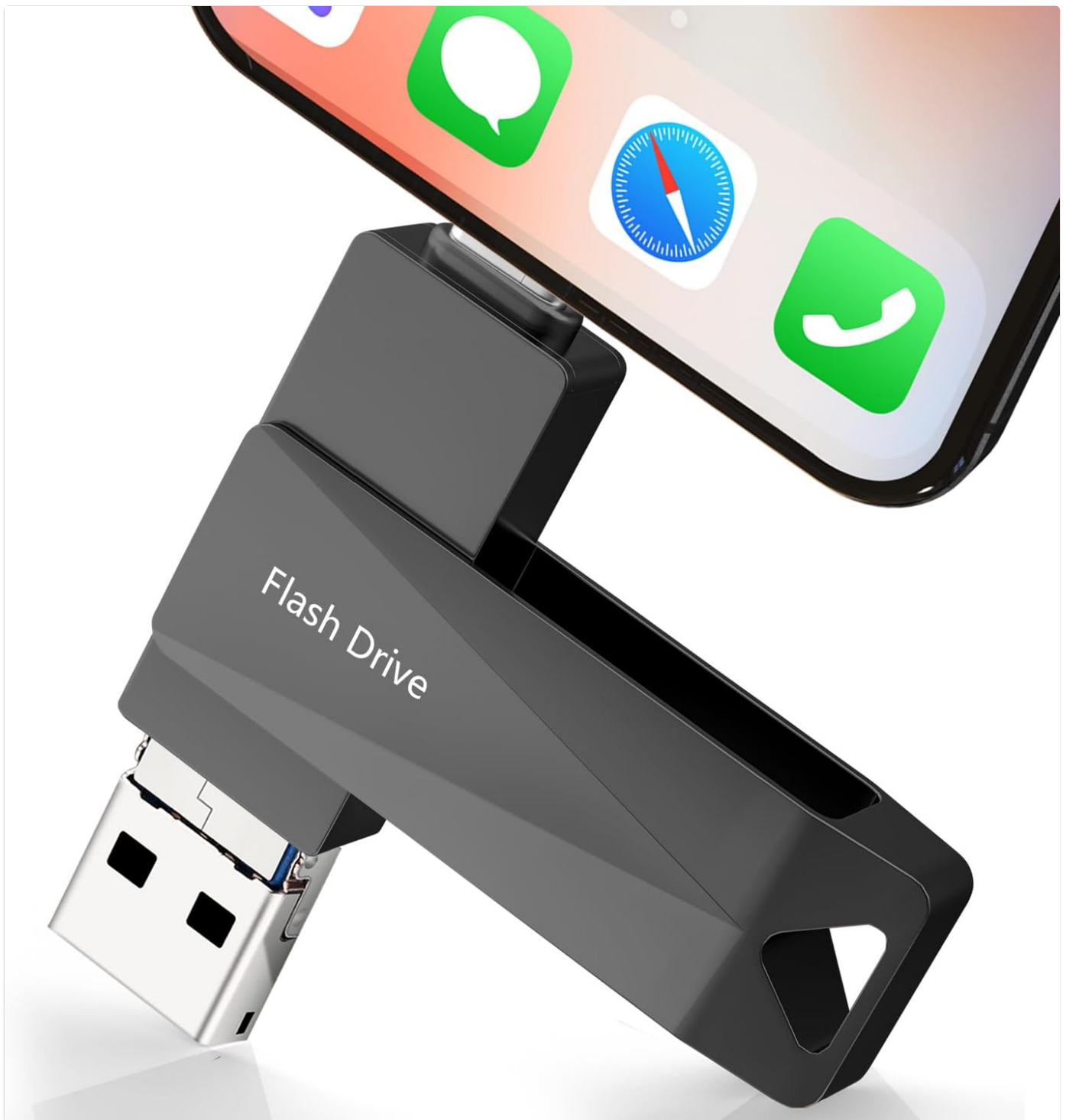
Image: The Gainerly 512GB Photo Stick, a compact grey flash drive, is shown connected to the bottom port of a smartphone, illustrating its direct connectivity for data transfer.