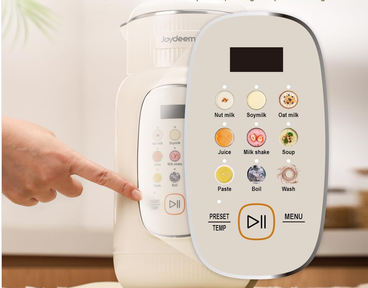
Image illustrating the 7 adjustable temperature settings available in Nut Milk mode on the Joydeem machine's control panel.

After use, press the “Wash” button for automatic self-cleaning to minimize cleanup time. For best results, add water immediately after pouring out your beverage