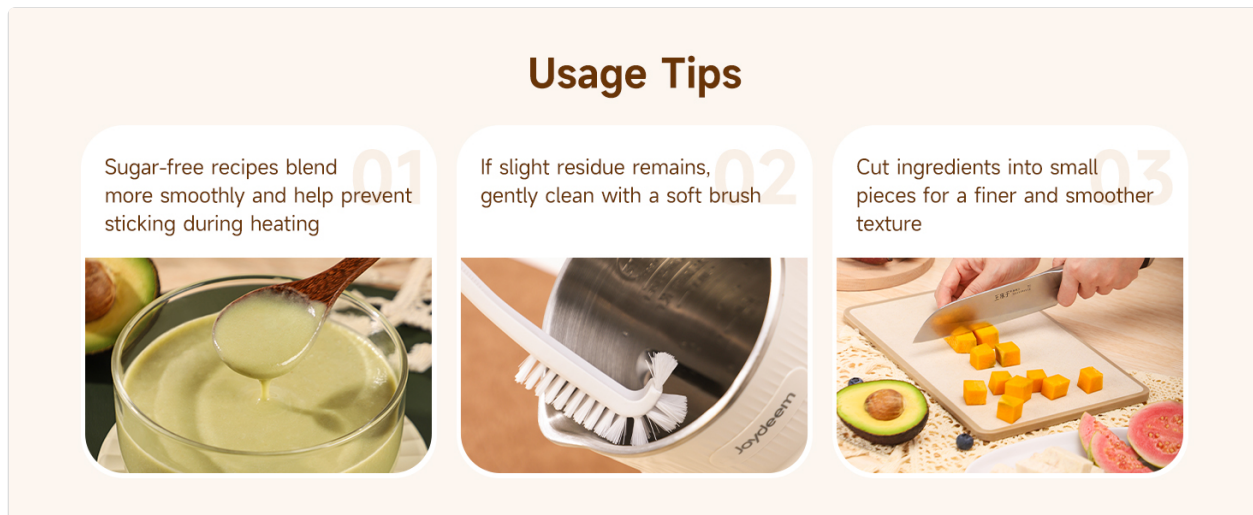
Image showing usage tips, including cleaning with a soft brush if slight residue remains, and cutting ingredients into small pieces.