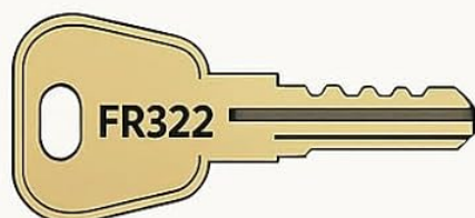
On the Key