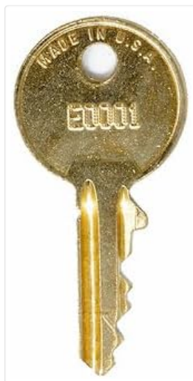
Figure 1: Typical appearance of an EasyKeys replacement key. This image displays the typical appearance of an EasyKeys replacement key, made of brass, with a code stamped on the head.

The EasyKeys Replacement Key is a precision-cut brass key intended to replace lost or damaged keys for compatible Yale Lock systems. It features a durable brass construction and is specifically cut to the E0162 code.