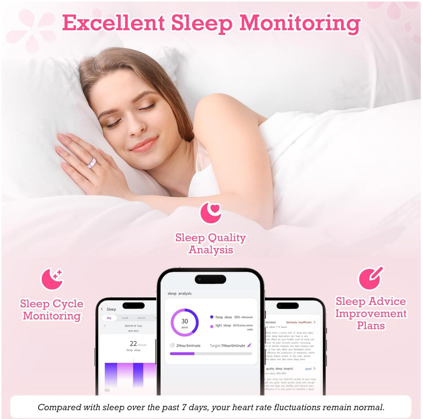
Image: A woman sleeping while wearing the Smart Ring, with an overlay showing the sleep analysis interface on a smartphone. This highlights the ring's sleep monitoring capabilities and the app's detailed reporting.