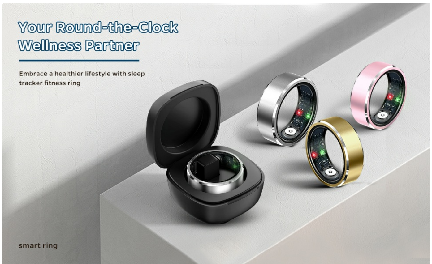
Image: The Zyee Syee Smart Ring R5, available in multiple colors, shown with its charging case. This image illustrates the product's design and charging accessory.

This manual provides detailed instructions for the setup, operation, and maintenance of your Zyee Syee Smart Ring R5. Please read this manual thoroughly to ensure proper use and to maximize the benefits of your device.