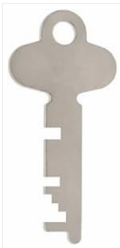
Figure 1: EasyKeys Replacement Key ZA2299. This image displays the physical appearance of the replacement key.