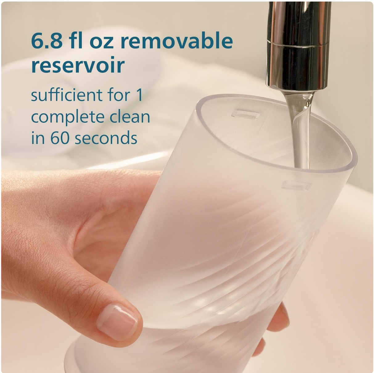
Image: Demonstrating how to fill the removable water reservoir.

sufficient for 1 complete clean in 60 seconds