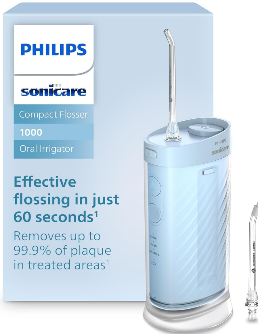
Image: The Philips Sonicare Compact Flosser 1000, a portable water flosser in blue.