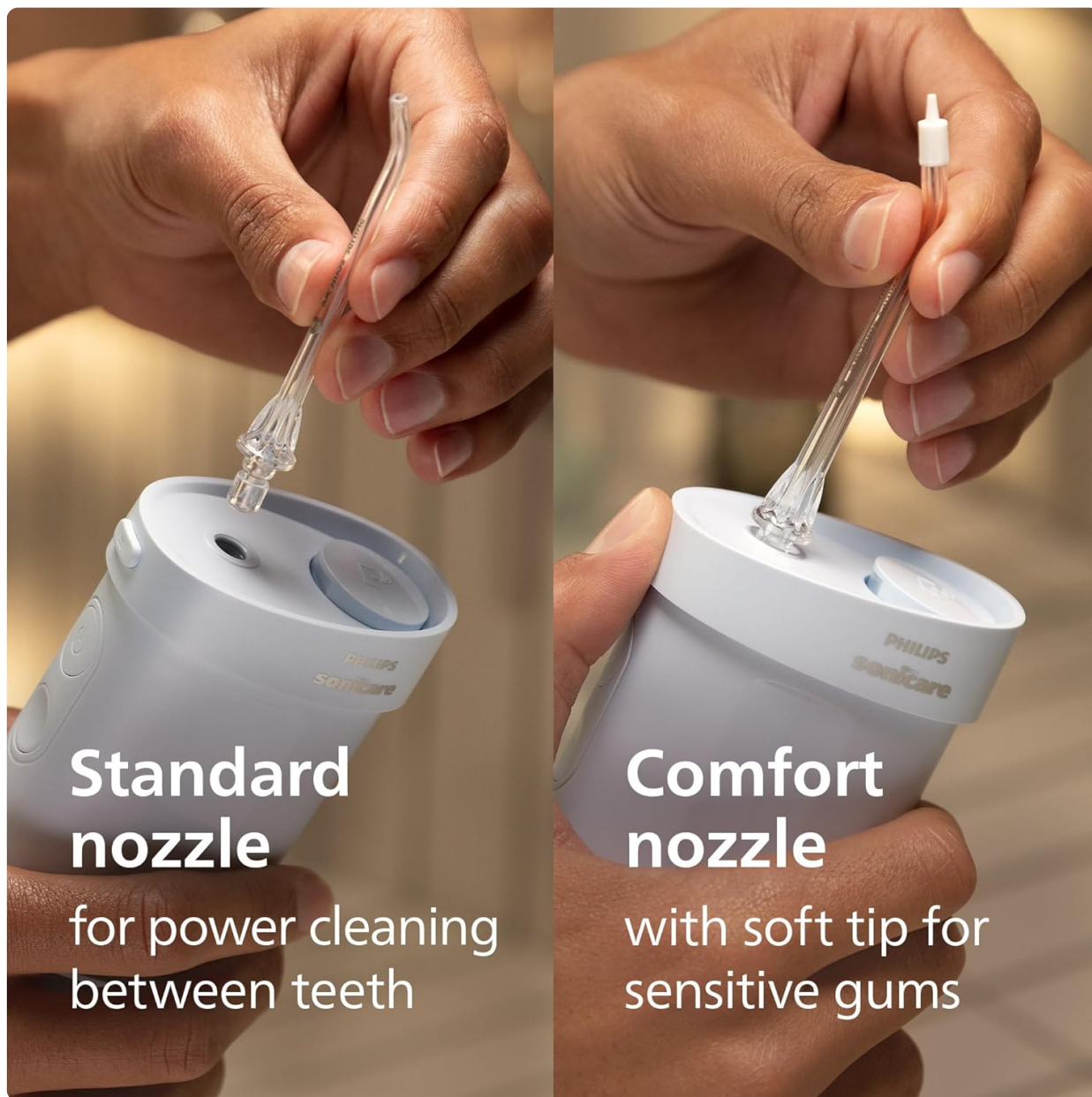
Image: The N1 Standard nozzle and N2 Comfort nozzle, designed for different cleaning needs.