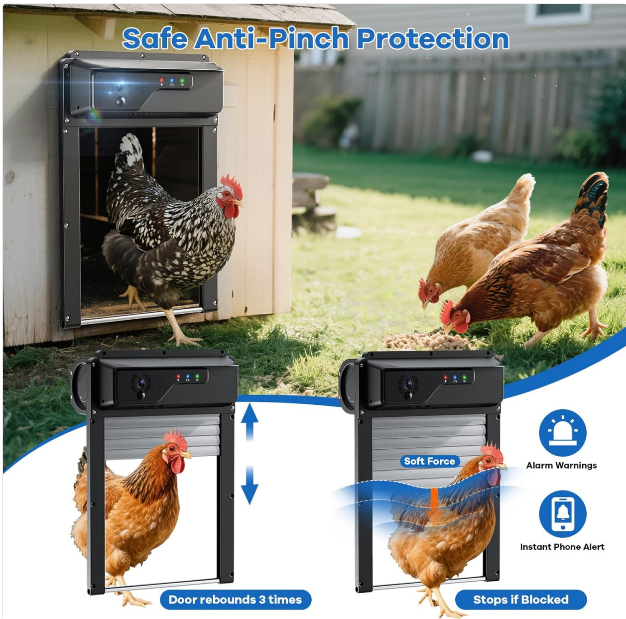
Figure 8: Anti-pinch safety mechanism.