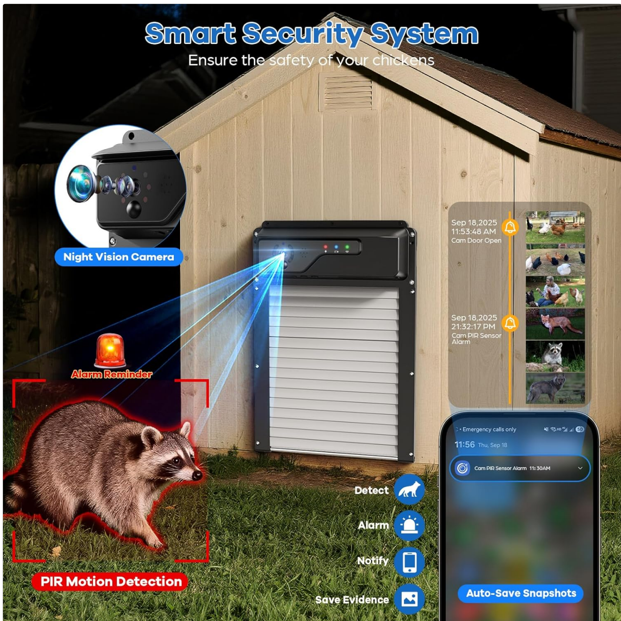
Figure 9: Smart security system with motion detection and alerts.