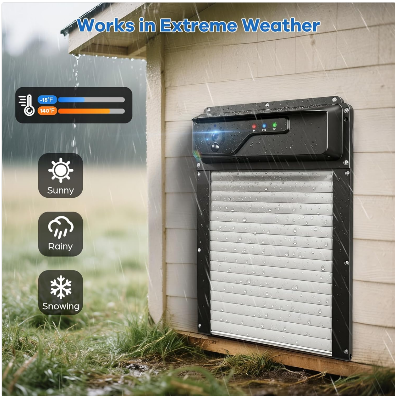
Figure 10: The door is built for reliable performance in diverse weather.