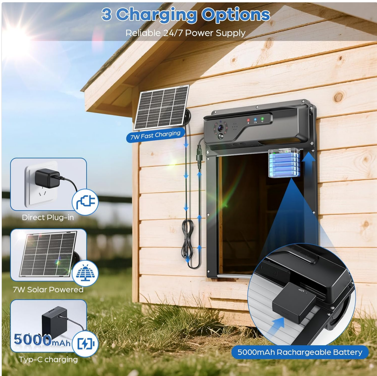
Figure 5: Multiple power options ensure reliable operation.