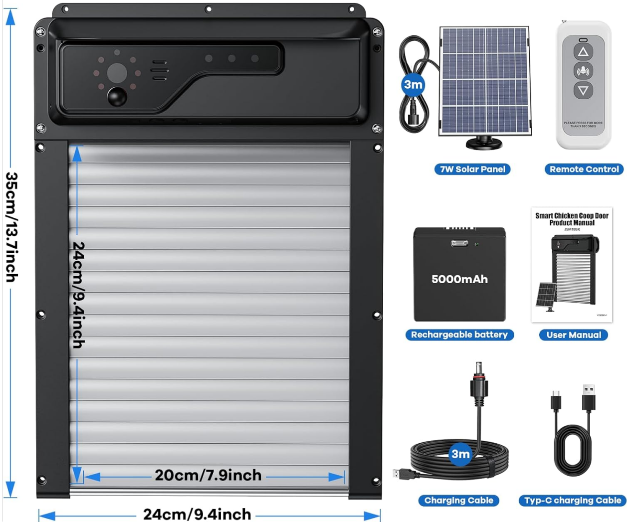
Figure 2: All components included in the product package.