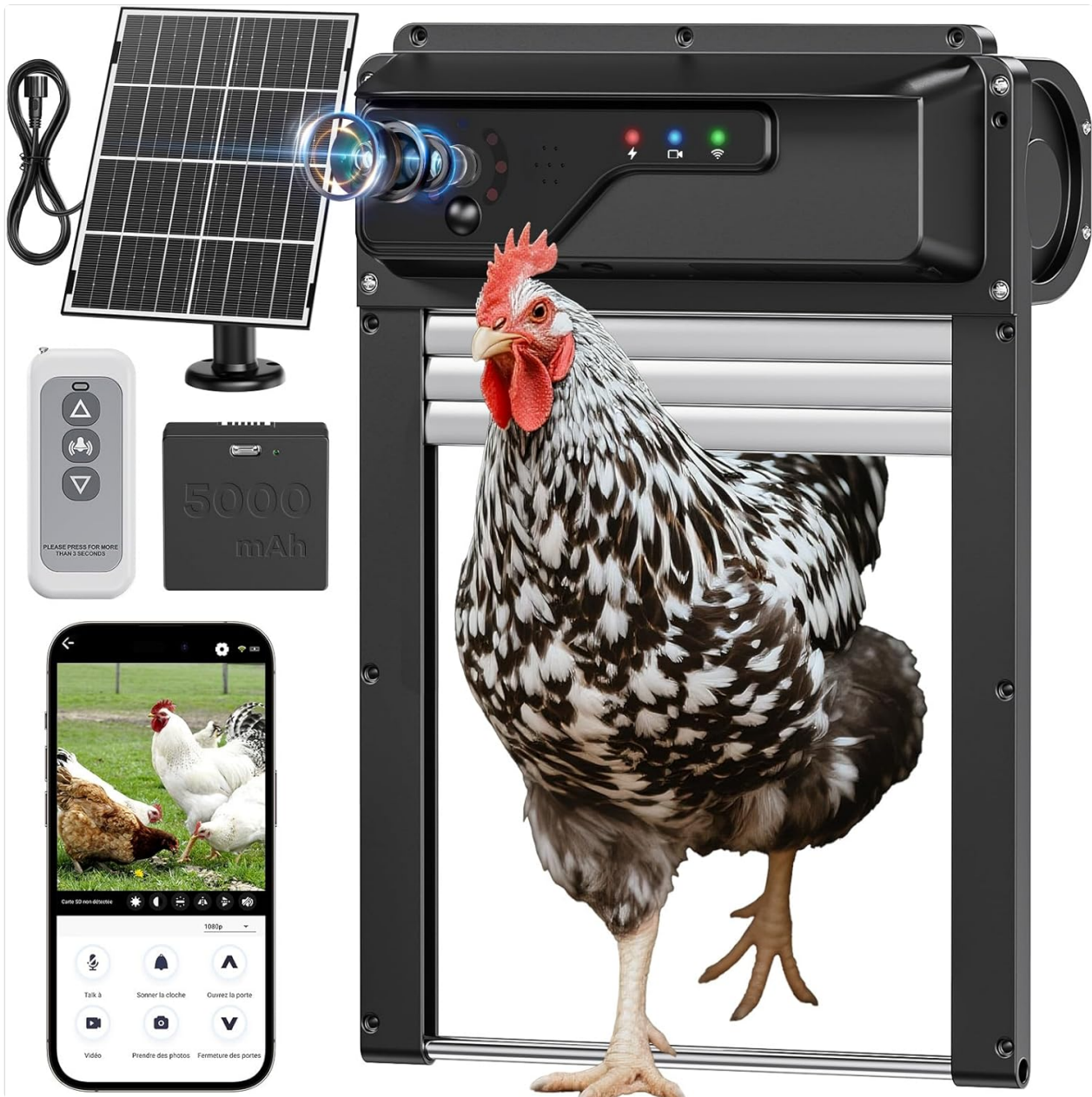
Figure 1: Overview of the MASTERFUN Automatic Chicken Coop Door with included accessories.