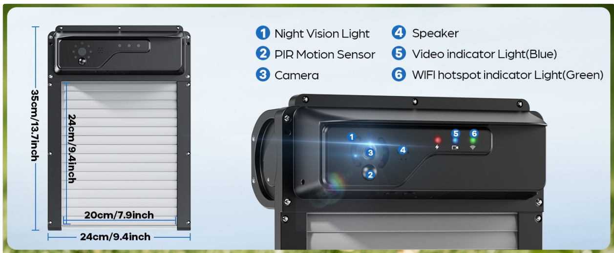
Figure 3: Key features and indicators of the chicken coop door.