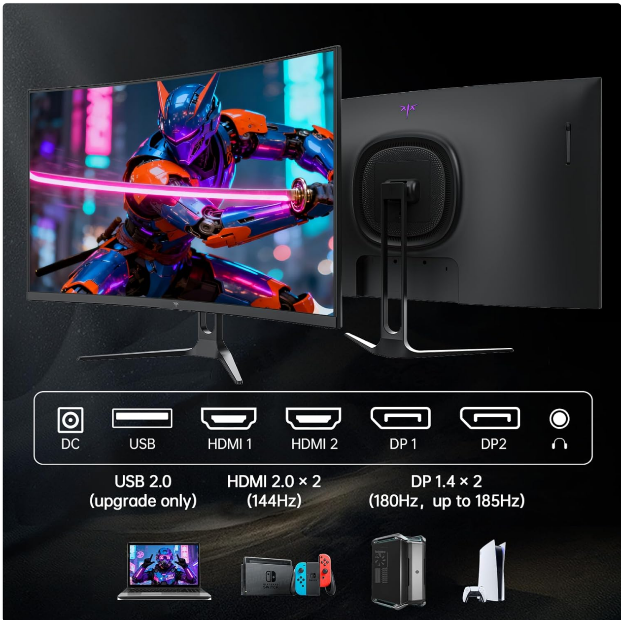
Image 2: Rear view of the monitor showing connectivity ports and VESA mount area.

The monitor supports VESA 100mm x 100mm mounting. If you prefer to wall-mount the monitor, remove the stand and attach a compatible VESA mount (not included) to the designated holes on the back of the monitor. Ensure the wall mount can support the monitor's weight (approximately 16.87 pounds).