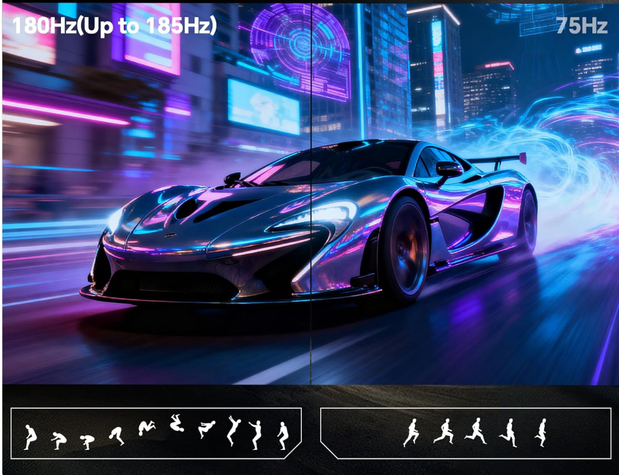
Image 3: Visual representation of the monitor's high refresh rate for smoother gaming.

Enjoy a faster and smoother gaming experience