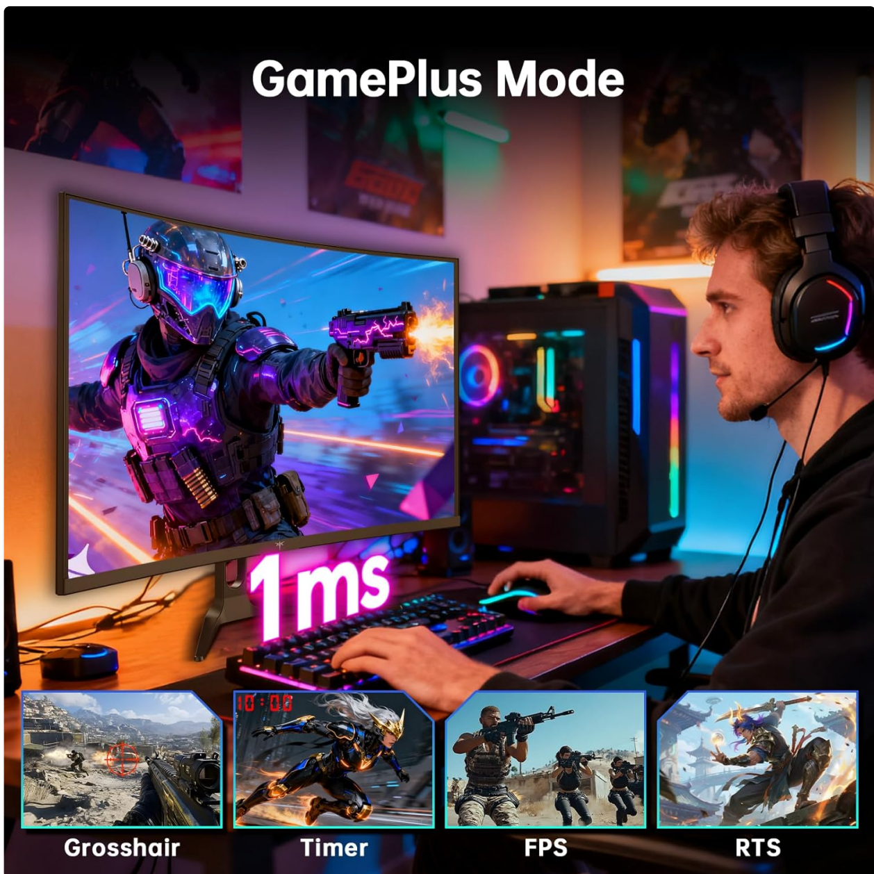
Image 6: Overview of GamePlus features including Crosshair, Timer, FPS, and RTS modes.