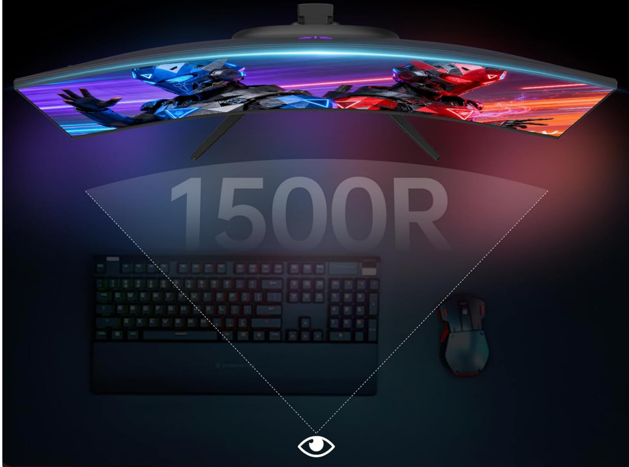
Image 5: Illustration of the 1500R curved display for an immersive viewing experience.

1500R curvature delivers a more cinematic and immersive gaming experience.