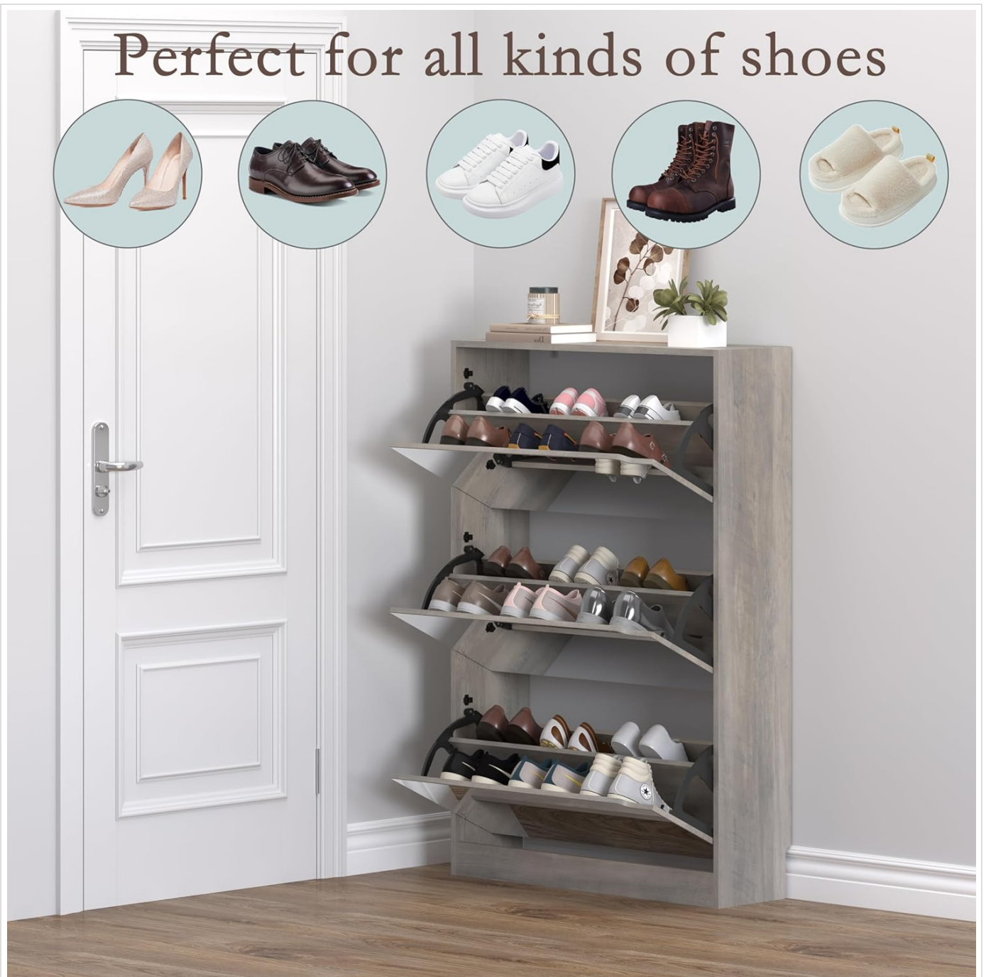
Image: Open Drawers with Shoes. This image shows the shoe cabinet with all three flip-down drawers open, displaying multiple pairs of shoes neatly organized on the internal shelves.