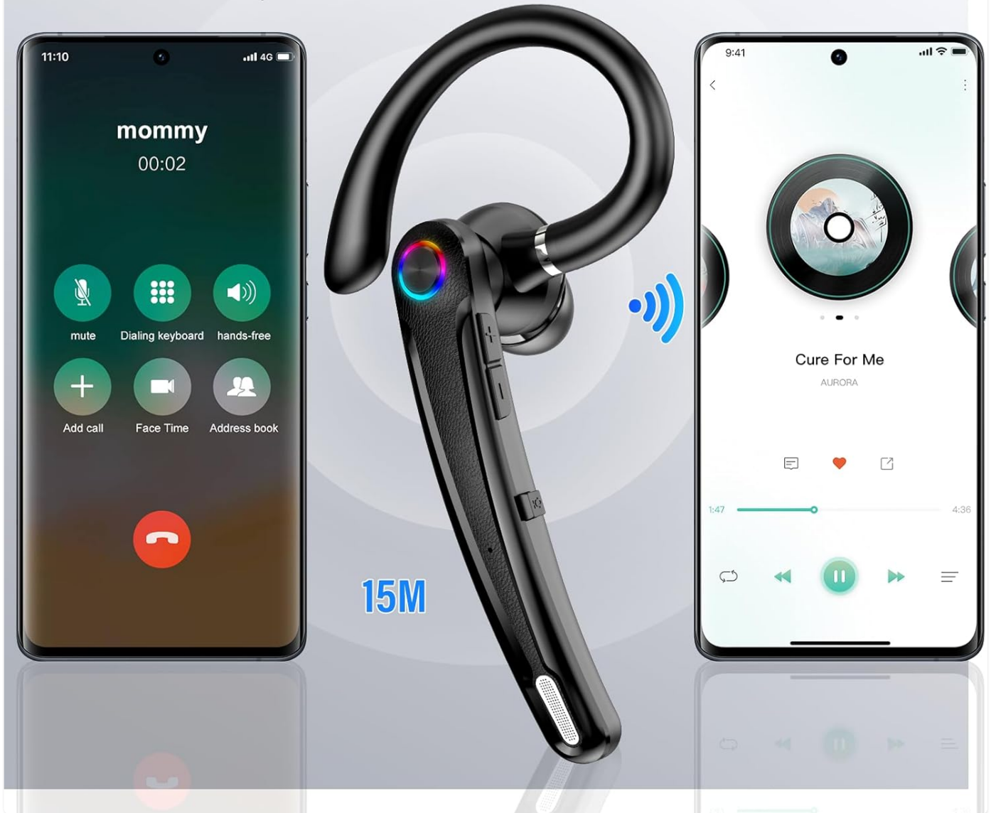
Image: The headset shown connected to both a smartphone (for calls) and another smartphone (for music), demonstrating dual device connectivity.

Compatible with iOS /Android Windows etc.