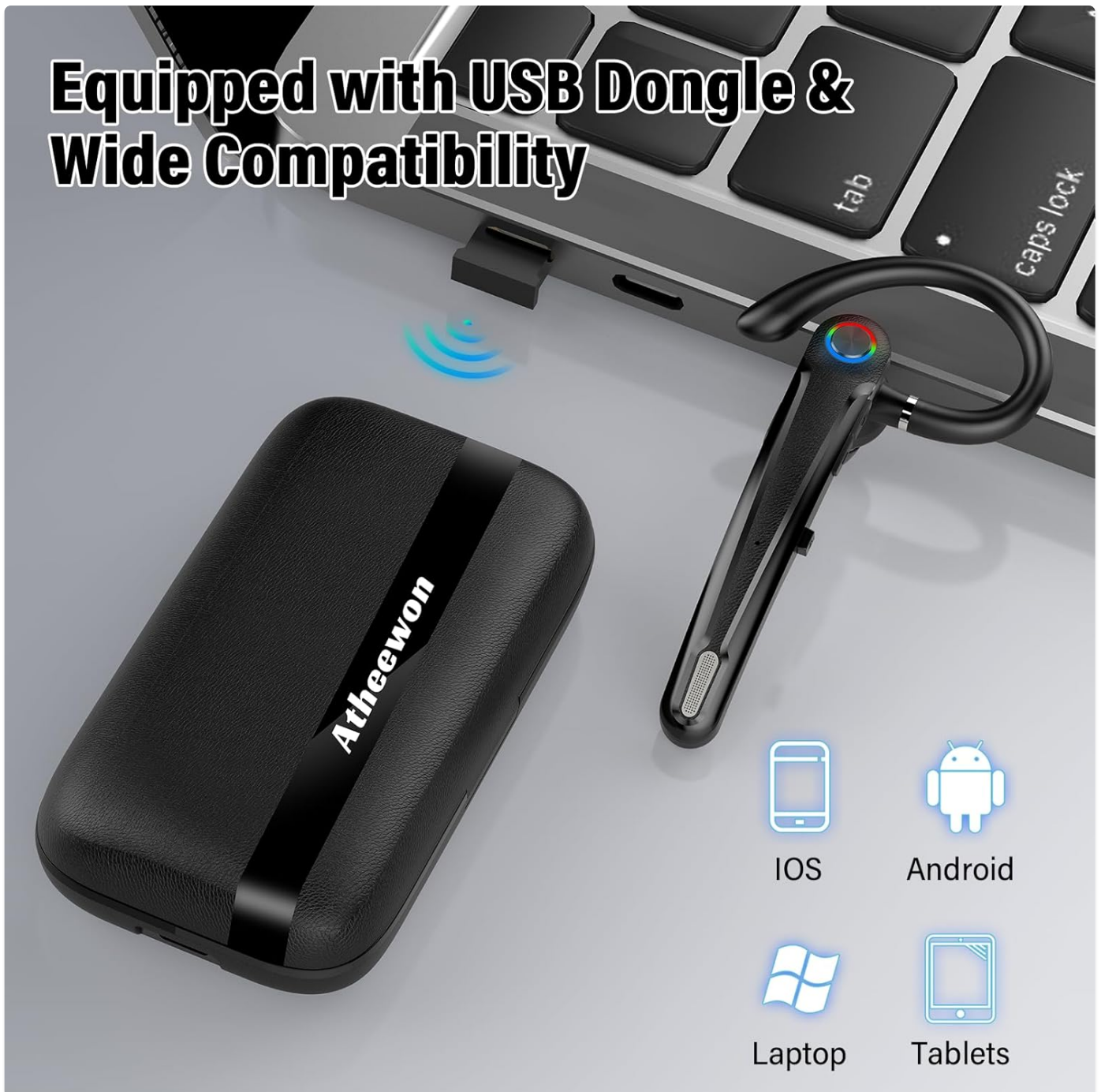
Image: The headset, charging case, and USB dongle, with icons indicating compatibility with iOS, Android, Laptops, and Tablets.