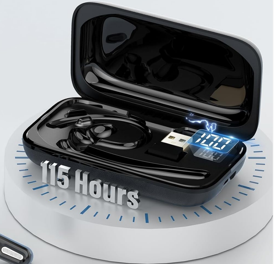
Image: The headset inside its charging case, highlighting the LED battery display and total playtime.