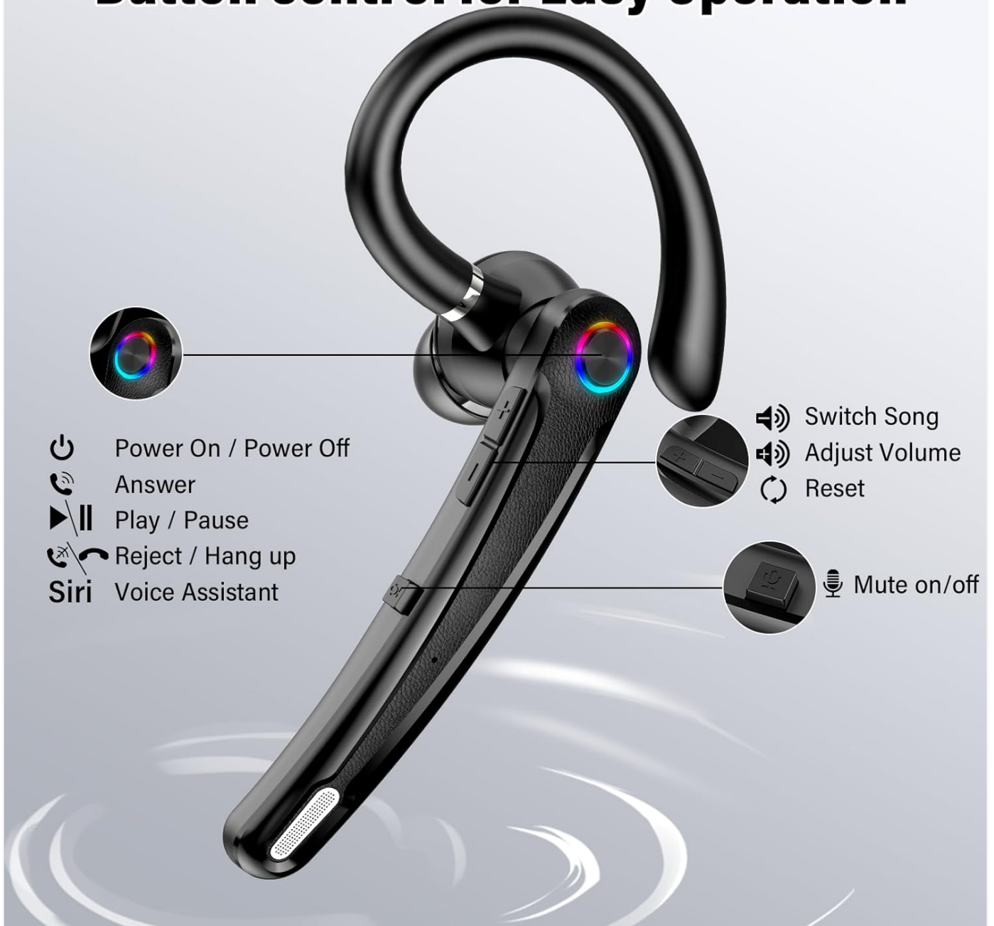
Image: Detailed diagram illustrating the various buttons and their functions on the headset.