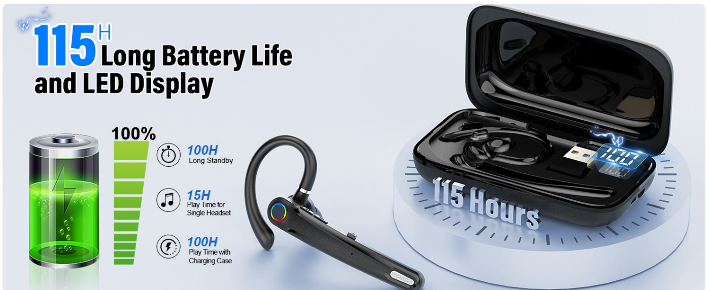
Image: Highlights the 115-hour total battery life with the charging case and the digital LED display.