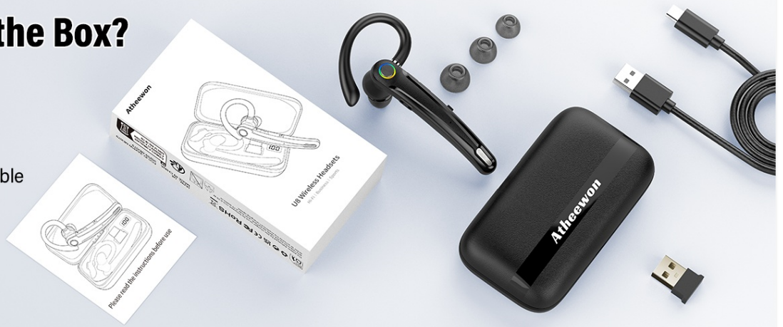
Image: A visual representation of all items included in the product packaging.