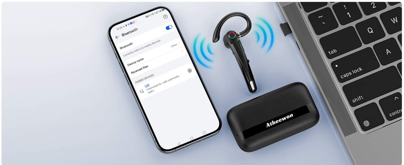
Image: Illustrates the headset pairing with a smartphone and a laptop via Bluetooth.