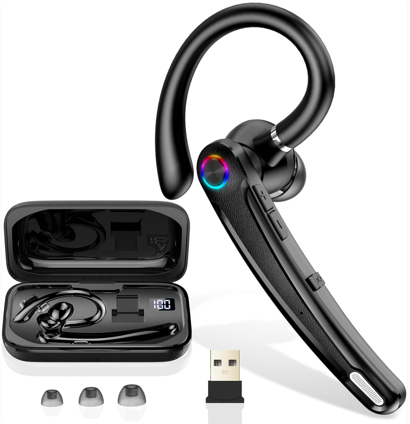
Image: Atheewon Bluetooth Headset V5.4, showing the headset, charging case, USB dongle, and ear tips.