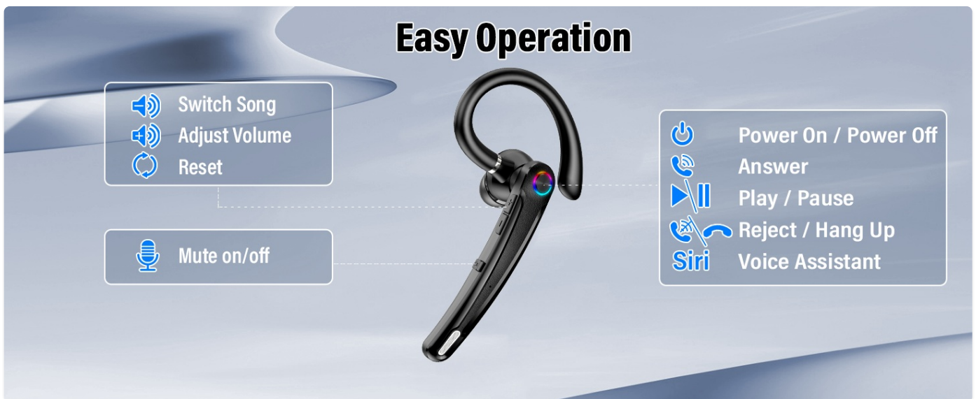
Image: A visual guide to the headset's button controls for various functions like power, calls, music, and voice assistant.