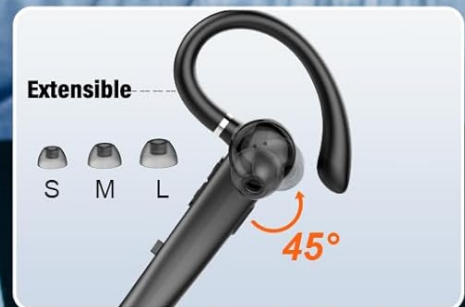
Image: Visual guide demonstrating the 360-degree rotation of the ear hook, 180-degree adjustment of the microphone arm, and extensibility for a comfortable fit.