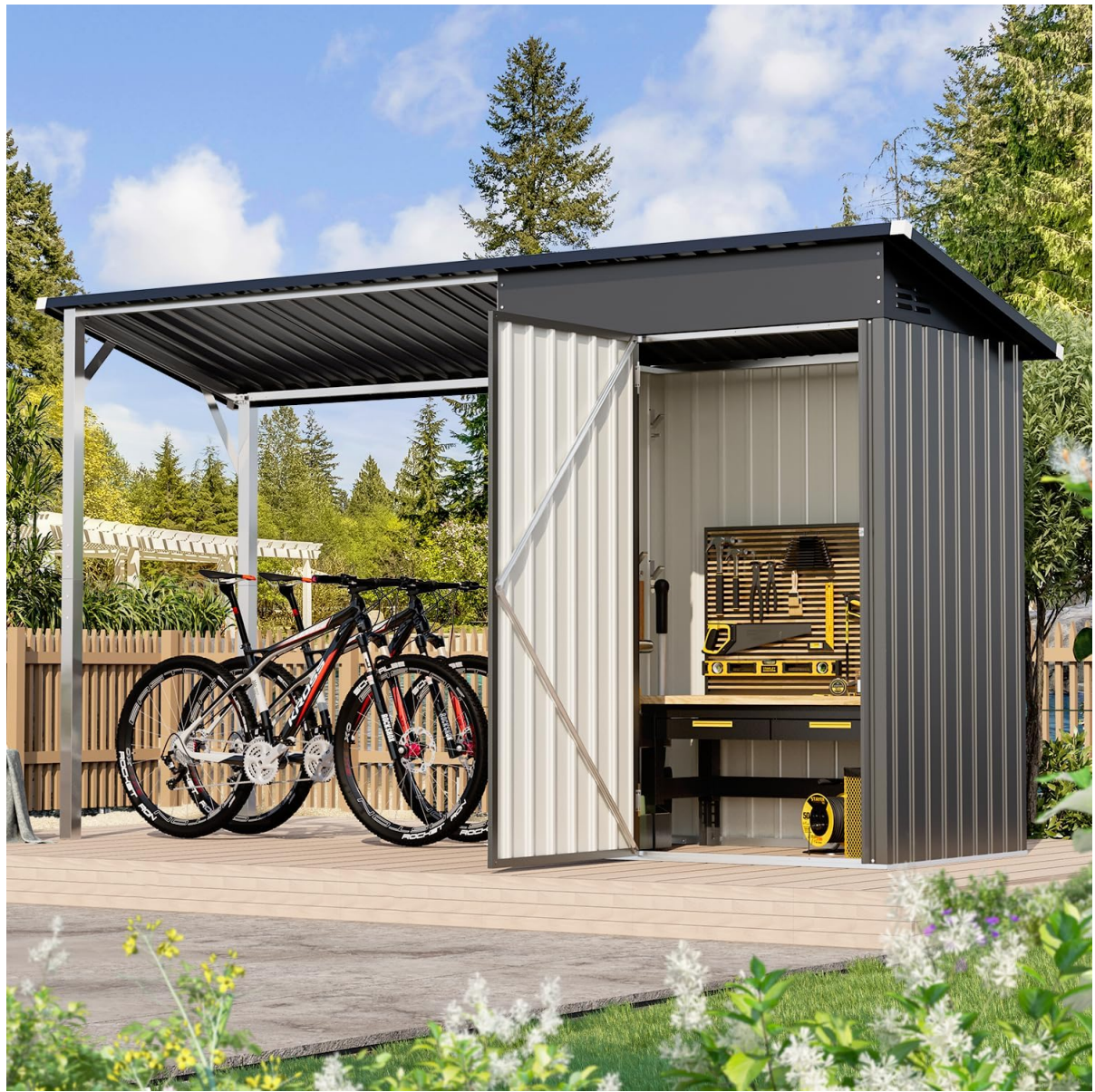
Image Description: This image depicts the shed and pergola in an outdoor setting. Two bicycles are conveniently stored under the open-sided pergola, highlighting its utility for frequently used items. The shed door is open, showcasing an organized interior with a workbench, emphasizing its potential as a secure storage and workspace.