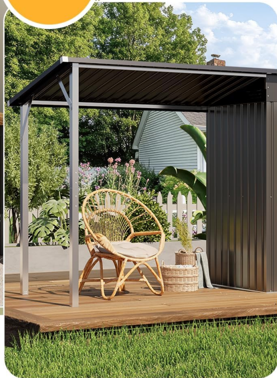
Image Description: This image illustrates the dual functionality of the product. On the left, the enclosed shed is shown with a workbench and tools, demonstrating its use as a functional workspace or secure storage. On the right, the open-sided pergola area features a chair, suggesting its use as a shaded relaxation or utility space.