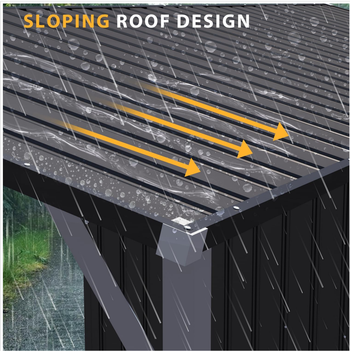
Image Description: This close-up image focuses on the shed's sloping roof design. Arrows are overlaid on the roof surface, illustrating the intended path of water runoff during rainfall, which helps prevent accumulation and ensures effective drainage.