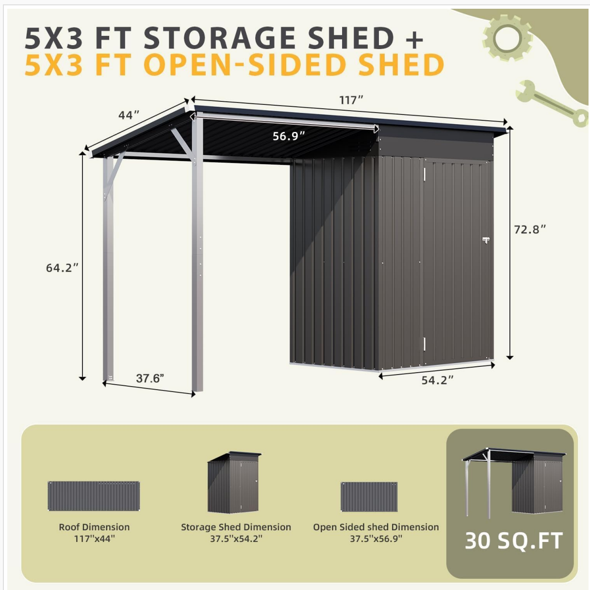
Image Description: This diagram illustrates the overall dimensions of the AECOJOY 10' x 4' outdoor storage solution. It shows the roof dimension as 117"x44", the storage shed dimension as 37.5"x54.2", and the open-sided shed dimension as 37.5"x56.9". The total floor area is indicated as 30 sq. ft. This visual aid is crucial for understanding the product's footprint and component sizes during assembly.