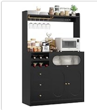
Figure 4.5.1: Adjustable shelf pin holes for customizable storage.