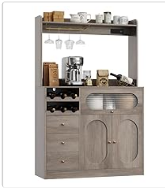
Figure 4.4.1: Example of a hinge mechanism for cabinet doors.