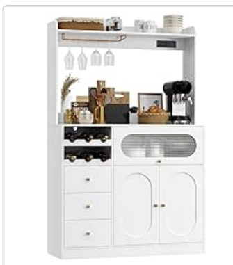
Figure 4.7.1: Detachable hooks for hanging items.