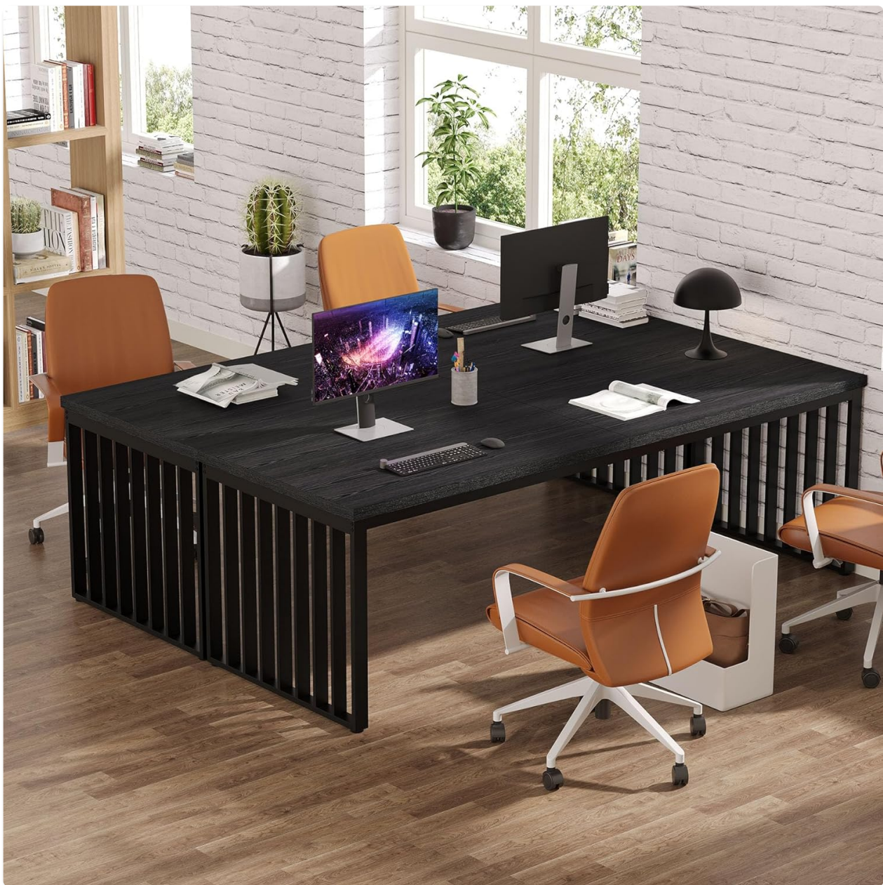
Image 5.2: The desk configured as a meeting or conference table, demonstrating its capacity for collaborative use.