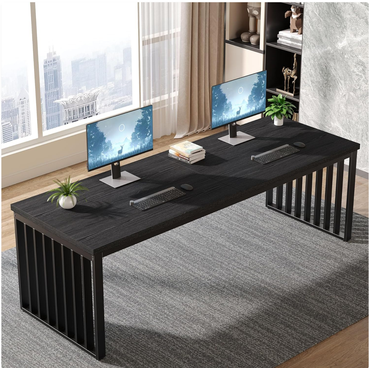
Image 5.1: The desk providing ample space for two separate workstations, each with a monitor and accessories.