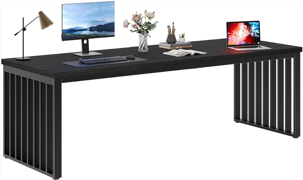
Image 3.1: A detailed view of the desk's black wood grain tabletop and the robust powder-coated metal frame, highlighting the quality of materials.