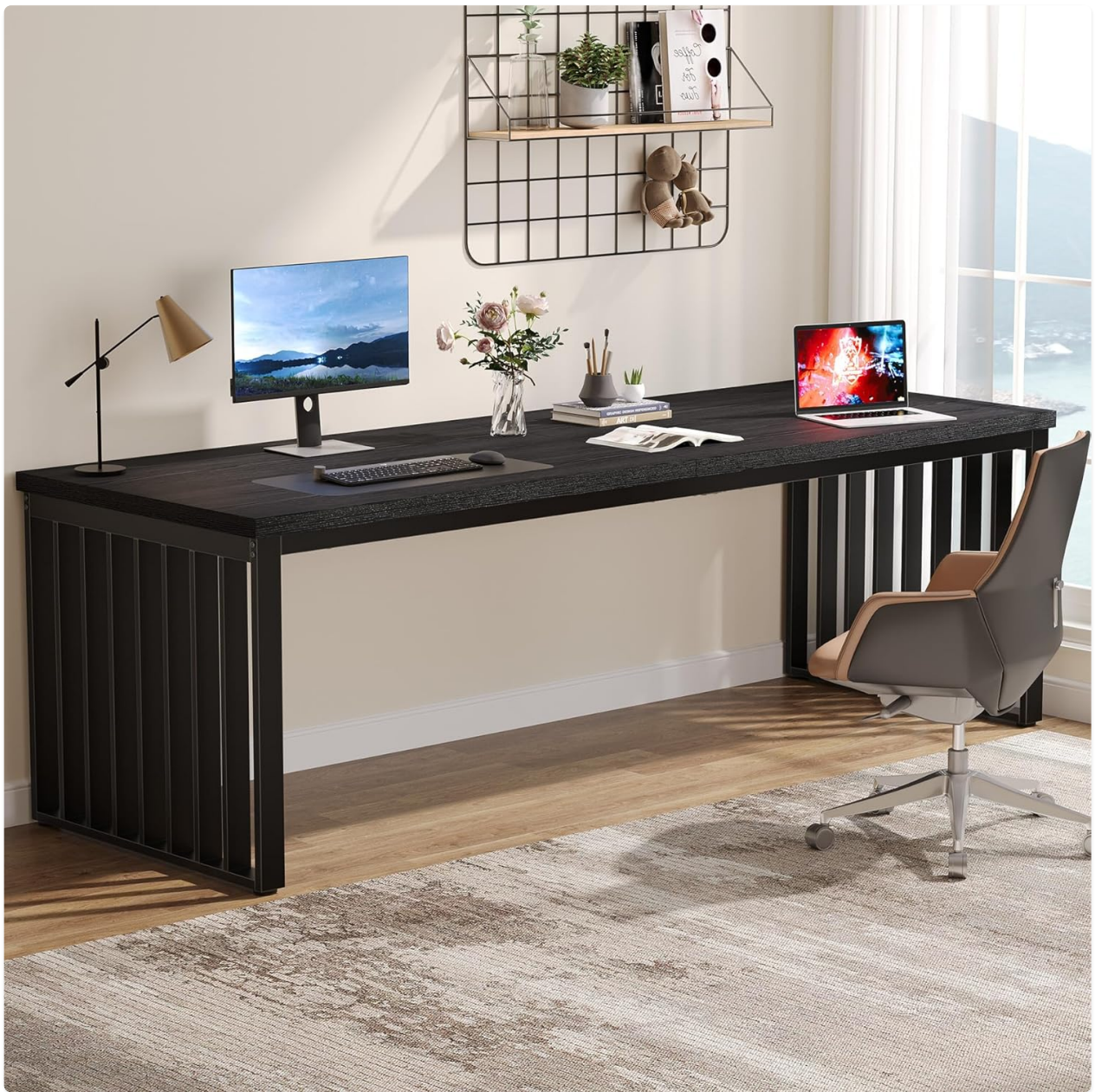
Image 1.1: The Tribesigns 180 cm Large Computer Desk, Model YS0270, showcasing its spacious design suitable for a home office setup with a monitor, laptop, and lamp.