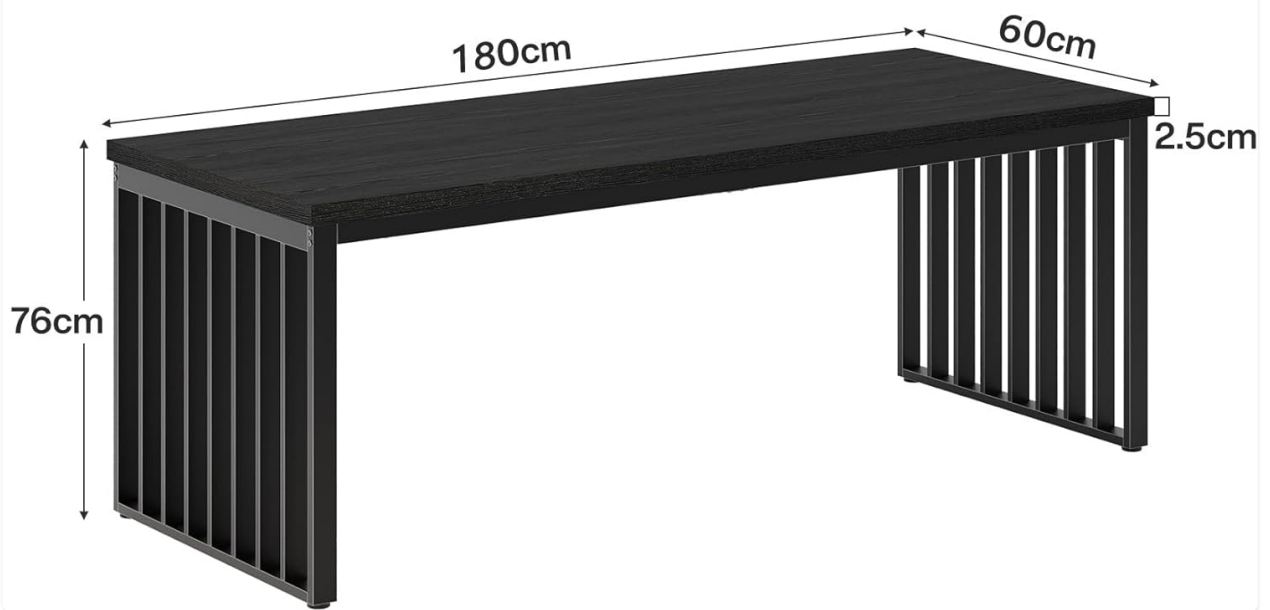
Image 8.1: Dimensional diagram of the Tribesigns 180 cm desk, illustrating its length, width, and height.