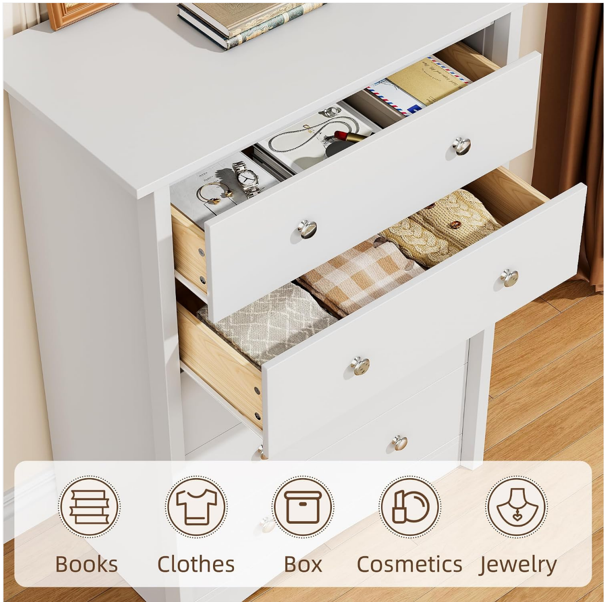
Image: The dresser with its drawers partially open, revealing various organized items such as books, clothes, and accessories.