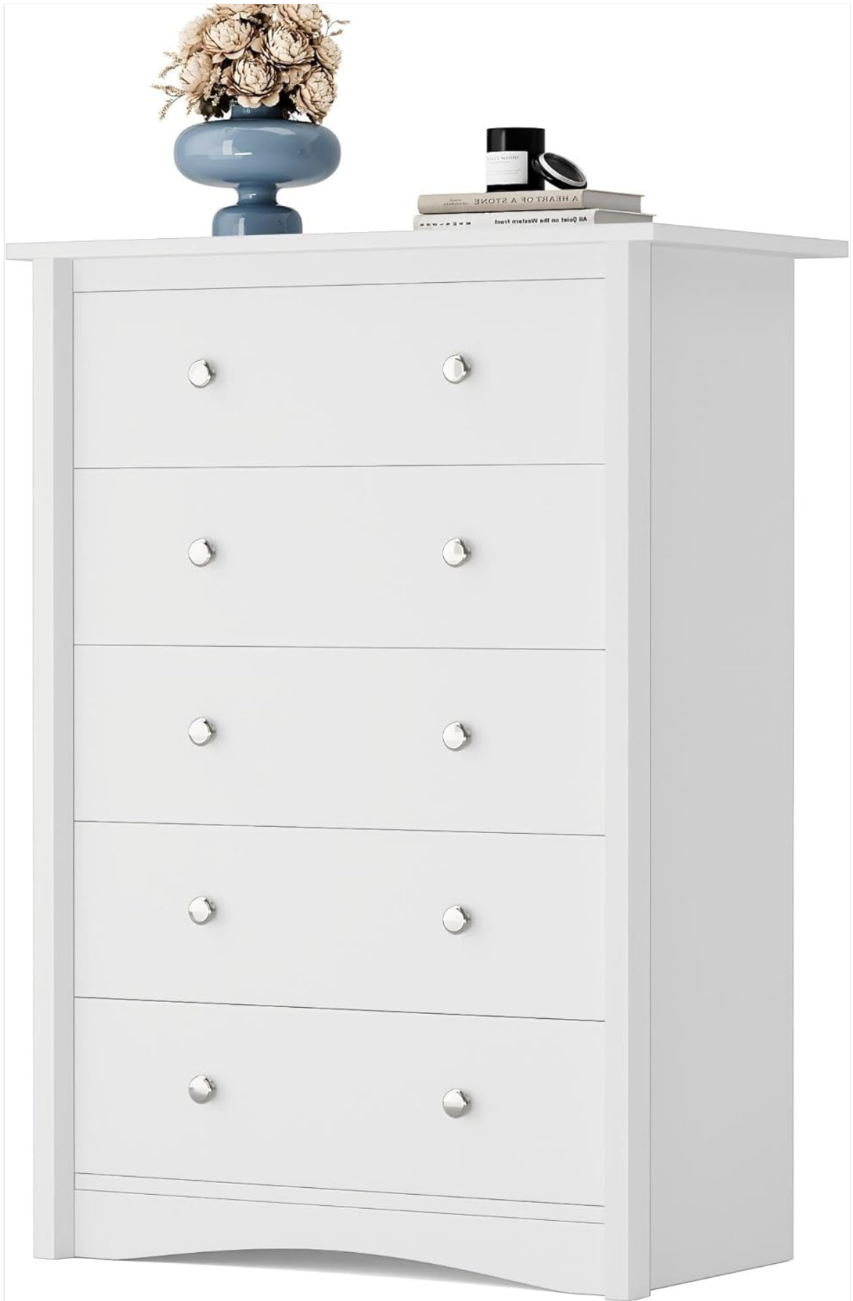
Image: The YESHOMY Tall Dresser, a white unit with five drawers and silver knobs, suitable for various room settings.