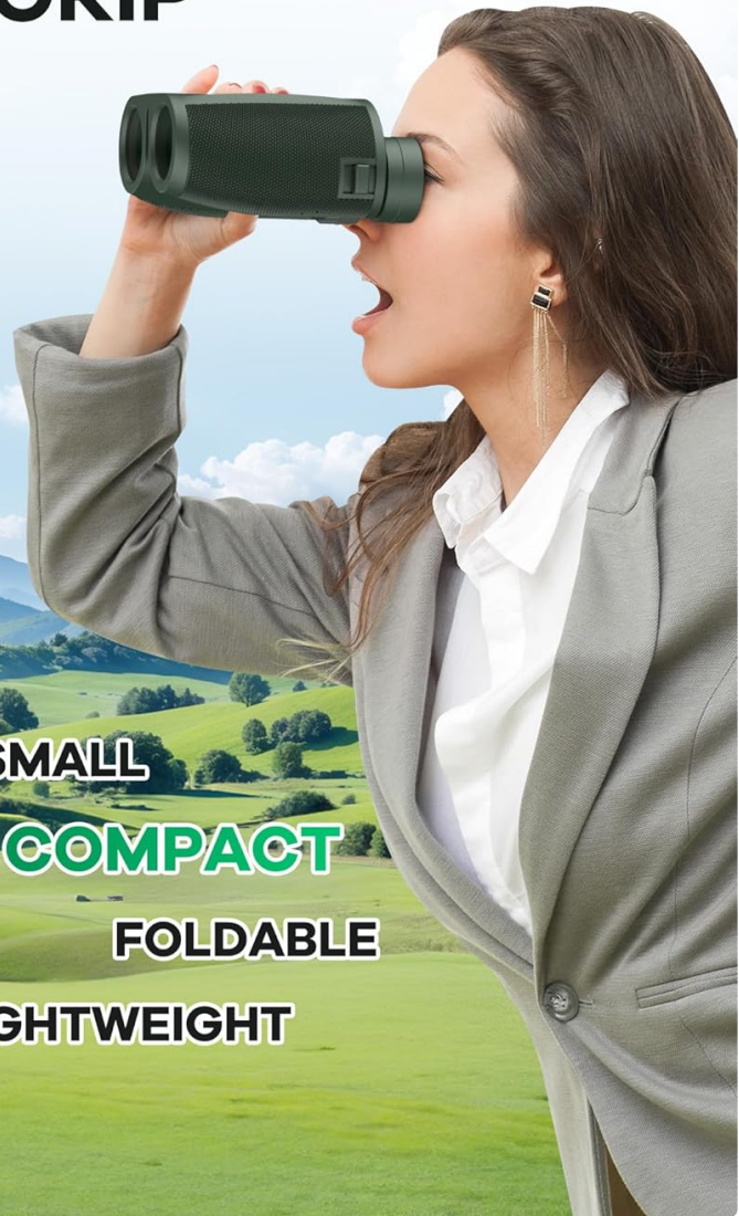
Figure 3: Binoculars demonstrating lightweight and ergonomic design.