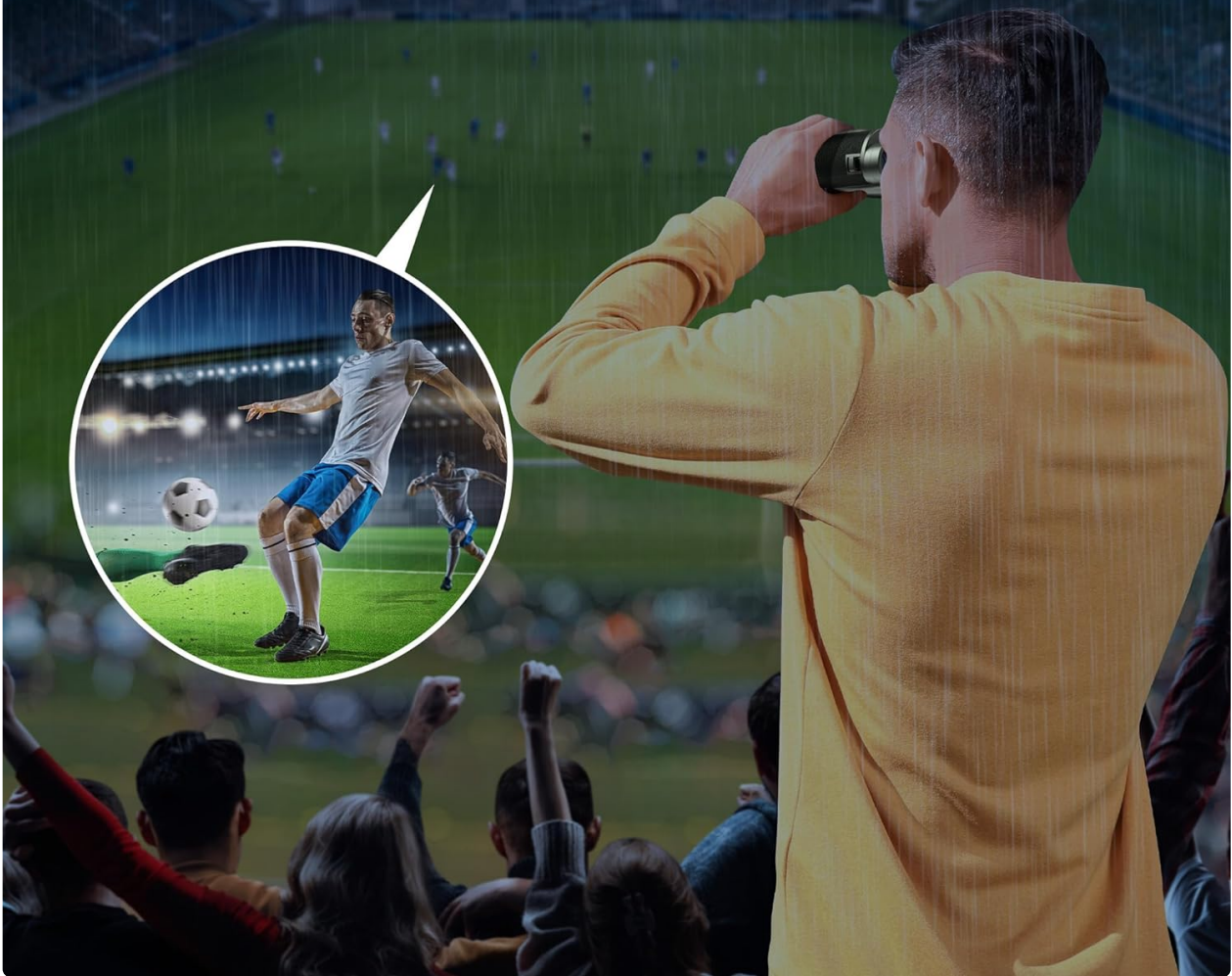
Figure 4: Binoculars in use during rain, showcasing IPX7 waterproof and fogproof capabilities.

You can watch the match even on rainy days