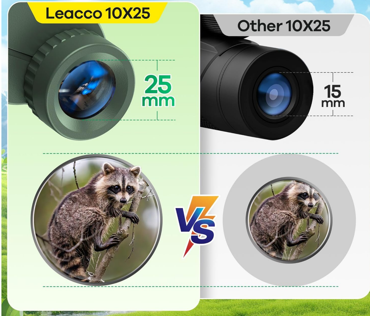
Figure 6: Comparison highlighting the 25mm wider eyepieces for improved viewing comfort.