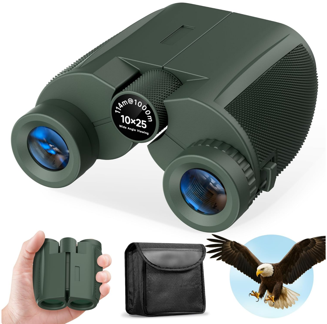
Figure 1: Leacco 10x25 Compact Binoculars.