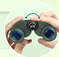
Figure 7: Detailed diagram of the easy-to-use focus system.