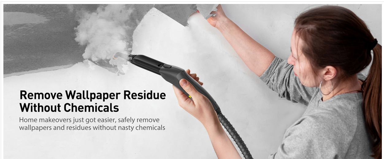
Image: A person using the steam cleaner to remove wallpaper residue from a wall, demonstrating chemical-free removal.