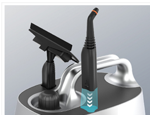
Image: A hand demonstrating how to attach a nozzle accessory to the steam cleaner's hose.