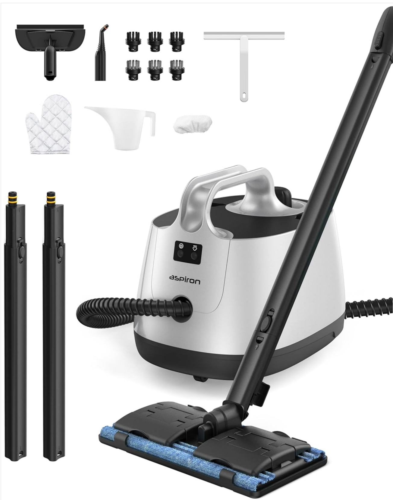
Image: Aspiron Steam Cleaner unit with all included accessories, including floor brush, ironing brush, glass brush, various round brushes, extension tubes, big nozzle, towels, carpet glider, gloves, squeegee, measuring cup, funnel, and cleaning wipe.