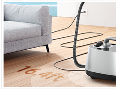
Image: The steam cleaner's power cord laid out on a wooden floor, illustrating its 16.4ft (5M) length.