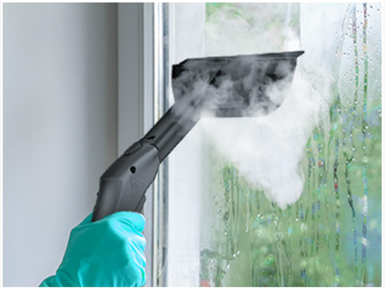
Image: The steam cleaner with a squeegee attachment being used to clean a window, with steam visible.