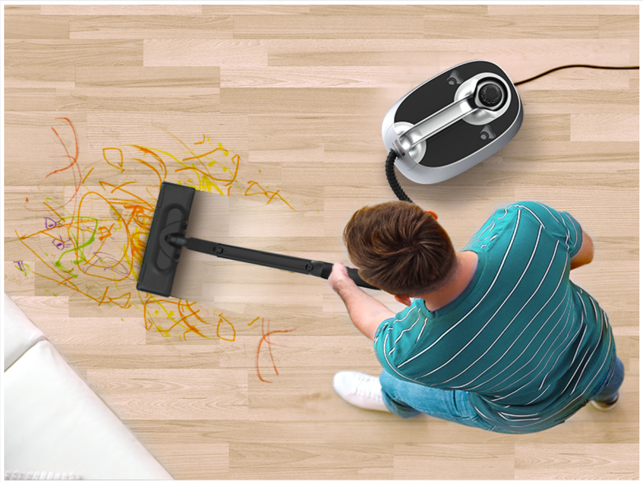
Image: A person using the steam cleaner with the floor mop attachment to clean a wooden floor.