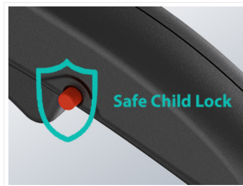
Image: A detailed view of the red child lock button on the steam cleaner's handle, indicating its safety function.