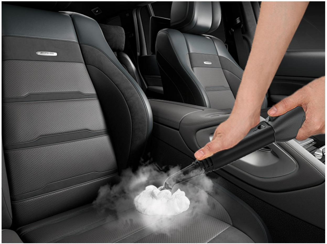
Image: The steam cleaner being used to clean a car seat, with steam visible on the upholstery.