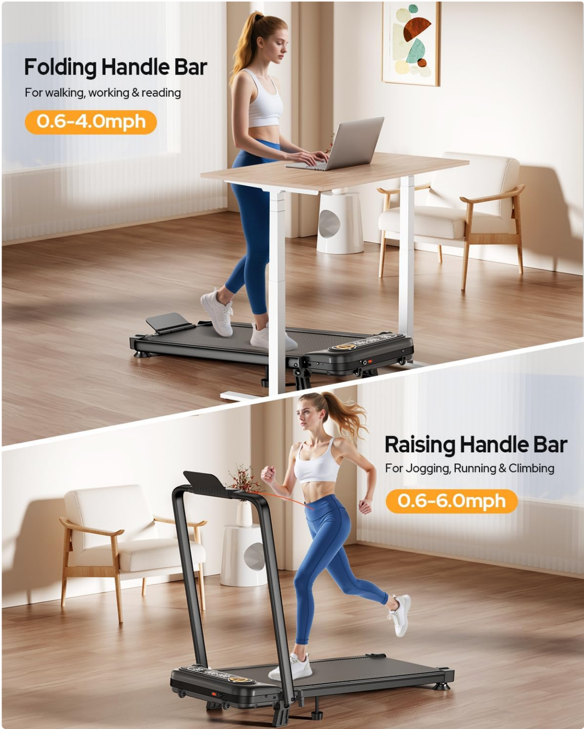
Figure 3.1: The handlebar can be folded down for under-desk use or raised for jogging/running.