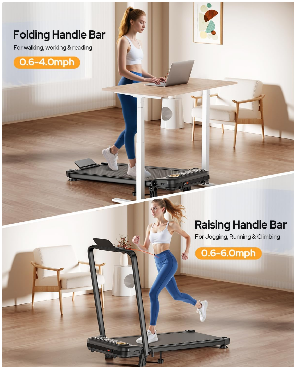
Figure 4.2: The treadmill supports both walking pad and traditional treadmill modes.