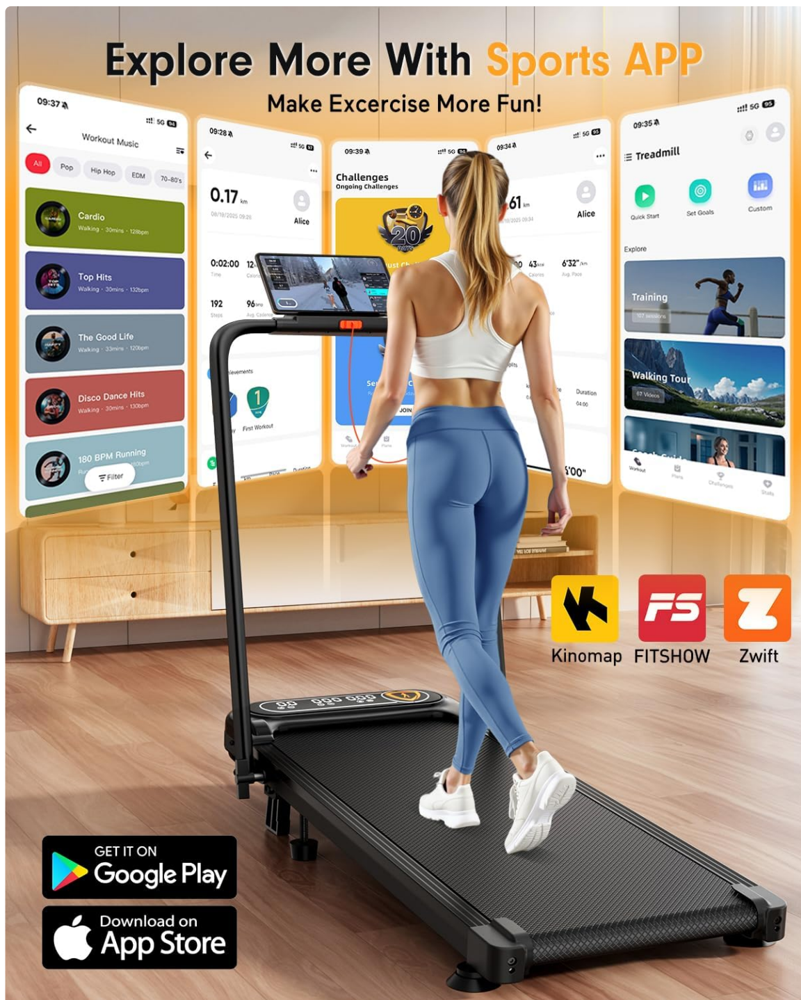
Figure 4.4: Explore more with the dedicated fitness app for interactive workouts.

Your browser does not support the video tag.