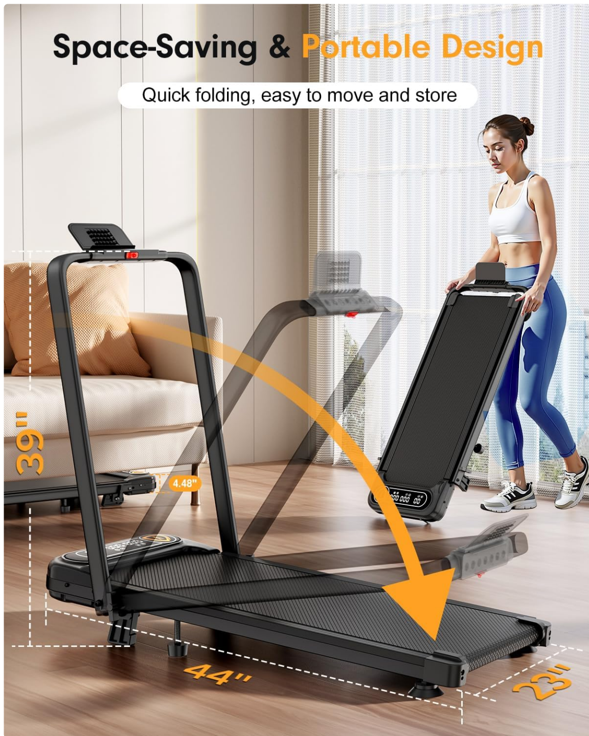
Figure 6.1: The treadmill's space-saving design allows for easy storage.