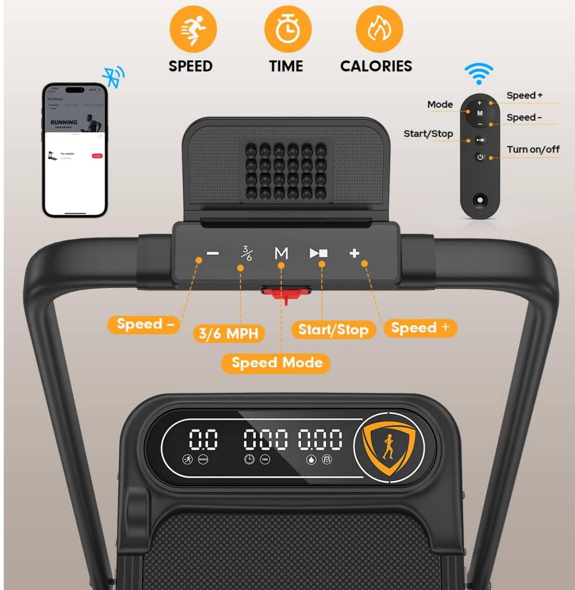
Figure 4.1: Ultra-clear transparent LED display and control buttons on the handlebar.