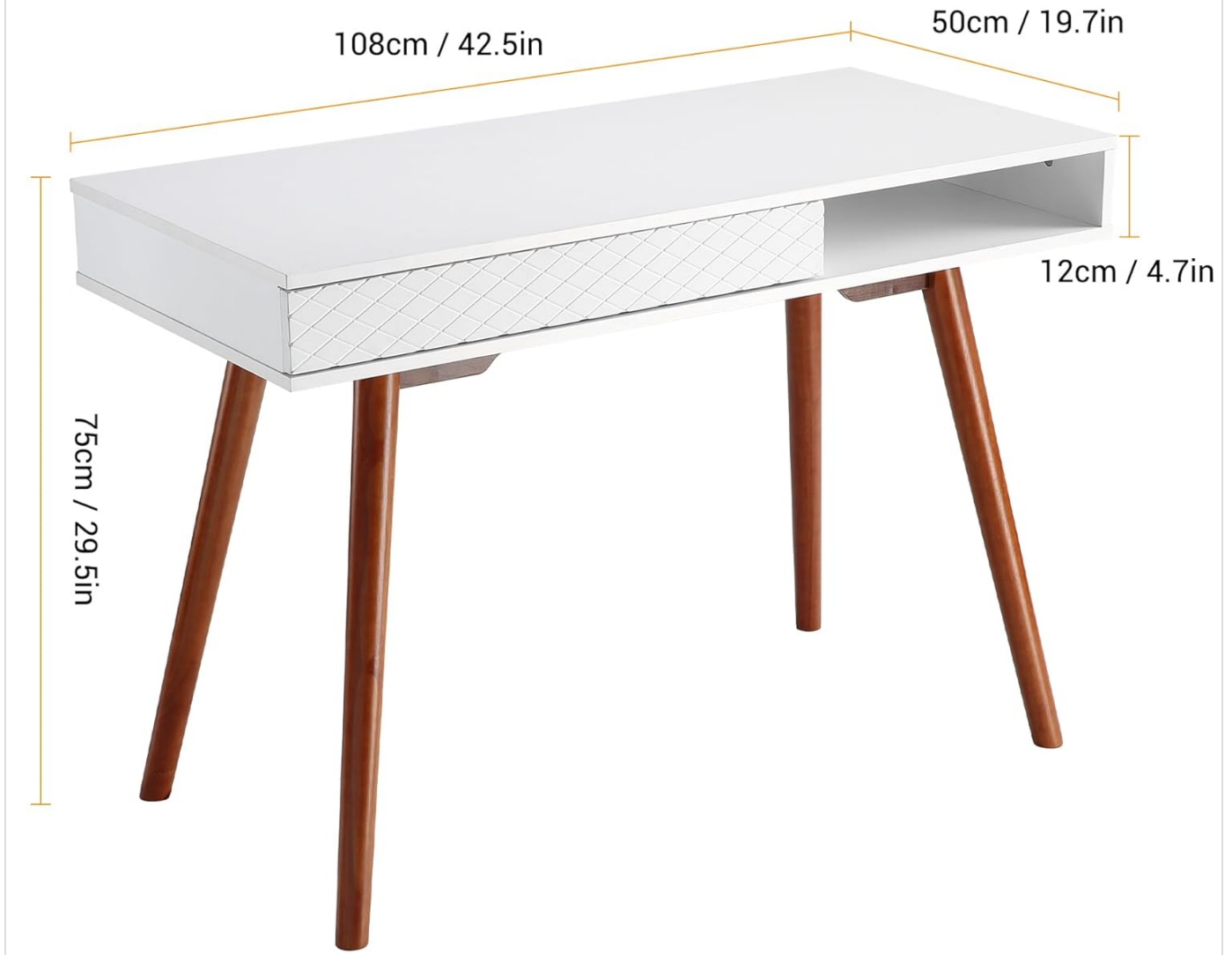
Image: A diagram illustrating the precise dimensions of the Garvee desk, including its width (42.5 inches / 108 cm), depth (19.7 inches / 50 cm), and height (29.5 inches / 75 cm). This provides critical measurement information for users.