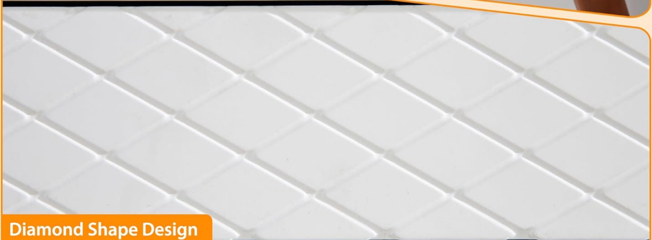
Image: A detailed view of the desk's integrated drawer and open storage cubby, showing how items can be organized and stored. The drawer features a distinctive rhombic-embossed pattern.