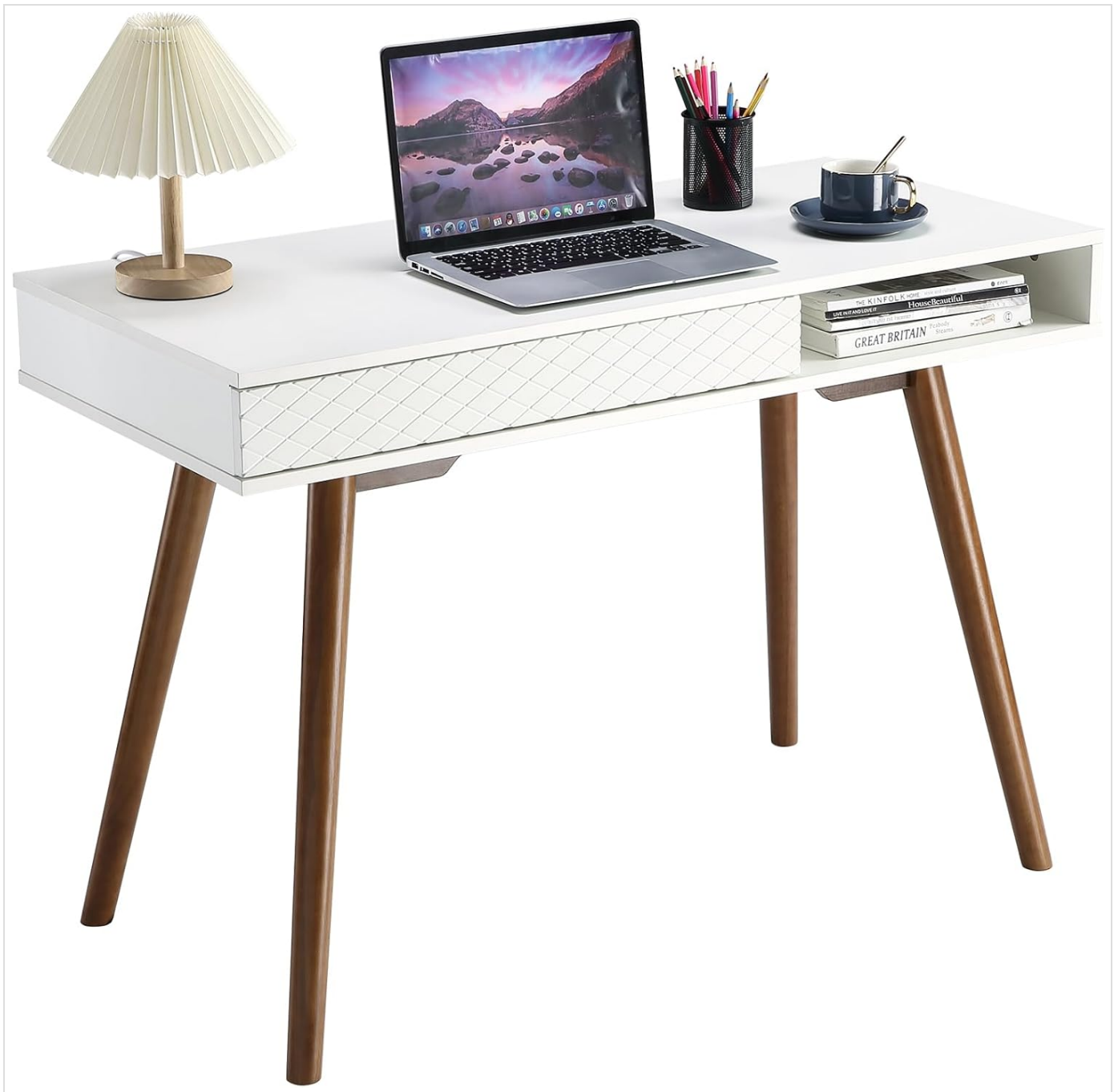
Image: The Garvee desk in a typical home office setup, featuring a laptop, a small lamp, and various office accessories. This demonstrates the desk's practical application.