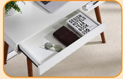
Plenty of space