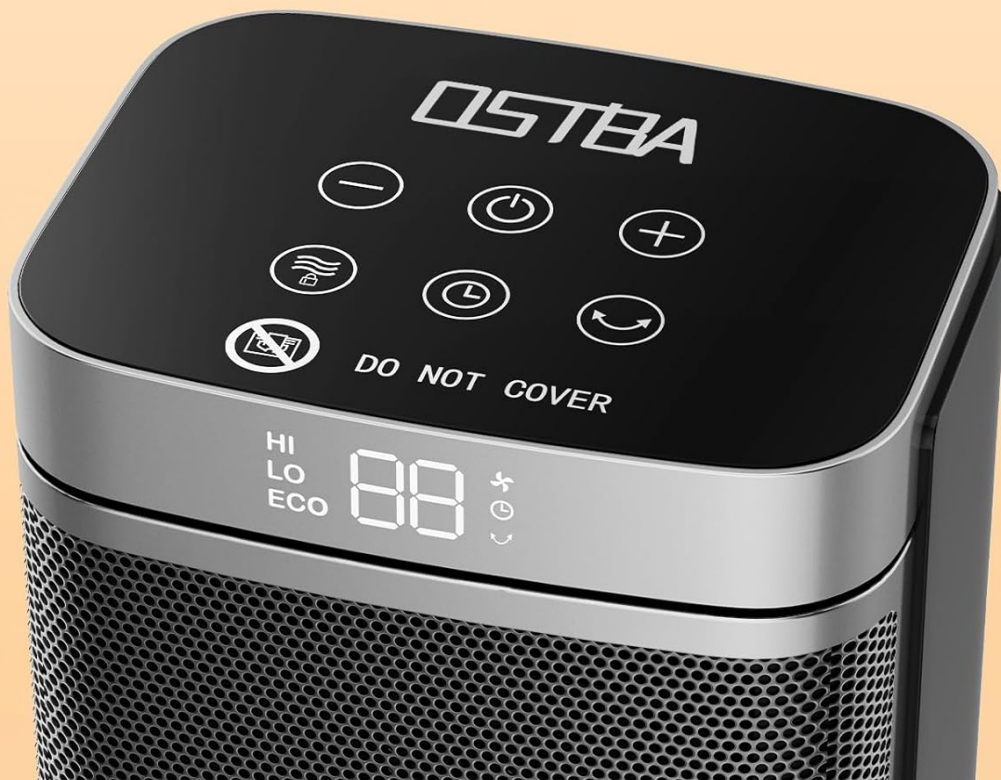
Figure 3: Multi-Functional Control Panel