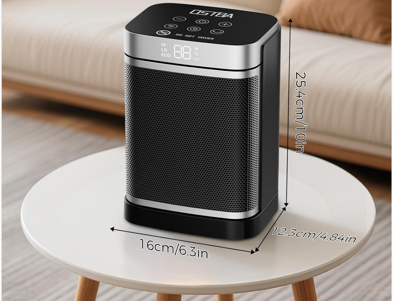
Figure 4: Compact Dimensions for Easy Placement