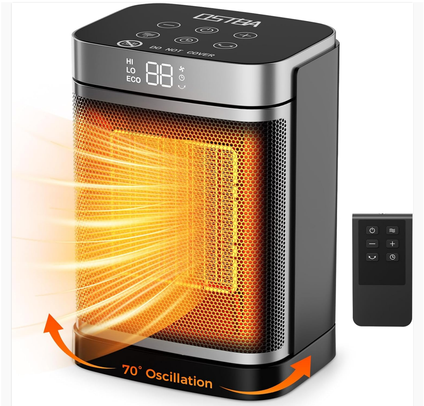
Figure 6: 70° Oscillation for Wide Coverage