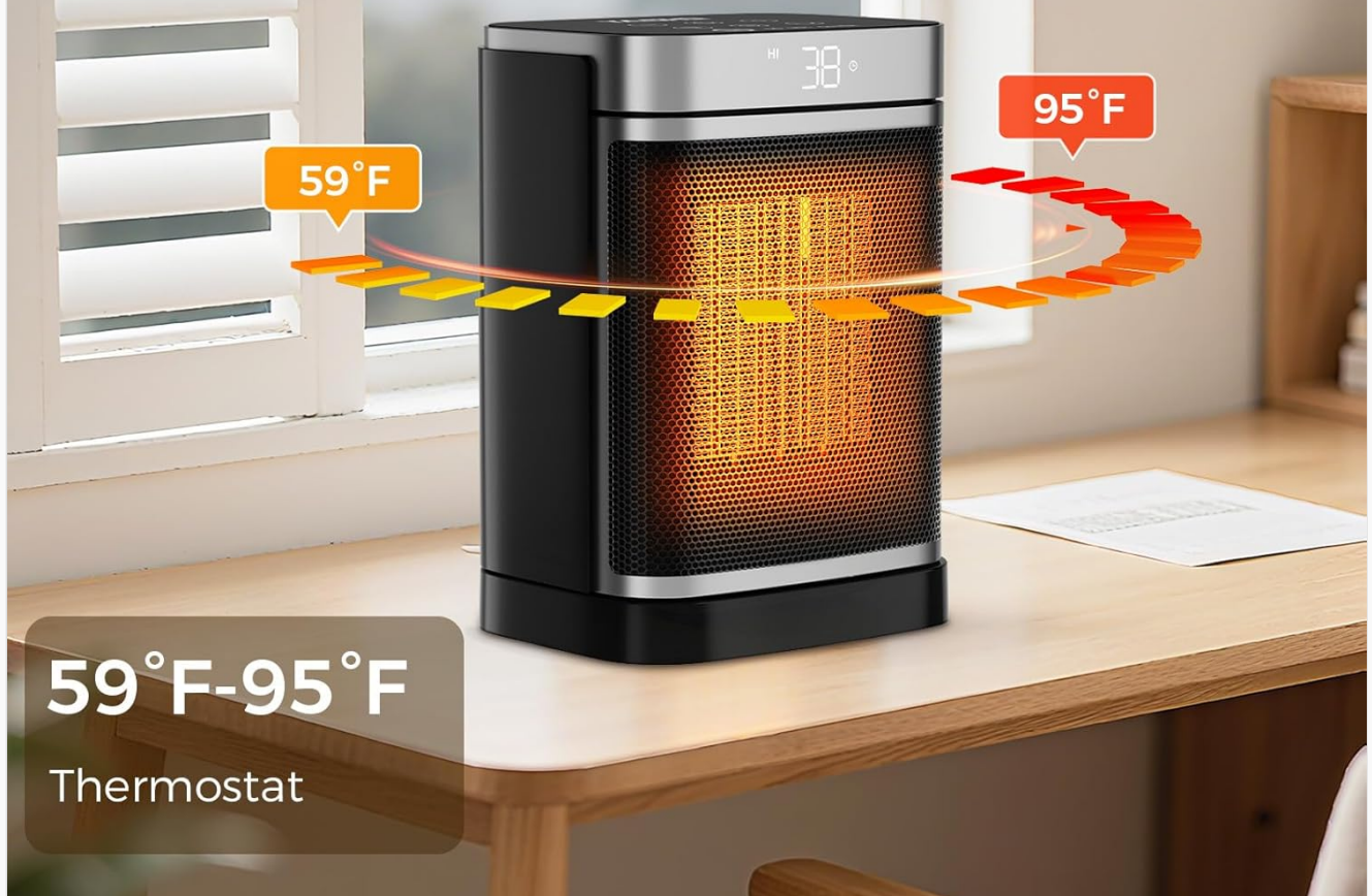
Figure 5: Intelligent Temperature Control

Automatic adjustment of heating power according to the difference between the set temperature and the room temperature