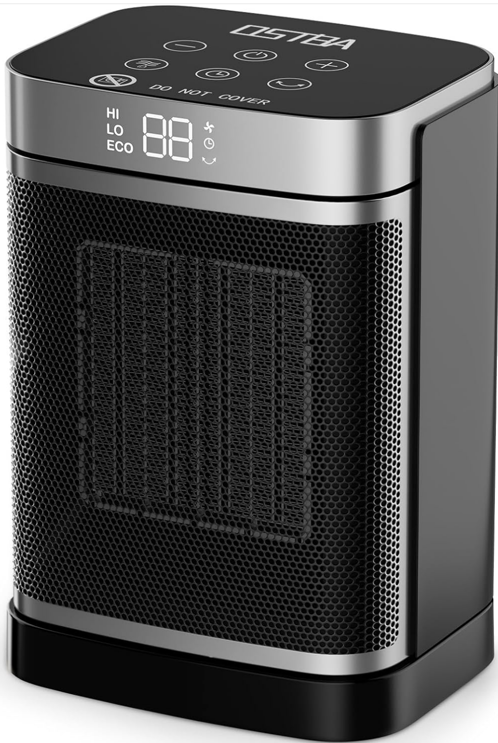
Figure 2: OSTBA PTC-907B Space Heater and Remote Control