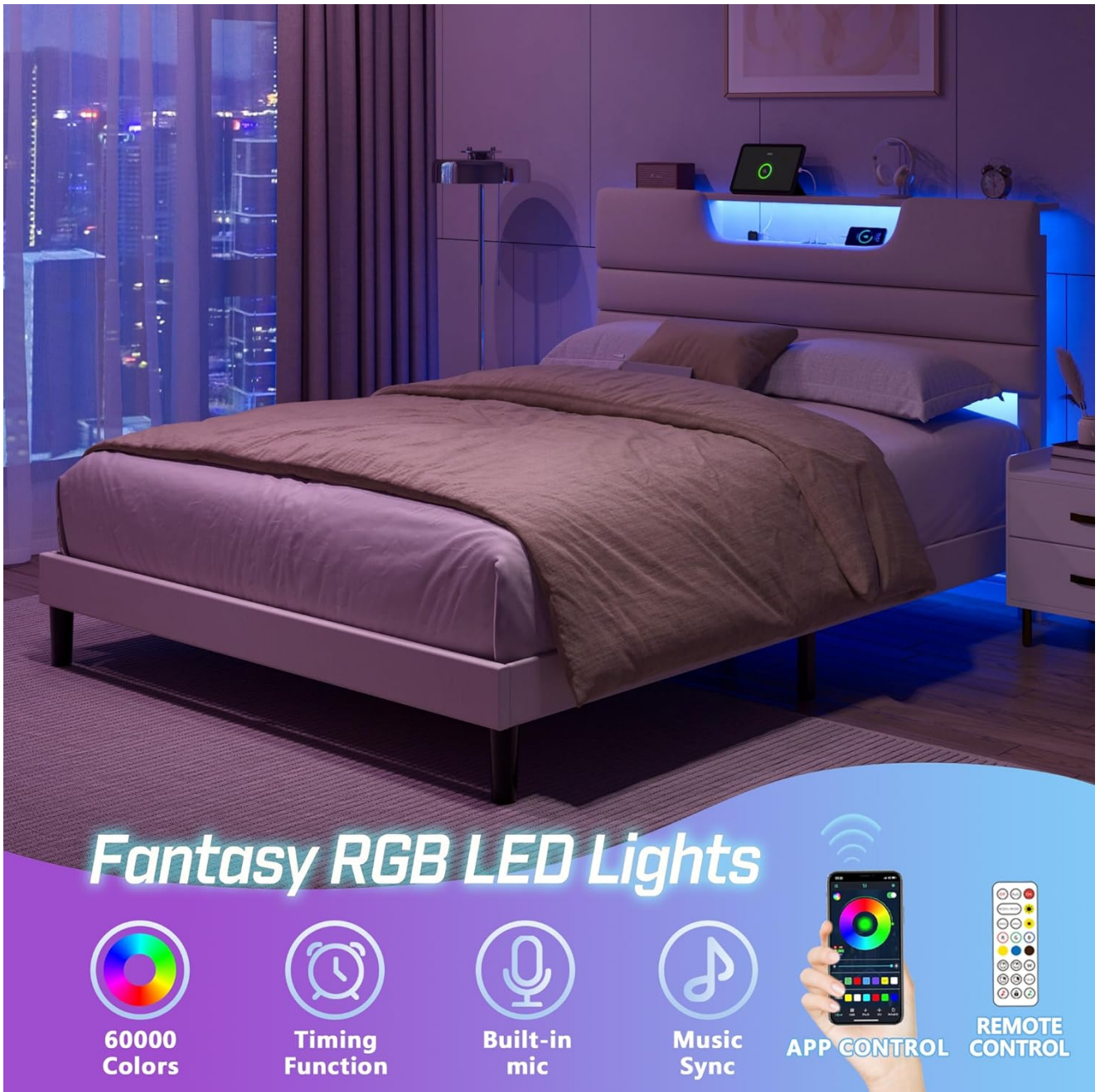
Image: RGB LED lighting features and control options.

Your browser does not support the video tag.