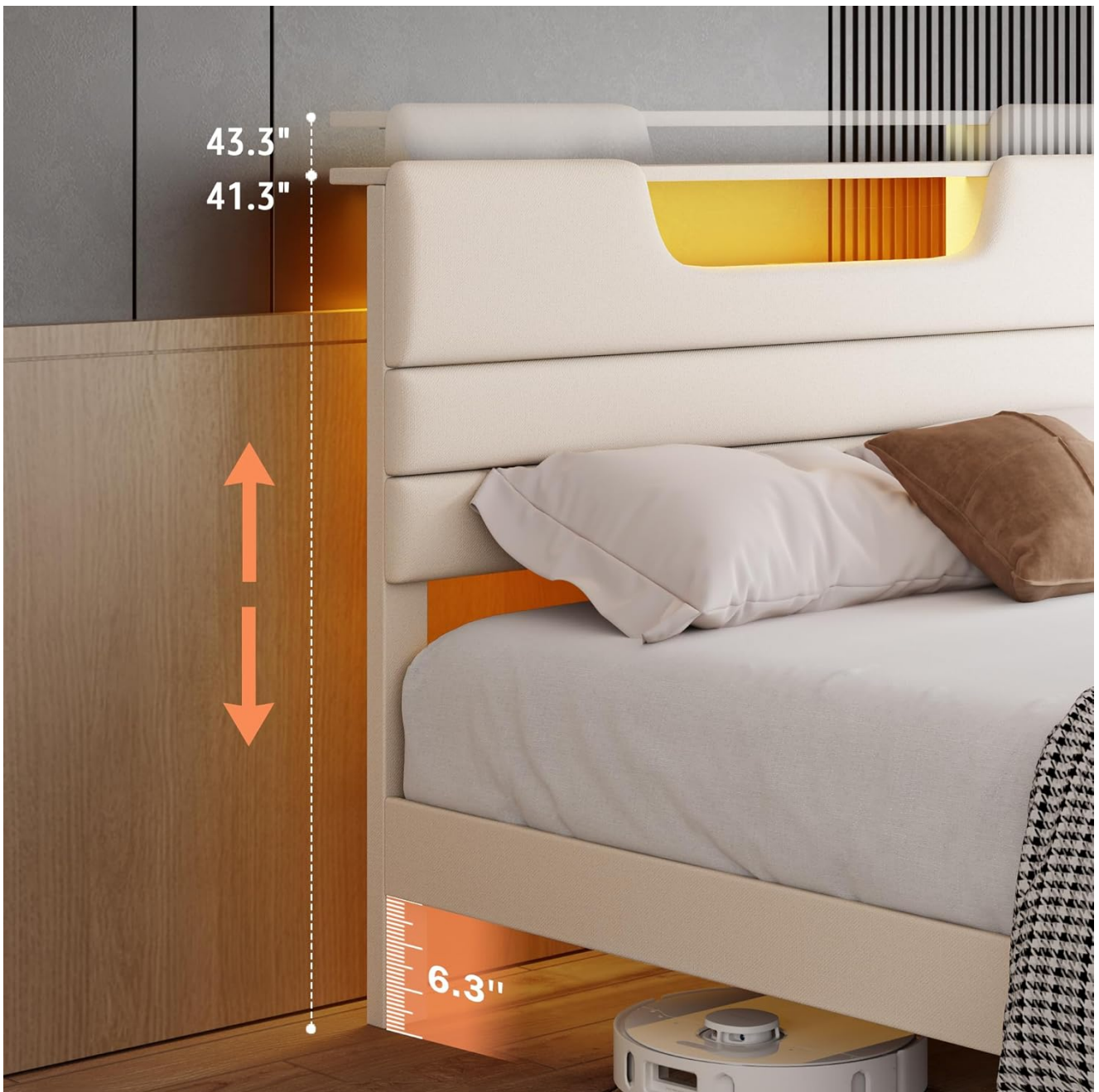
Image: Adjustable headboard height feature.