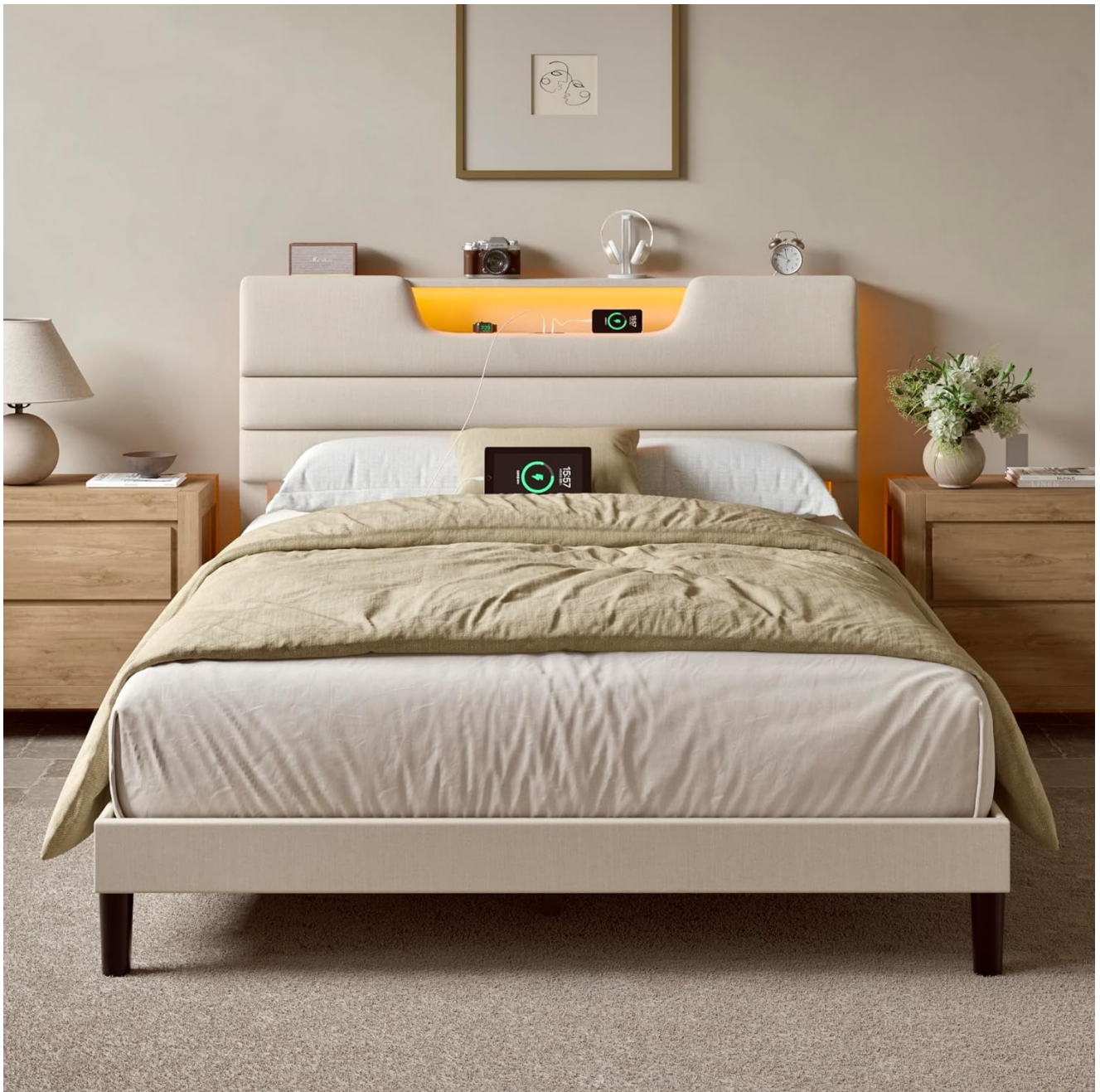
Image: Under-bed clearance for easy cleaning.