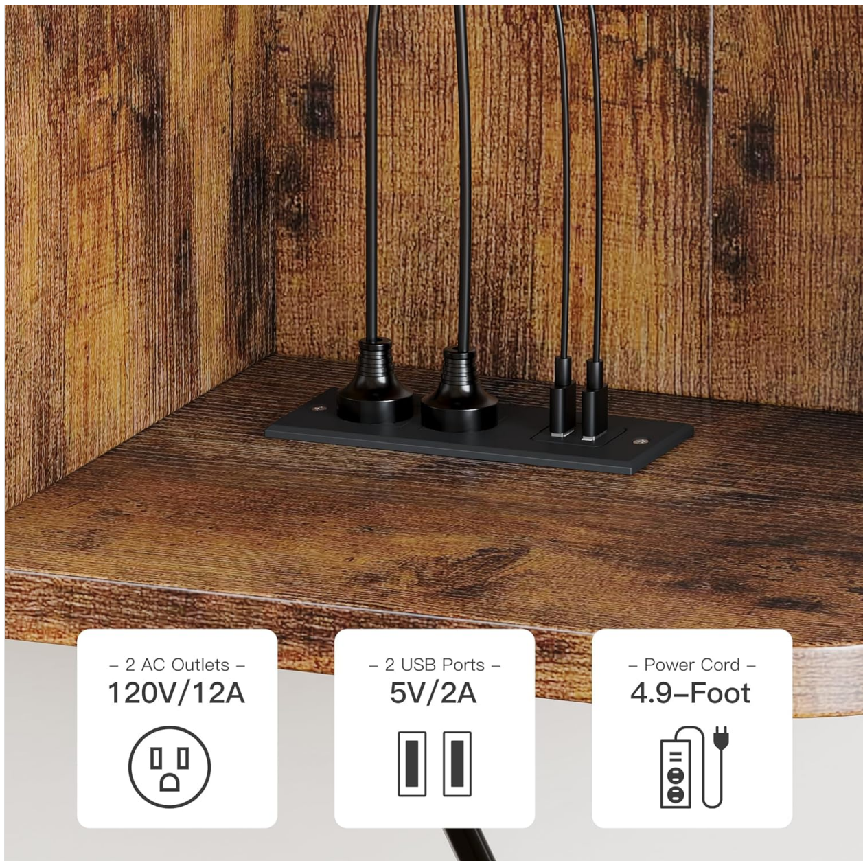
Figure 5.4.1: Integrated Power Outlet with 2 AC Outlets and 2 USB Ports.