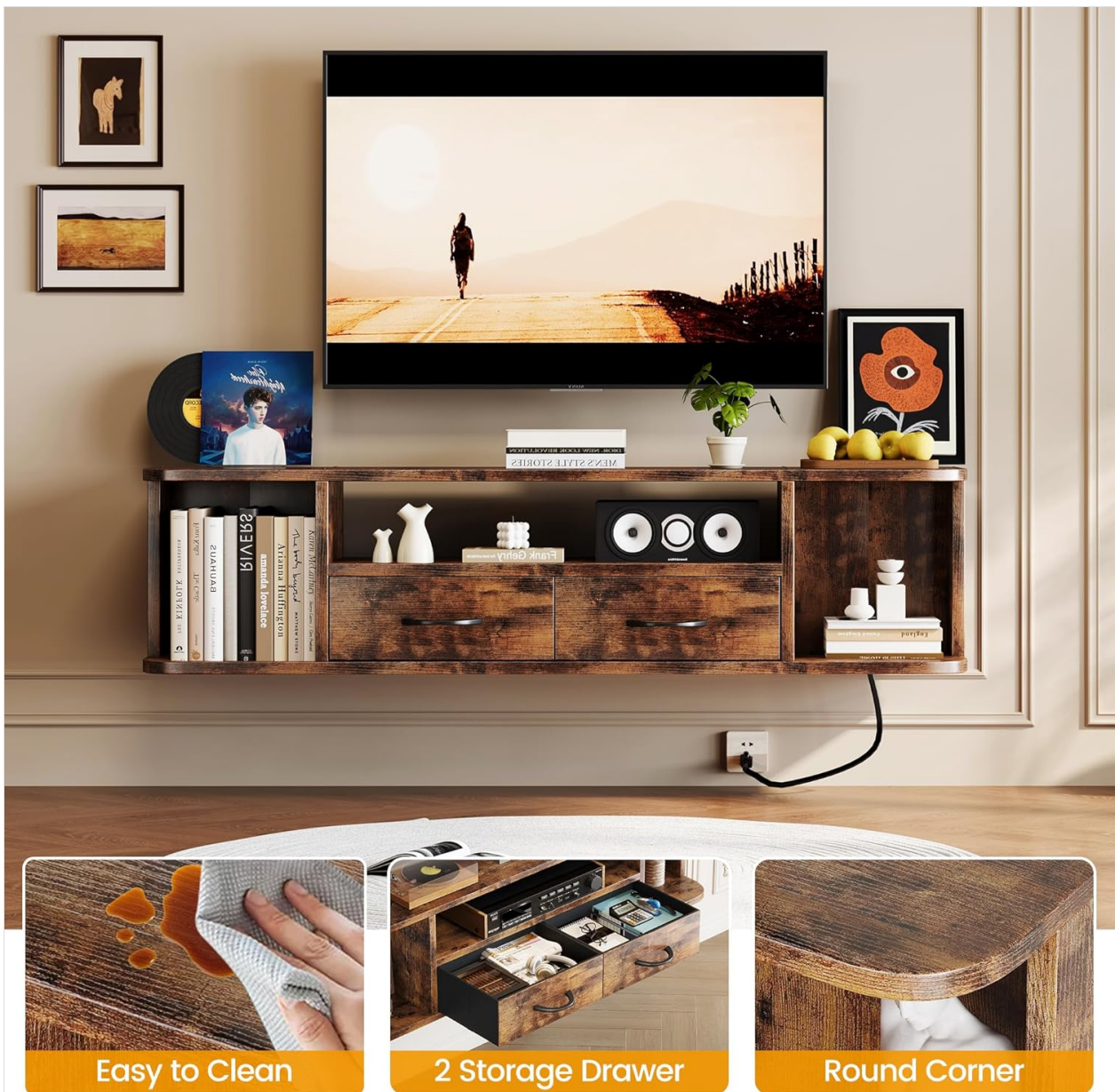
Figure 7.1.1: Easy to Clean Surface.