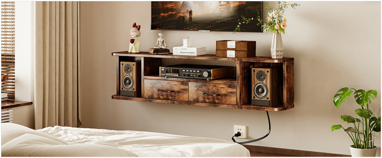
Figure 6.2.1: Storage Options with Open Shelves and Drawers.