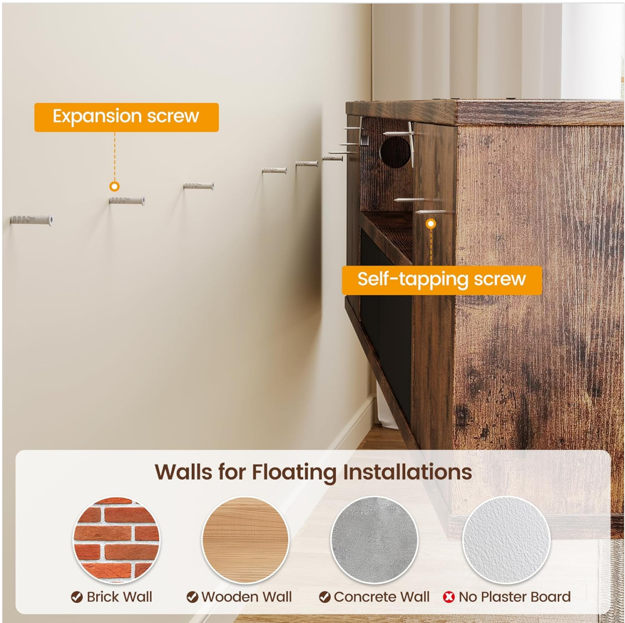
Figure 5.5.1: Wall Mounting Hardware and Compatible Wall Types.

holes/anchors on the wall. Secure the stand to the wall using the provided self-tapping screws or appropriate hardware for your wall type. Tighten all screws firmly but do not overtighten.