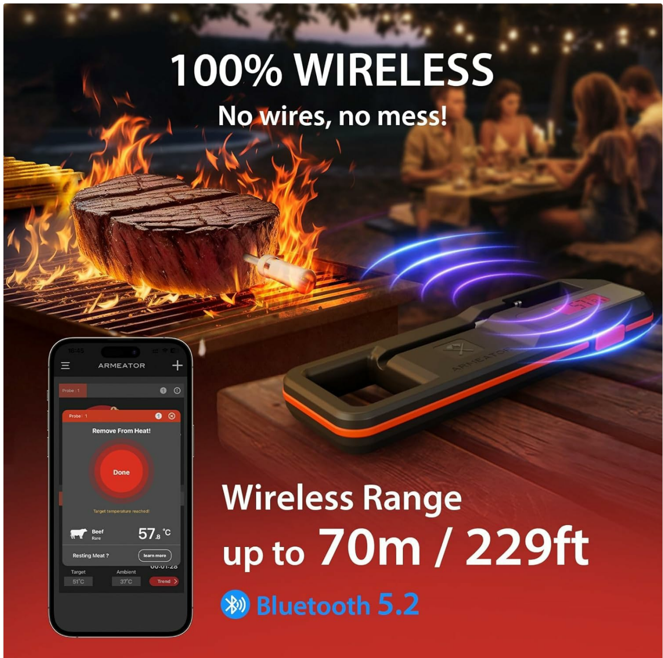
Image: The ARMEATOR A1 thermometer showcasing its 100% wireless capability and Bluetooth 5.2 range of up to 229ft, ideal for outdoor grilling.