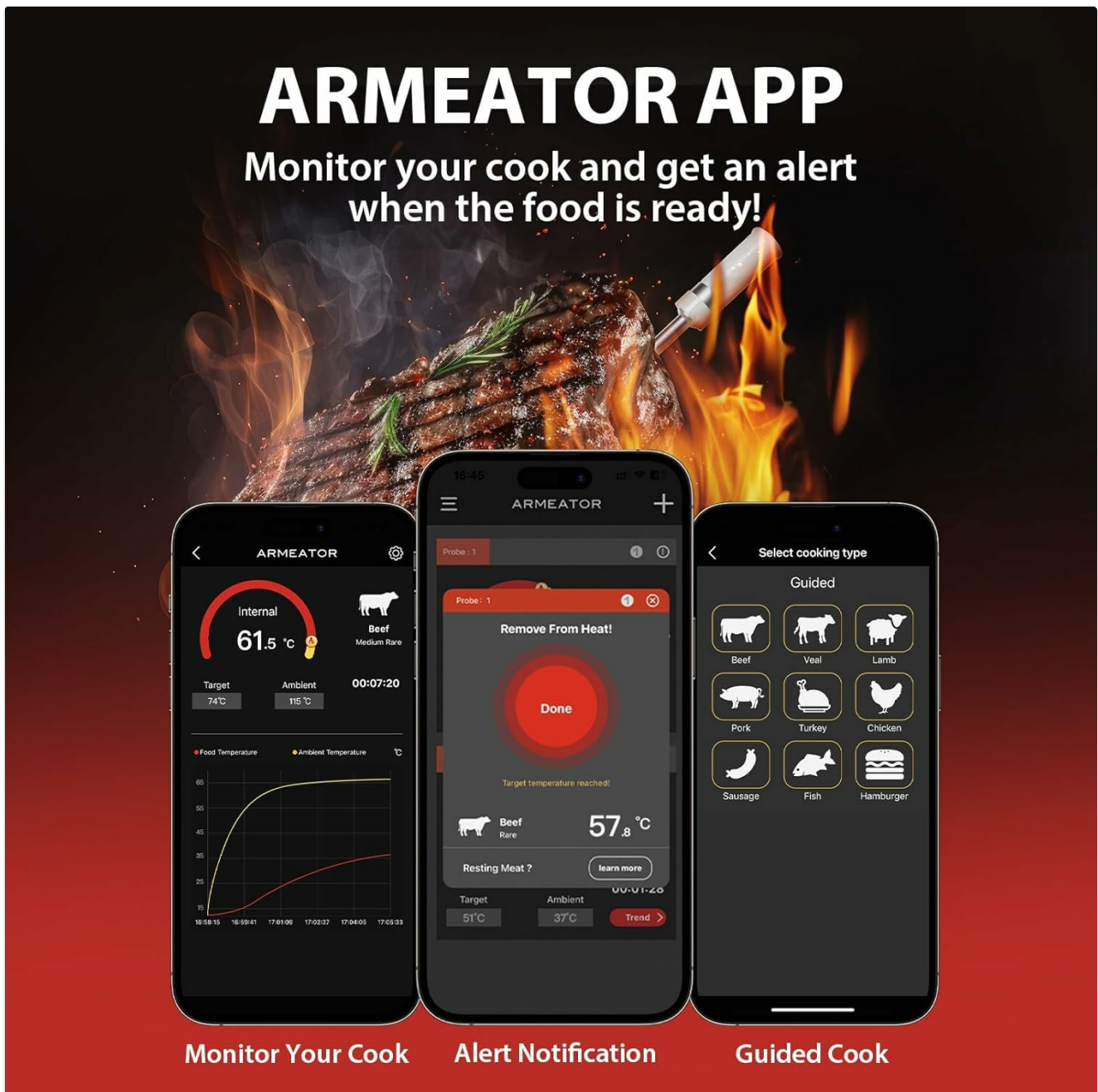
Image: The ARMEATOR app interface, demonstrating features like real-time temperature monitoring, alert notifications, and a guided cooking system for various meat types.

probe from the dock to activate it and allow the app to detect it. Follow on-screen prompts to complete pairing.