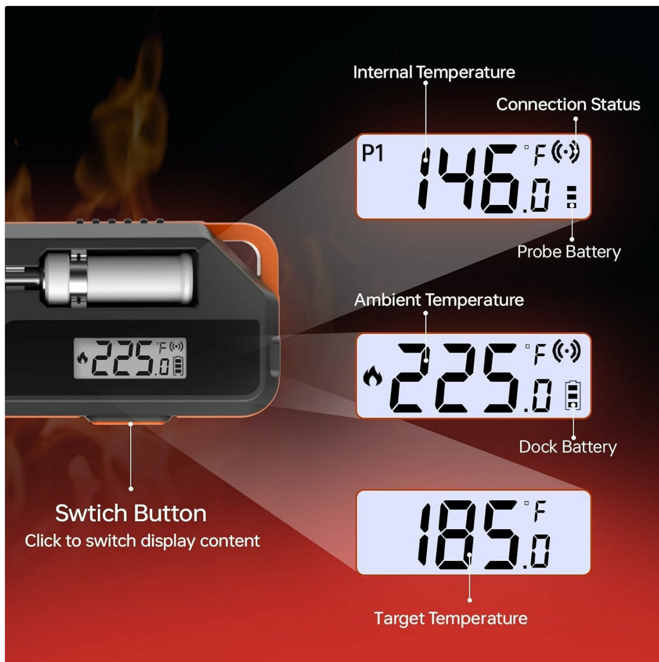
Image: The ARMEATOR A1 dock display, illustrating the various readings available including internal temperature, ambient

Press the switch button on the dock to cycle through different display contents.