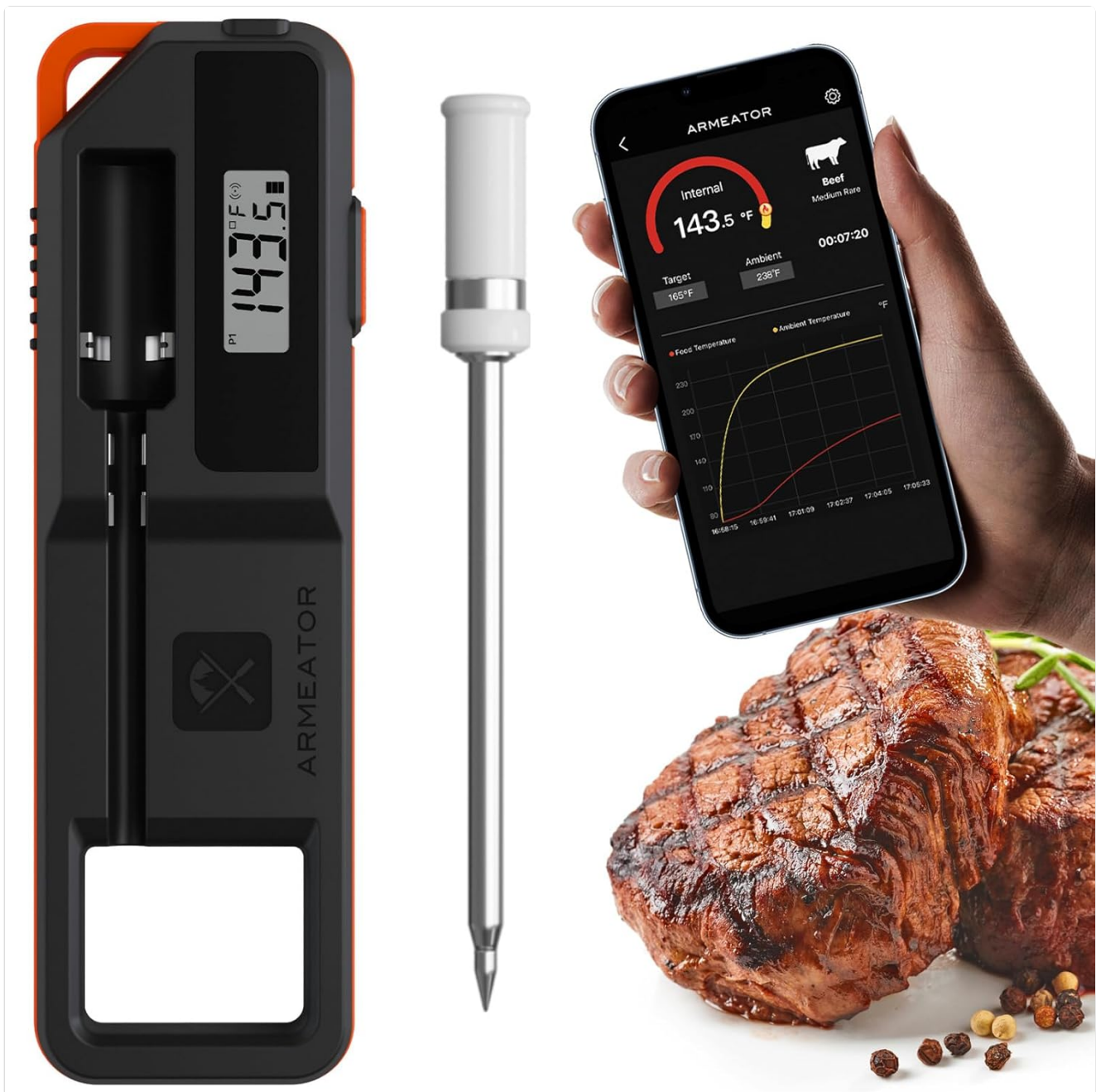
Image: The ARMEATOR A1 Smart Wireless Meat Thermometer system, including the probe, charging dock, and a smartphone displaying the companion app's interface with temperature readings.